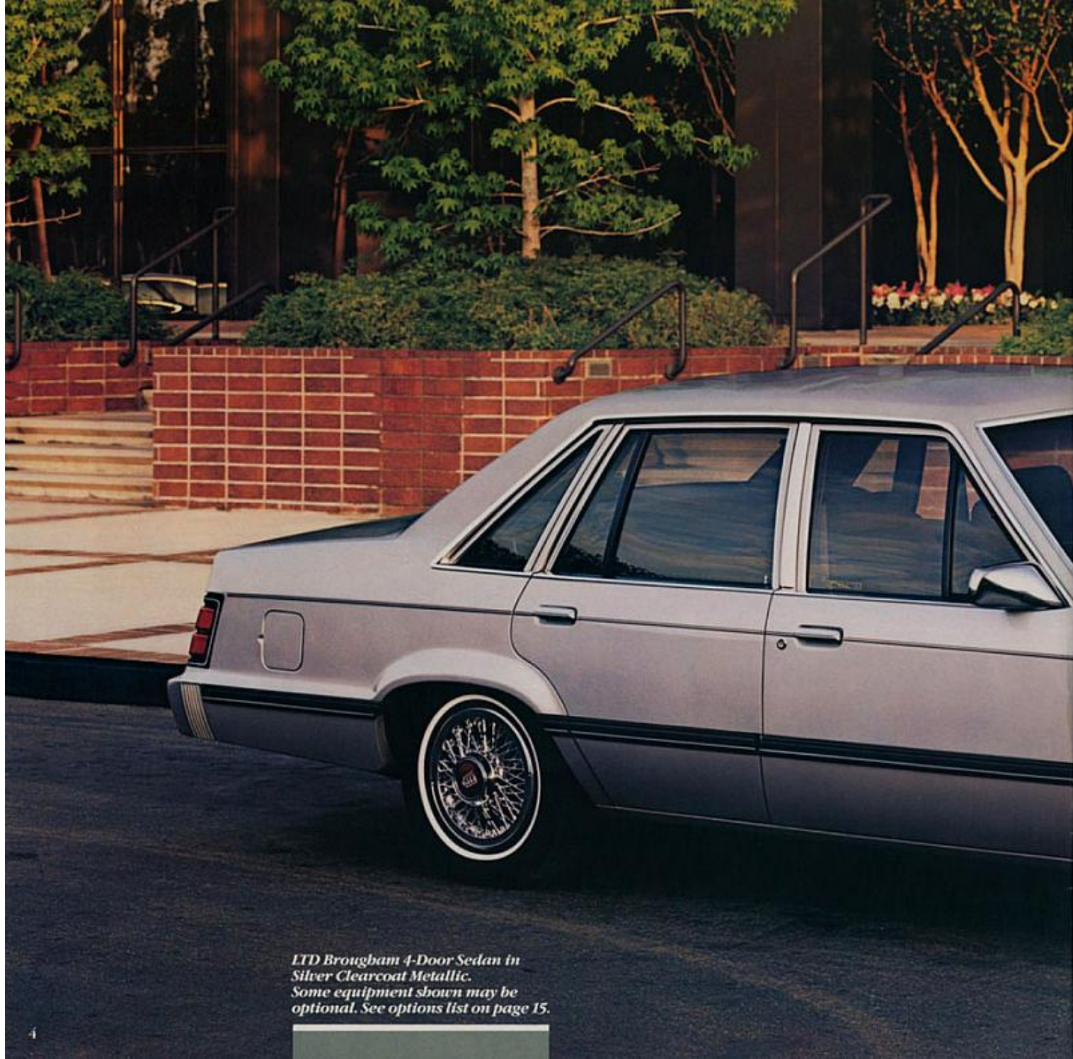
LTD Brougham 4-Door Sedan in Silver Clearcoat Metallic. Some equipment shown may be optional. See options list on page 15.