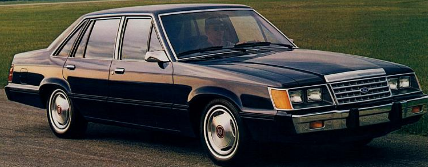
Left: LTD 4-Door Sedan in Midnight Blue Metallic. Some equipment shown may be optional. See options list on page 15.