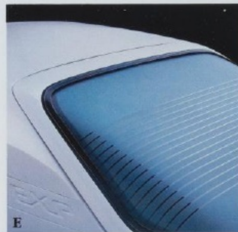
Illustrated options: (A) AM/FM stereo radio with cassette tape player. (B) Air conditioner. (C) Tot-Guard (available at Ford Dealers). (D) Flip-up open air roof. (E) Rear window defroster.