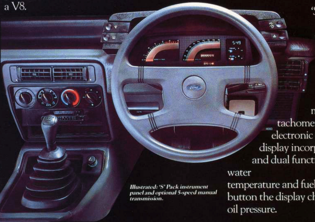
Illustrated: 'S' Pack instrument panel and optional 5-speed manual transmission.

Ford's electronic fuel injected engine gives you the power and torque reminiscent of a V8.