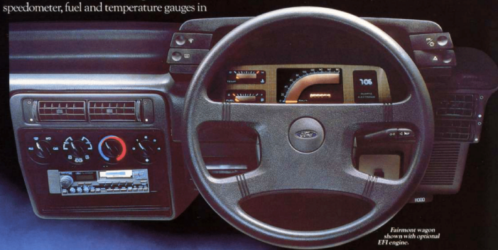
Fairmont wagon shown with optional EFI engine.

easy-to-read scales. A variable brightness digital clock featuring larger digits for clearer reading in daylight. More convenience is added in the binnacle which surrounds the instrument cluster where control switches are within a finger's stretch of the steering wheel.