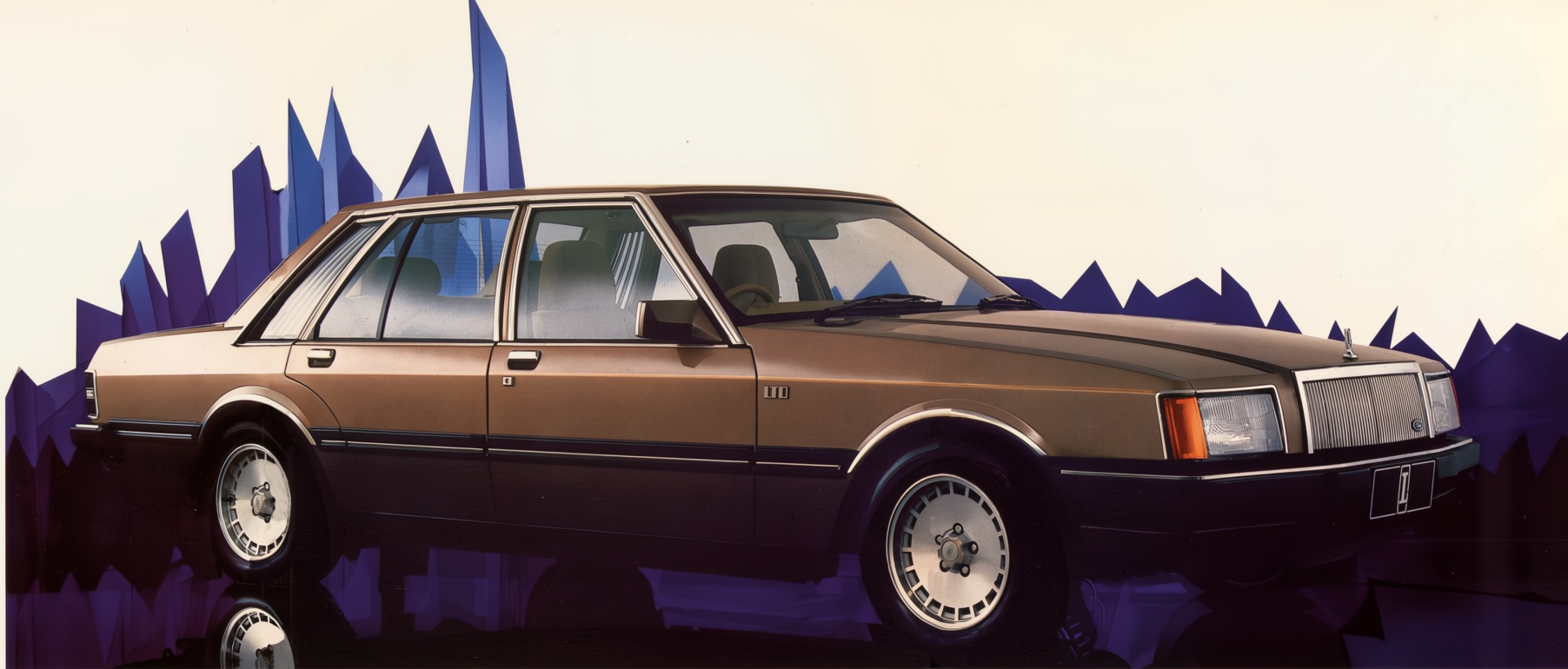
The 'Spectral map' used as a background to the illustration of the car indicates frequencies of sound inside the car.

A short drive in the new Ford LTD will suffice to prove to your ears and to you that in this modern world there are few places offering the peacefulness of the inside of an LTD.