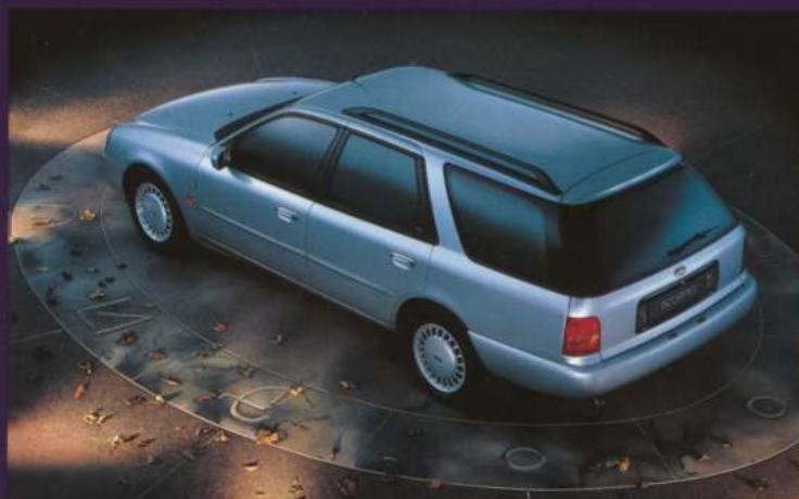
Ghia 2.5 TD Estate

† Available on models manufactured from Spring 1998