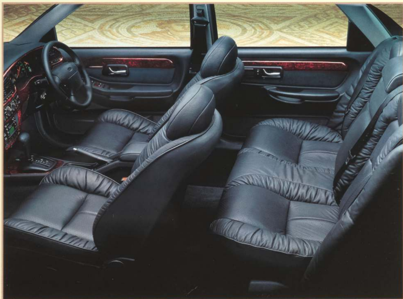
Ultima 2.9i 24V

SCORPIO. THE CAR THAT INSPIRES THINKING.