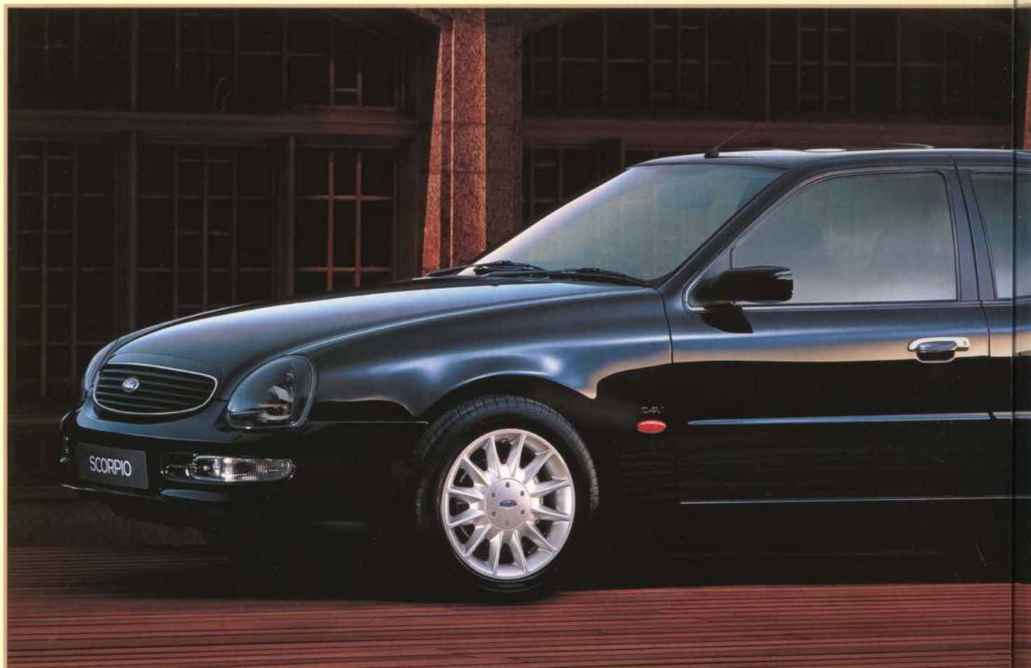
Ultima 2.9i 24V