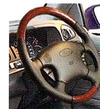
Woodrim steering wheel.

impressive array of standard luxury features, they create an atmosphere of true comfort and refinement.