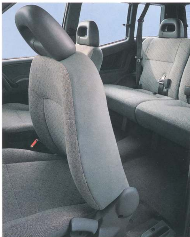
Above: The three-door model features tilting front seats with a quick release feature for ease-of-access.