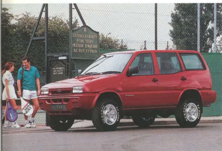
Below: The high command driving position provides the driver with excellent visibility.