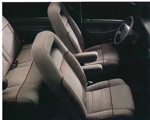
Above: Aerostar XLT interior in Medium Gray. Standard 7-passenger seating features dual front captain's chairs (with power lumbar adjustment and map pockets) and 2- and 3-passenger rear bench seats.