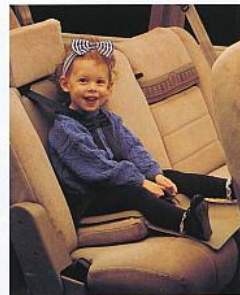
Aerostar offers optional integrated child safety seats.