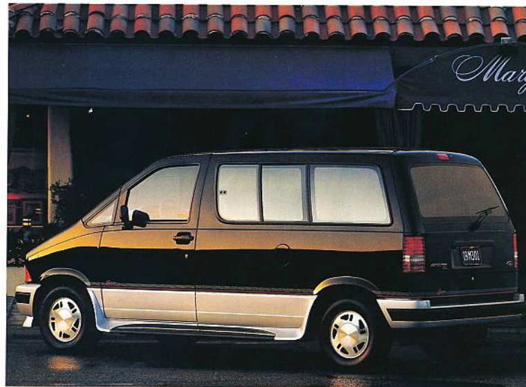
Above: Extended-length Aerostar XLT in Bimini Blue Clearcoat Metallic.

Left: Aerostar XL in Raven Black with the optional Sport Appearance Package, which includes silver metallic bumper/floor body-side paint and other features (see the back cover for complete package contents).