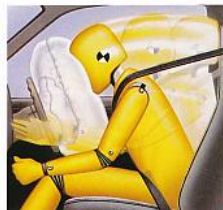
Some equipment shown on these pages may be optional.

With Aerostar, you have a wide range of choices. Seating for 5 or 7 passengers, regular- or extended-length models, 2-wheel drive or the extra traction of the optional electronic 4-wheel-drive system.