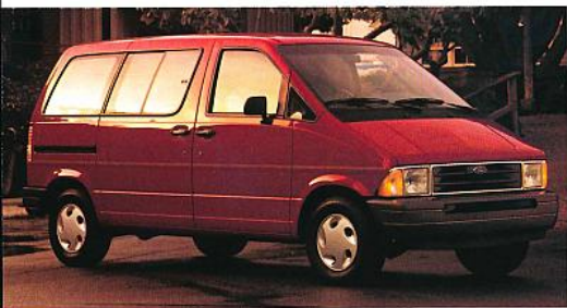
Above: Aerostar XL in Ruby Red Clearcoat Metallic.