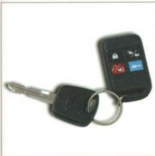
Remote Start System