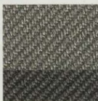
Medium/Dark Flint Cloth (XLS)