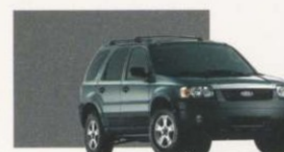
Dark Shadow Grey Clearcoat Metallic (All series)