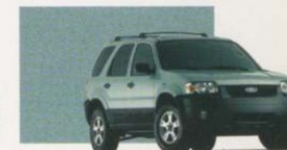
Titanium Green Clearcoat Metallic (XLS and XLT)