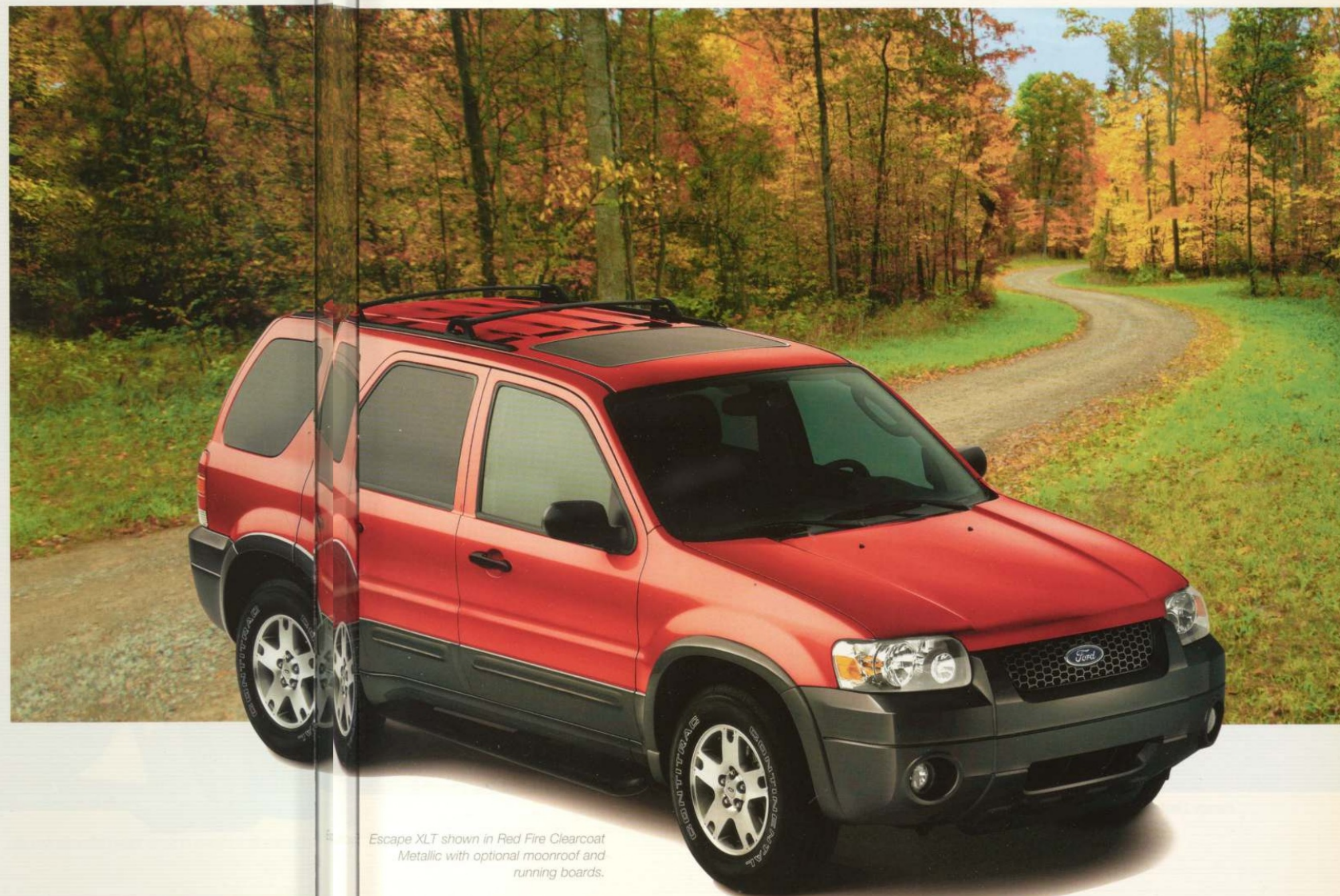
Escape XLT shown in Red Fire Clearcoat Metallic with optional moonroof and running boards.