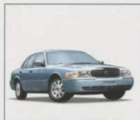
2004 Grand Marquis