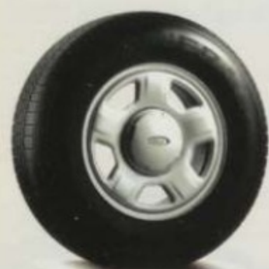
15" styled steel (XLS w/manual transmission)