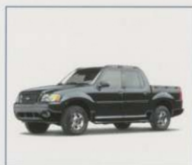
2004 Explorer Sport Trac