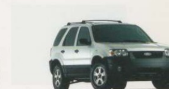
Oxford White Clearcoat (XLS and XLT)