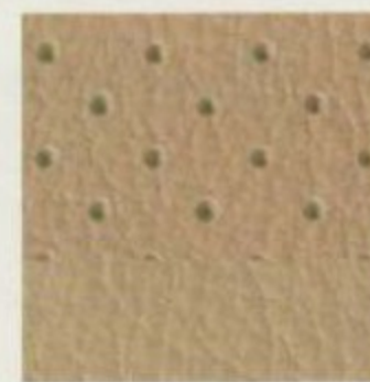
Medium/Dark Pebble Premium Leather (Limited)