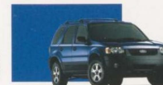
Sonic Blue Clearcoat Metallic (XLS and XLT)