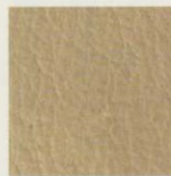
Medium/Dark Pebble Leather (Optional on XLT)