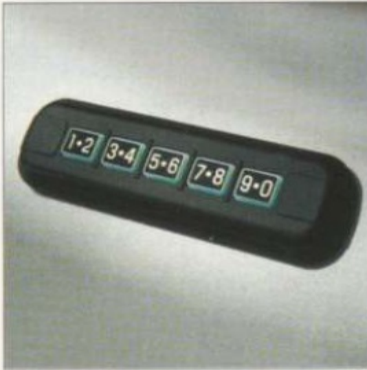
NEW Keyless Entry Pad