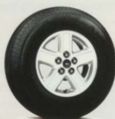
15" cast aluminum (XLS w/automatic transmission; optional on XLS w/manual transmission)