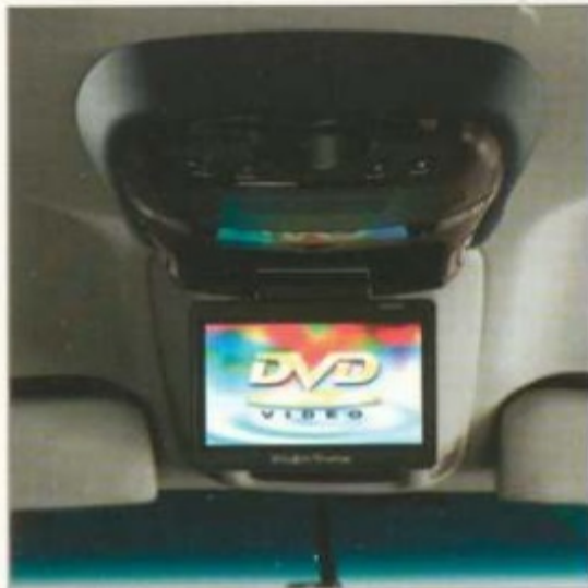
Rear Seat DVD Entertainment System