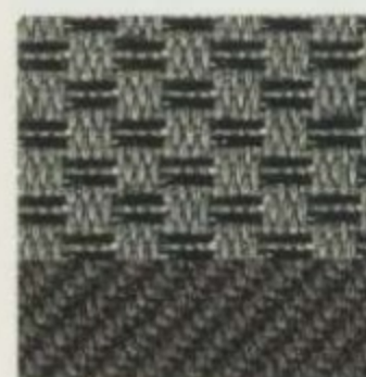
Medium/Dark Flint Premium Cloth (XLT)