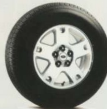
16" cast aluminum (XLT)