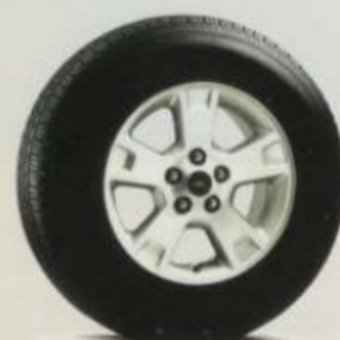
16" painted aluminum (XLT No Boundaries™ Package)