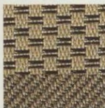
Medium/Dark Pebble Premium Cloth (XLT)