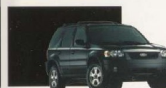
Black Clearcoat (All series)