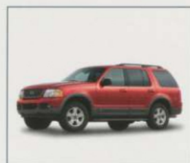
2004 Explorer 4-Door