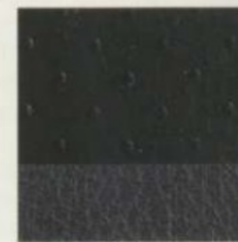
Ebony Black Premium Leather (Limited)