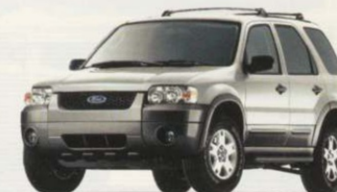
2005 Ford Escape

* Based on 2003 calendar-year retail sales in Canada.