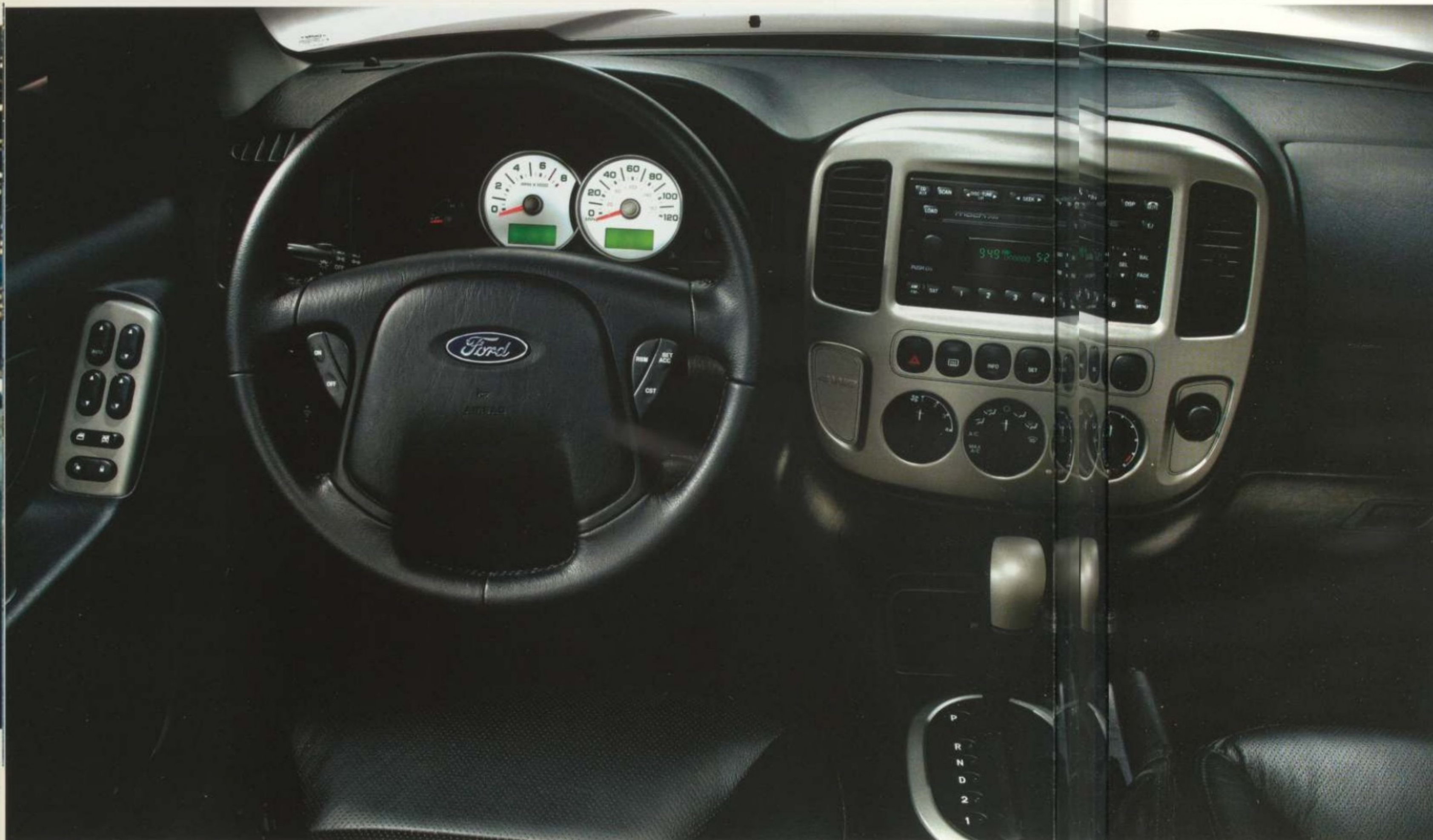
Escape Limited interior shown in Ebony Black Premium Leather. U.S. model shown.