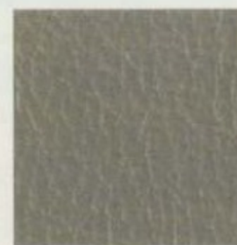
Medium/Dark Flint Leather (Optional on XLT)