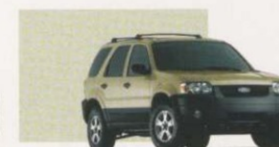
Gold Ash Clearcoat Metallic (All series)