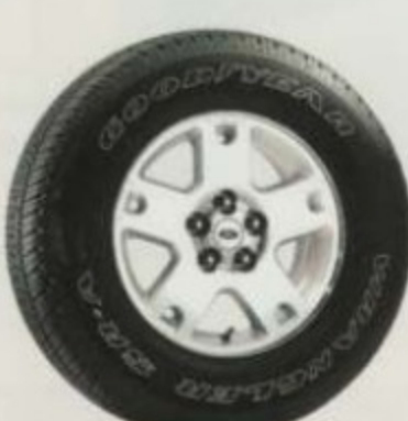
16" bright machined aluminum (Limited and XLT Sport Package)