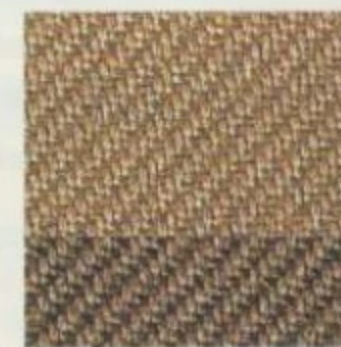
Medium/Dark Pebble Cloth (XLS)