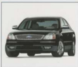
2005 Five Hundred