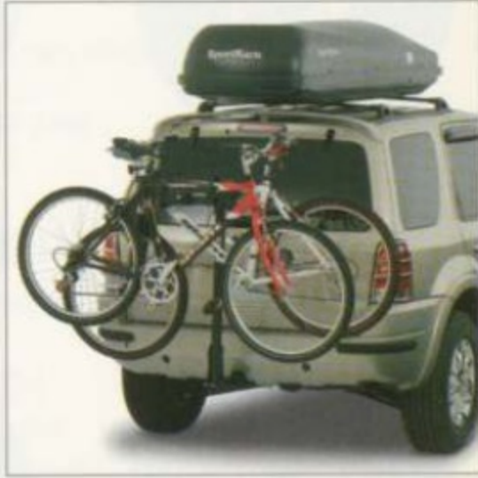
SportRack Cargo Box and QuarterRoc® Bike Carrier