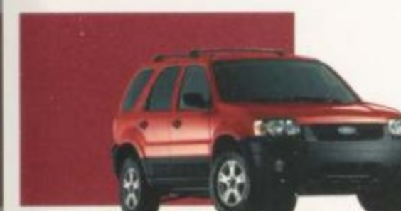
Red Fire Clearcoat Metallic (All series)