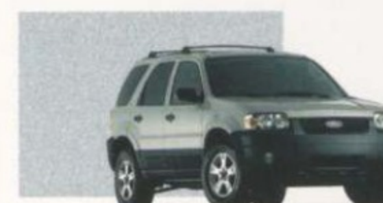
Silver Clearcoat Metallic (All series)