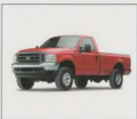
2004 F-Series Super Duty