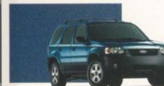
Norsea Blue Clearcoat Metallic (XLS and XLT) (Late availability)