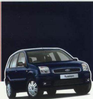
Dark True Blue Solid

Note: The car images used are to illustrate body colours only and may not reflect current specification. Colours and trims reproduced within this brochure may vary from the actual colours, due to the limitations of the printing processes used.