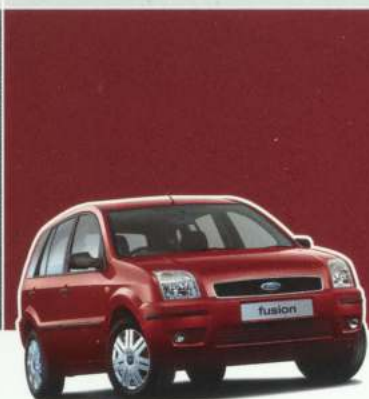
Pepper Red Metallic*