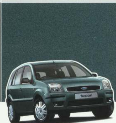
Neptune Green Metallic*