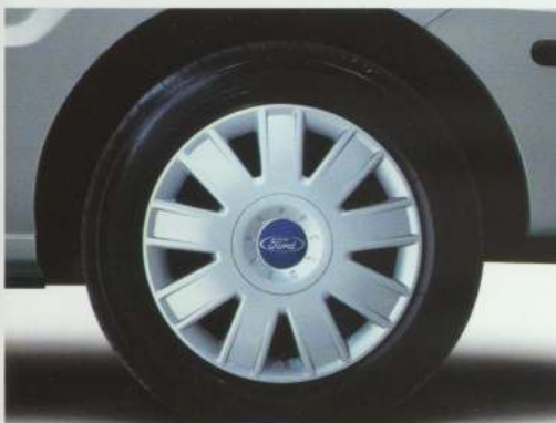
15" steel with wheelcover (Fusion 1)