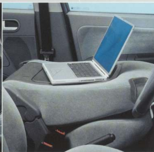
Fold-flat passenger seat The front passenger seat backrest folds forward to convert into a flat, practical table. Ingenious, isn't it? (Fusion 2 and Fusion 3 only.)