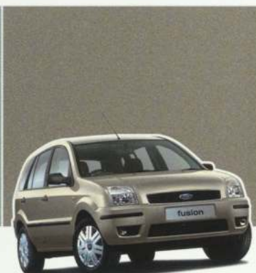
Oyster Silver Metallic*