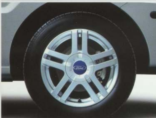
15" 5x2-spoke alloy (optional on Fusion 1/Fusion 2)