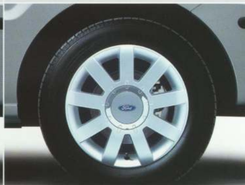
15" 9-spoke alloy (accessories range)