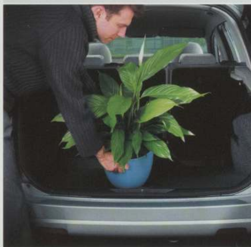
Low loading lip Access to the Ford Fusion's generous luggage space – up to 1175 litres with the rear seats folded down – is easy, thanks to its thoughtfully low loading lip. (An anti-slip mat is available from the Ford Fusion accessory range.)