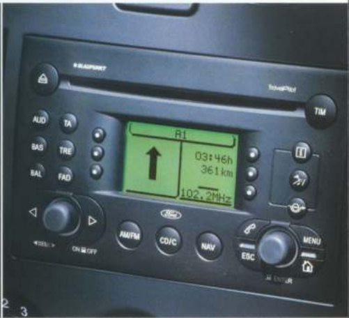
Satellite navigation Combining a radio, CD player and guidance system, the optional Travel Pilot navigation system will suggest the best route to your destination and guide you with a friendly voice and visual directions. Available on selected models as an option at extra cost.