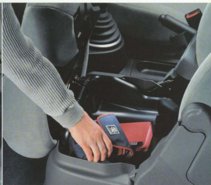
Under-seat storage Hidden beneath the front passenger seat you will find a handy storage tray, perfect for keeping items safely out of sight.