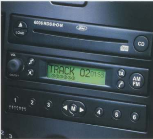
6006 stereo radio/CD With its 6-disc in-dash CD autochanger, the new premium 6006 stereo radio/CD promises hours of unbroken, crystal-clear sound performance. Available as an option at extra cost.