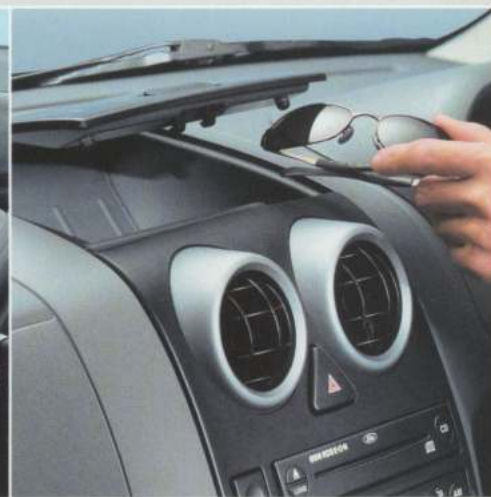
Storage compartment The convenient flip-top storage compartment is ideal for keeping items safely to hand while on the move.