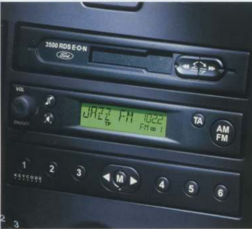
3500 stereo radio/cassette For superb audio reproduction and outstanding style, look no further than the Fusion's new-generation, fully integrated 3500 stereo radio/cassette.