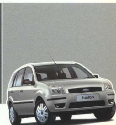
Moondust Silver Metallic*