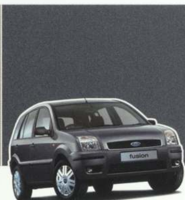
Magnum Grey Metallic*