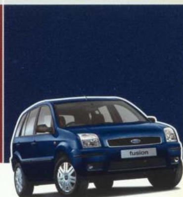
Ink Blue Metallic*