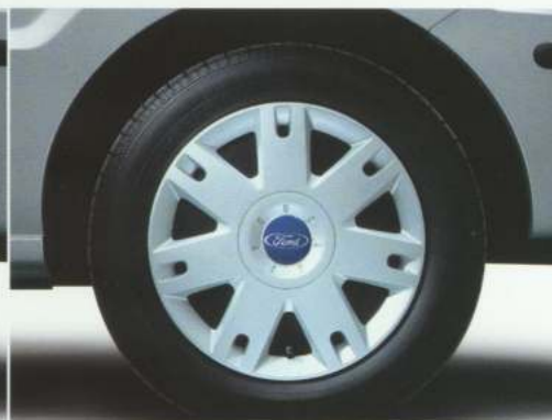
15" steel with wheelcover (Fusion 2)