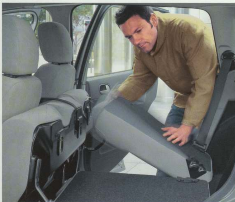
Ingenious versatility The Ford Fusion is all the transport you will ever need. Five comfortable adult-sized seats when you want them; four, three, two or even one seat when you don't, via its ingenious seat folding system. (Fold-flat front passenger seat available on Fusion 2 and Fusion 3 models.)

Whichever model you choose, you will find plenty of useful storage space. There are two front door pockets, each designed to hold a 33 cl can of drink, a large glovebox and a smart flip-top storage compartment on top of the instrument panel. Plus, a cleverly concealed storage tray beneath the flip-up front passenger's seat cushion for keeping items away from prying eyes.