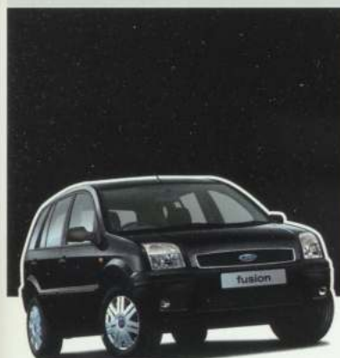
Panther Black Metallic*