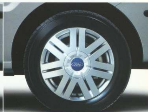
15" 7x2-spoke alloy (Fusion 3)