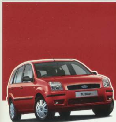
Colorado Red Solid