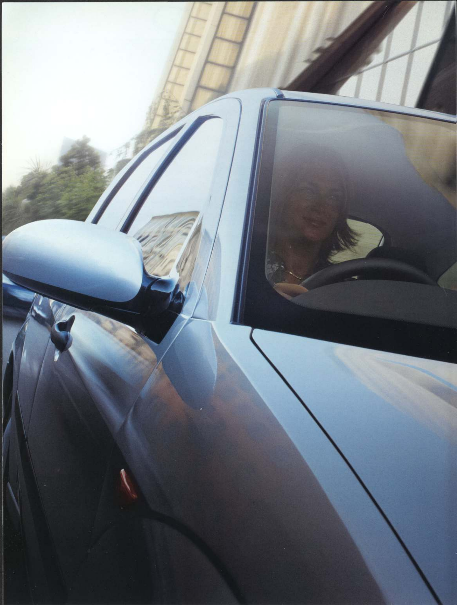
Model Focus Flight Colour Machine Silver