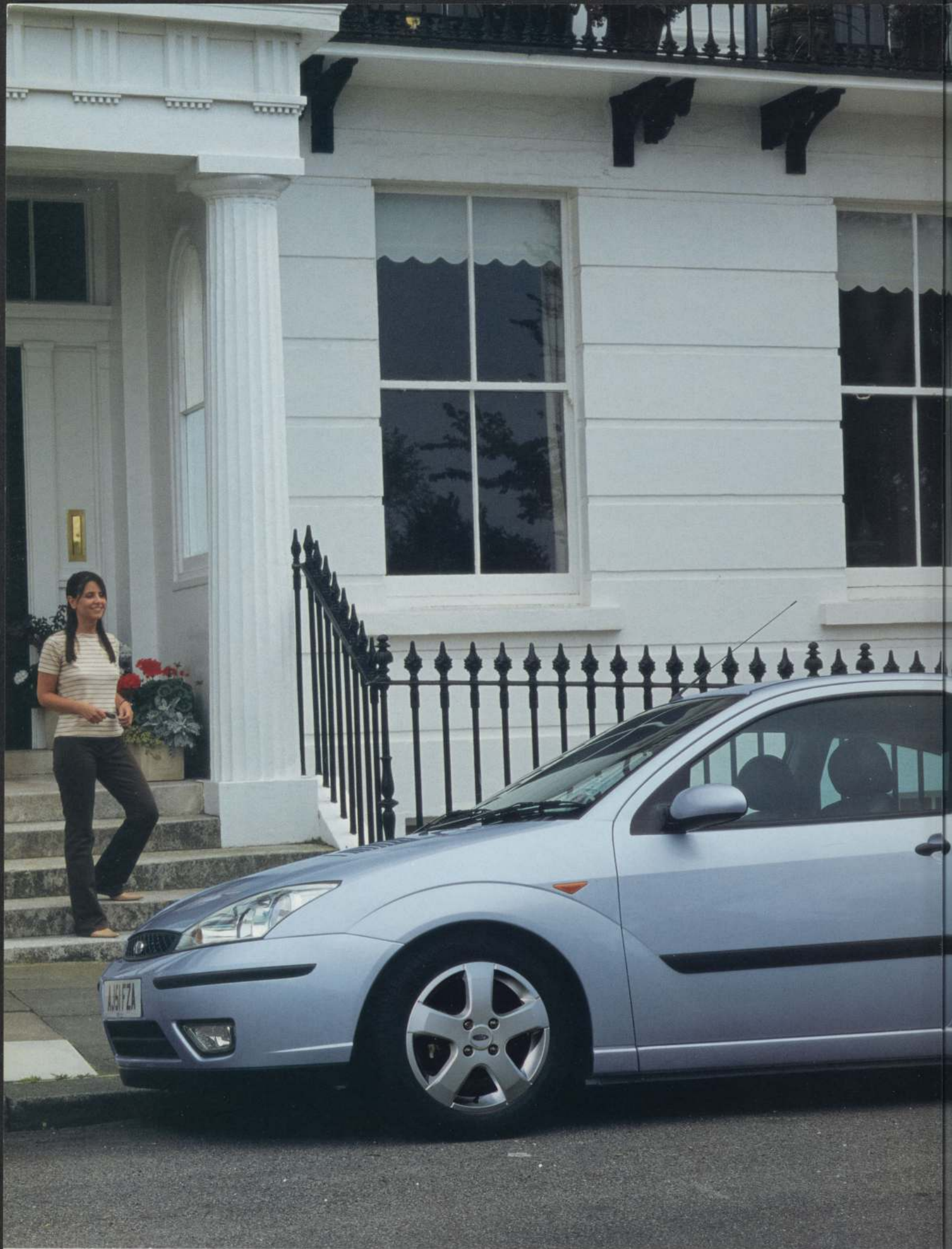
Model Focus Edge Colour Tonic