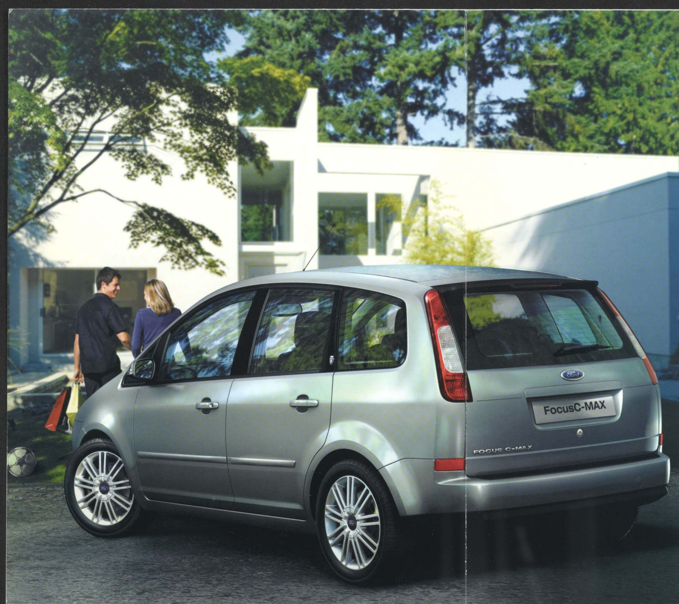
Model Ghia Colour Machine Silver Accessories 17" 9x2-spoke alloy wheels

With its smooth contours and sleek lines, Focus C-MAX feels elegantly modern*.