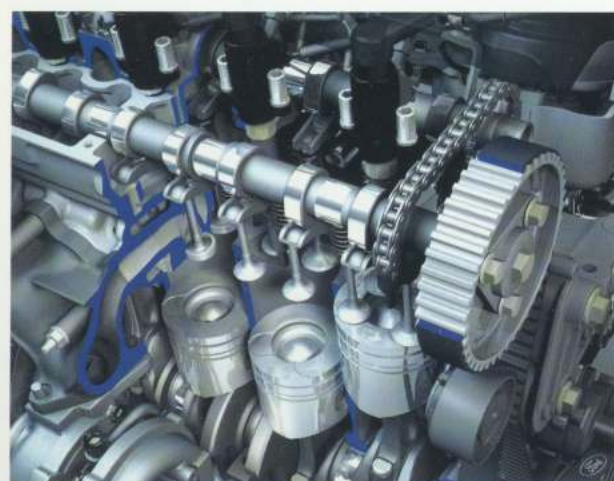
The choice of engines includes three smooth, responsive TDCi diesels*.

*All vehicle images in this brochure are of a pre-production model and are computer generated, therefore, the design/features on the final version of the vehicle may differ in various respects. In addition, some of the features shown on the vehicle may be optional.