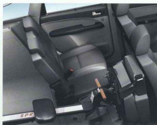
Focus C-MAX provides easy and versatile passenger and load carrying capability*.

*All vehicle images in this brochure are of a pre-production model and are computer generated, therefore, the design/features on the final version of the vehicle may differ in various respects. In addition, some of the features shown on the vehicle may be optional.