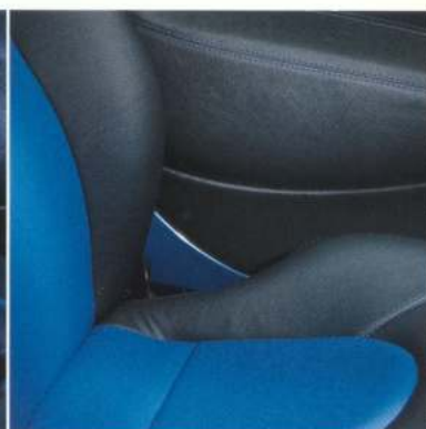
Perforated leather in Racing Blue**