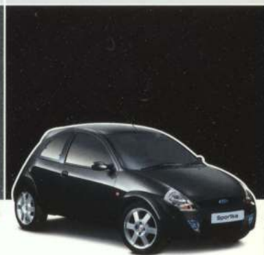
Panther Black* Metallic body colour