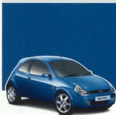
Blue Print Solid body colour