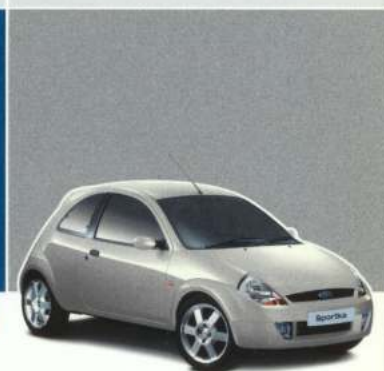
Moondust Silver* Metallic body colour