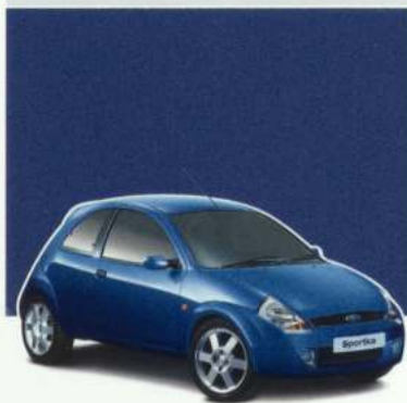
Imperial Blue* Metallic body colour