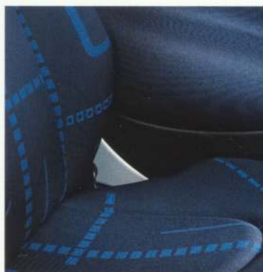
Streetline in Generic Blue