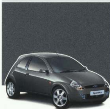
Magnum Grey* Metallic body colour