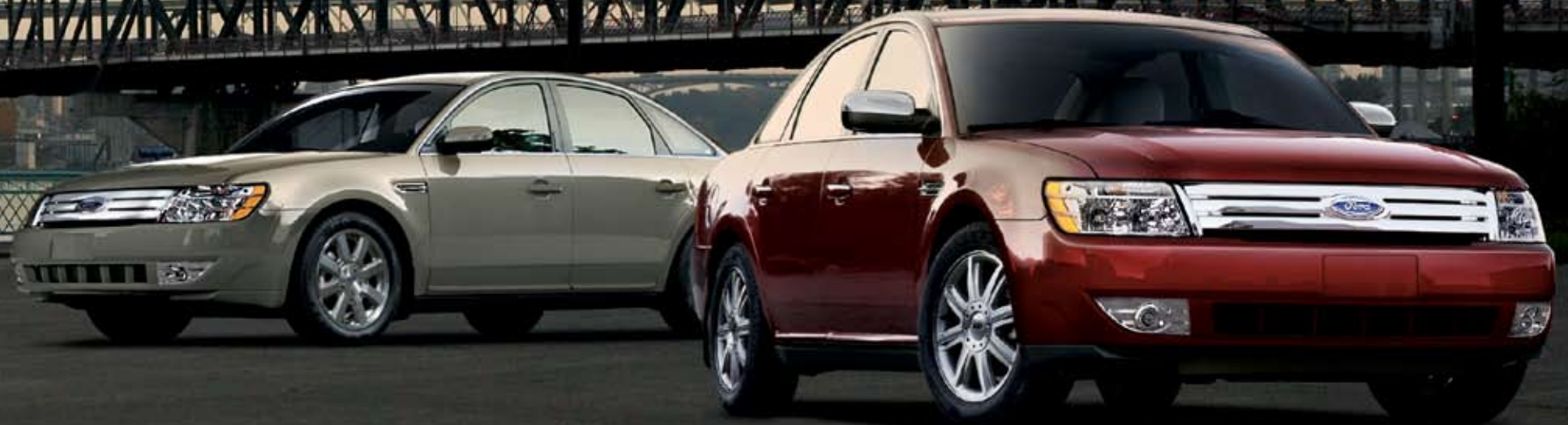
Taurus SEL in Light Sage Metallic. Taurus Limited in Merlot Metallic.

Chrome-Capped, Power, Heated Sideview Mirrors with Memory • Security Approach Lamps • Chrome-Trimmed Door Handles • Reverse Sensing System • Memory for Driver Seat • Power-Adjustable Pedals with Memory • Satin-Cream Gauges • Curly Koa Woodgrain-Appearance Appliqués on Instrument Panel and Console • Analog Clock in Instrument Panel • Universal Garage Door Opener • Audiophile® Sound System with AM/FM Stereo, Subwoofer and 6-Disc In-Dash CD Changer with MP3 Capability • 4-Way Power Front-Passenger Fold-Flat Seat with Manual Lumbar • Leather-Trimmed Seats • 8-Way Power Driver Seat with Memory • Heated Driver and Front-Passenger Seats • Adjustable Rear-Seat Head Restraints • Rear-Seat Centre Armrest with Beverage Holders and Storage • 18" 8-Spoke Bright-Aluminum Wheels • P225/55R18 Tires