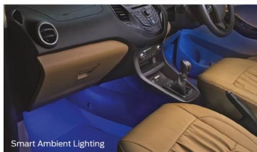
Smart Ambient Lighting