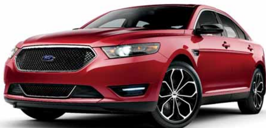
Ruby Red Metallic Tinted Clearcoat. Available equipment.

Visit accessories.ford.com to shop the complete collection