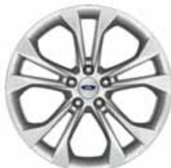
19" Sparkle Silver-Painted Aluminum Available on SEL