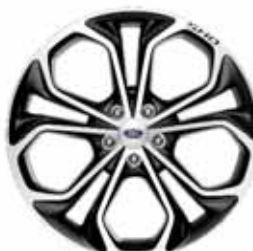
20" Machined and Painted Aluminum Available