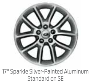
17" Sparkle Silver-Painted Aluminum Standard on SE