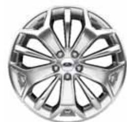
19" Premium Luster Nickel-Painted Aluminum Standard