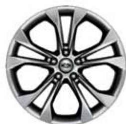
19" Premium Luster Nickel-Painted Aluminum Standard