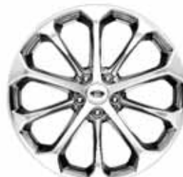
20" Polished Aluminum Available