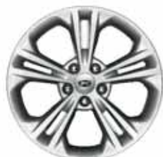
18" Sparkle Silver-Painted Aluminum Standard on SEL