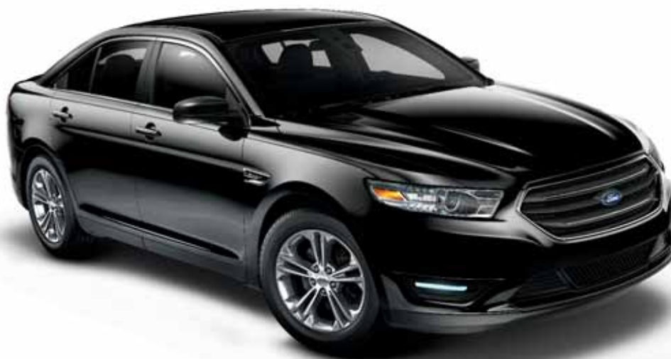
SEL. Tuxedo Black Metallic.

Visit accessories.ford.com to shop the complete collection