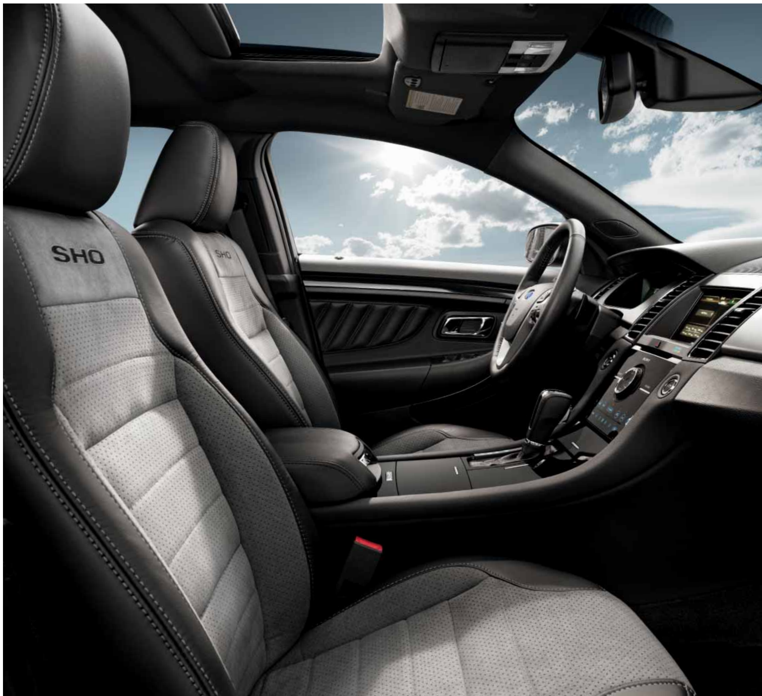
Charcoal Black leather trim with Mayan Gray Miko® Suede perforated inserts. Available equipment. ■ Charcoal Black leather trim with perforated inserts. ■ "SHO" engine cover. ■ EcoBoost® direct fuel injector. ■ Rear spoiler.