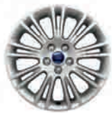
17" Alloy Wheel Design