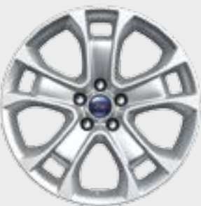
18" x 7.5" alloy wheel

Seat insert: Prada in Charcoal Black Seat bolster: Torino Leather in Charcoal Black Instrument panel: Charcoal Black