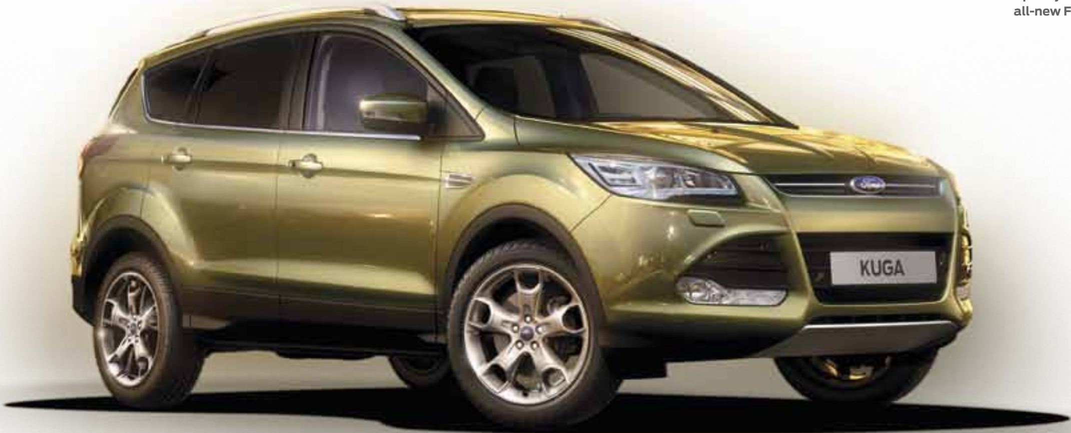
Ford Kuga Titanium shown.