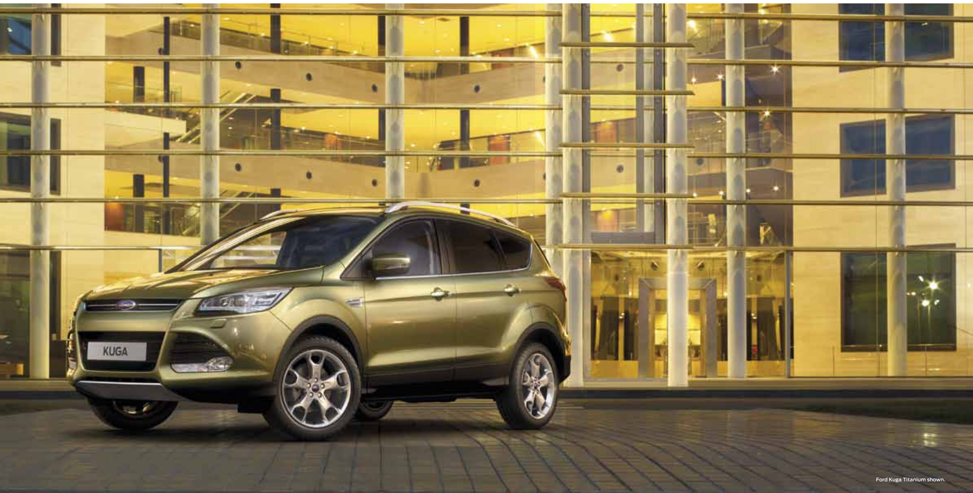
Ford Kuga Titanium shown.

Inspiring a sense of freedom and adventure, the all-new Ford Kuga is powerful yet fuel efficient for the most rewarding drive. With a range of helpful technologies it keeps you connected and in control, taking any change in the road, or your plans, effortlessly in its stride.