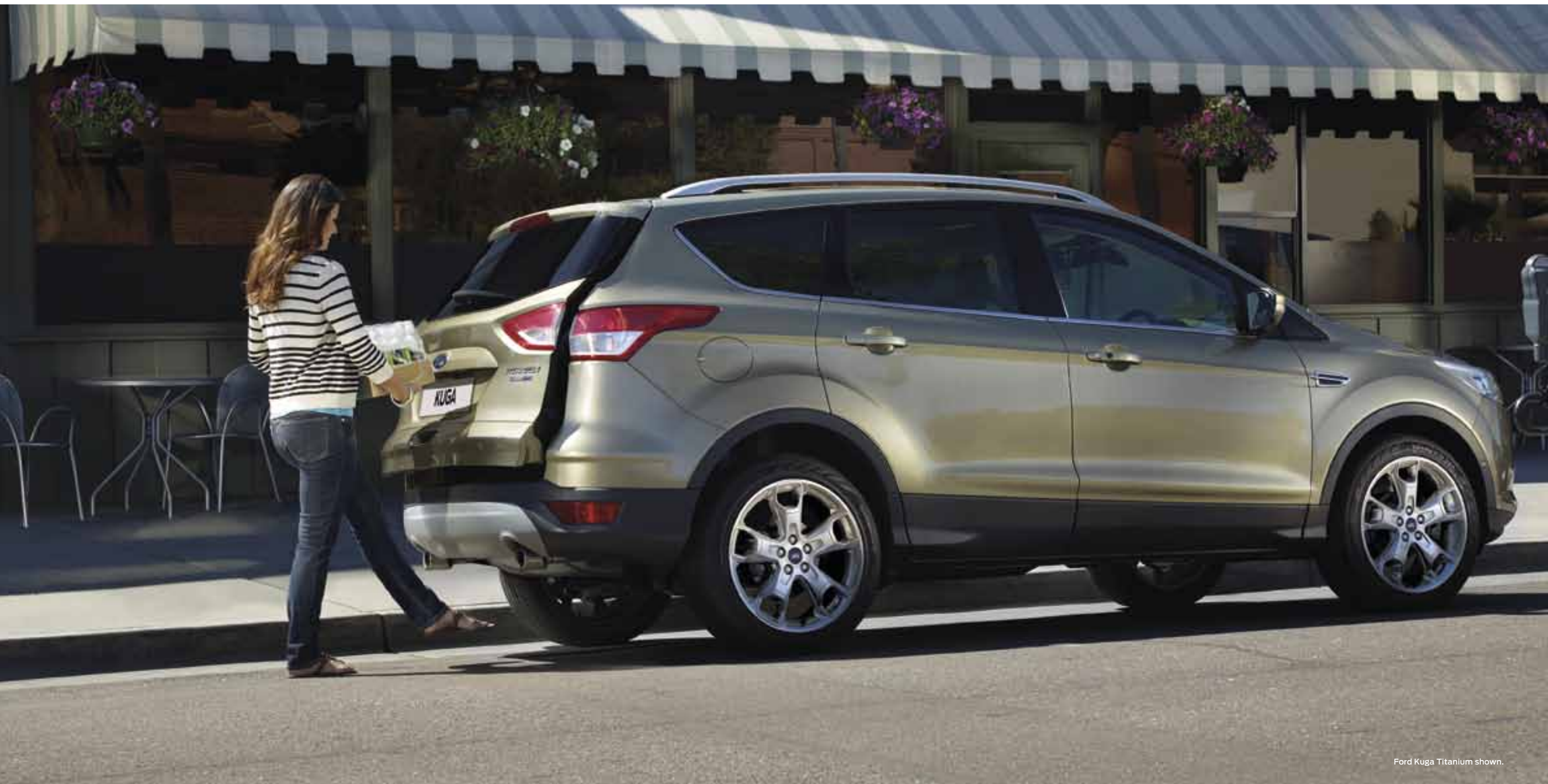
Ford Kuga Titanium shown.

The technology in the all-new Ford Kuga isn't solely about a better driving experience. It's also about making every day more effortless and enjoyable.