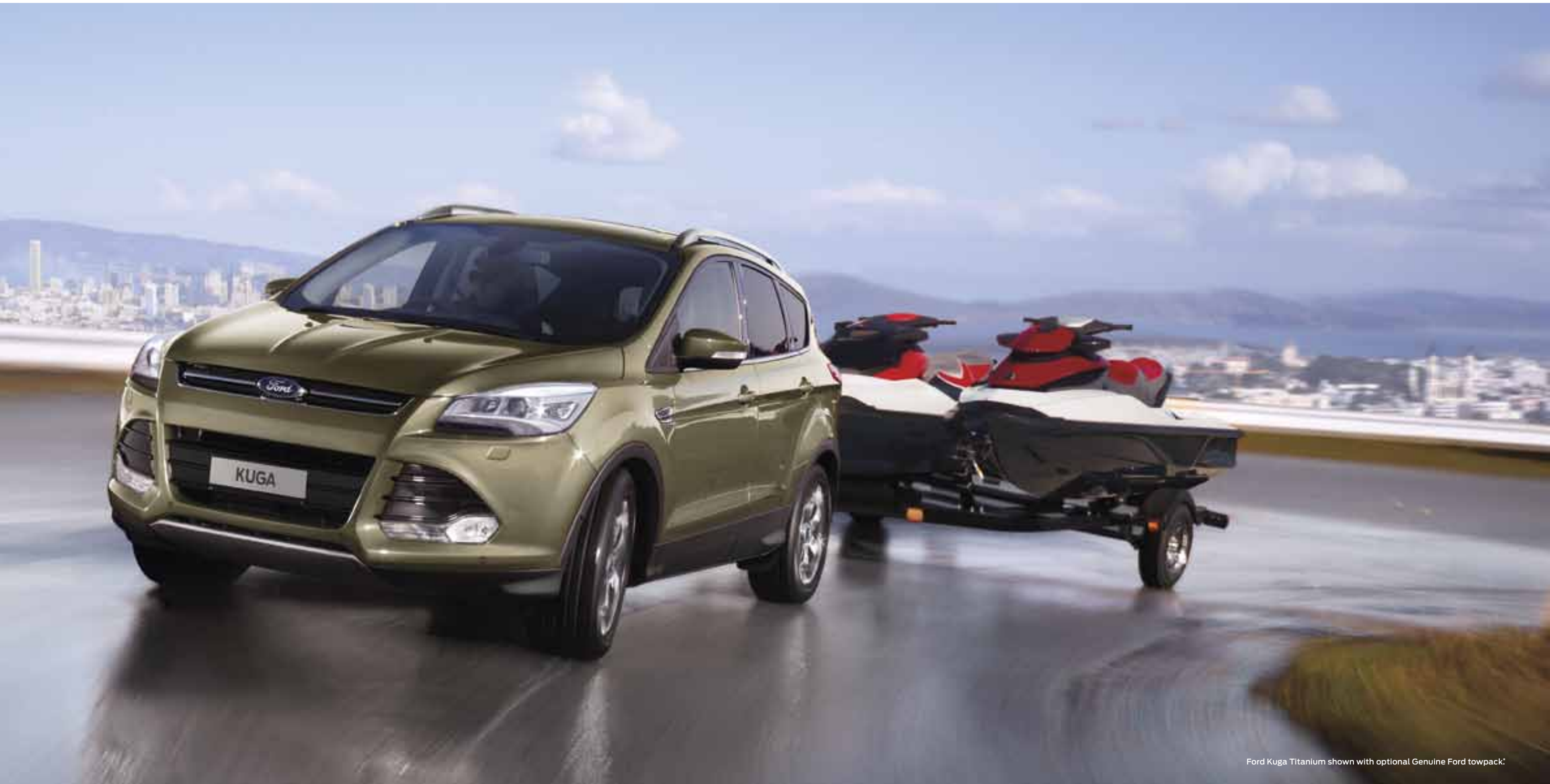
Ford Kuga Titanium shown with optional Genuine Ford towpack.*

Life can present unexpected surprises at any time. That's why the all-new Ford Kuga is designed for maximum flexibility. It effortlessly adapts to how you drive, what you're carrying, and whatever road conditions you'll encounter on the way.