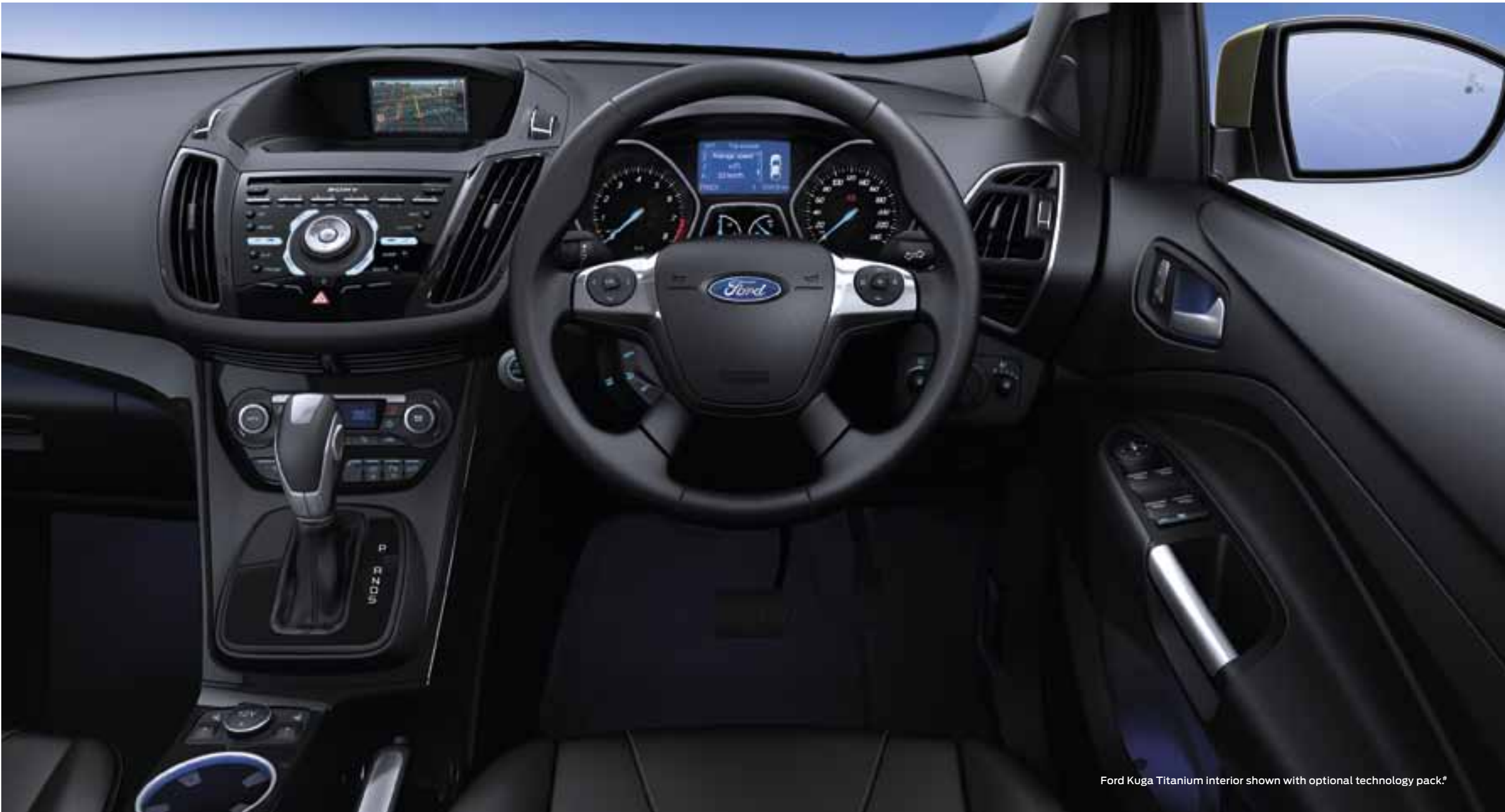
Ford Kuga Titanium interior shown with optional technology pack.#

Wherever your travels take you, the all-new Ford Kuga delivers a smart and effortless adventure with exciting technology you never want to be without.