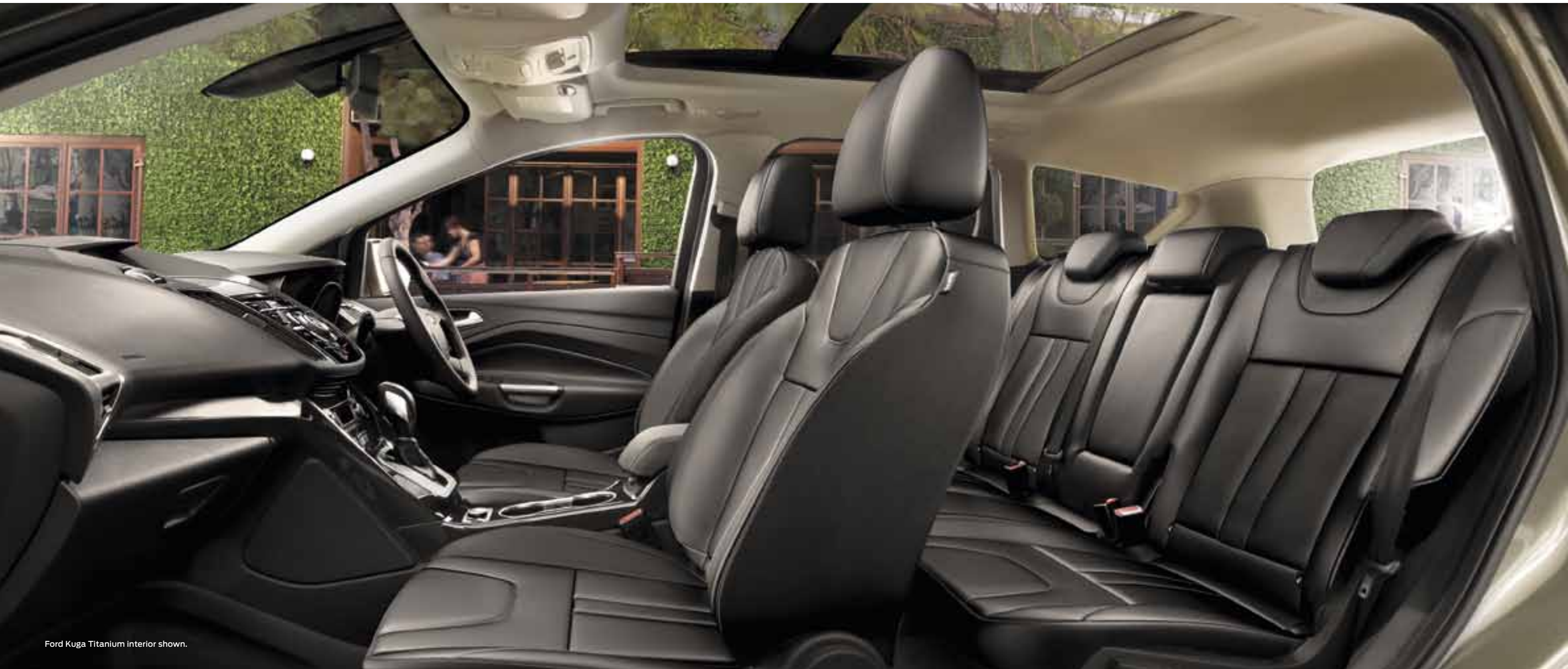
Ford Kuga Titanium interior shown.

You know the saying ‘a place for everything, and everything in its place?’ That’s the philosophy behind the all-new Ford Kuga’s cabin design, with plenty of clever storage to make under-seat clutter a thing of the past.