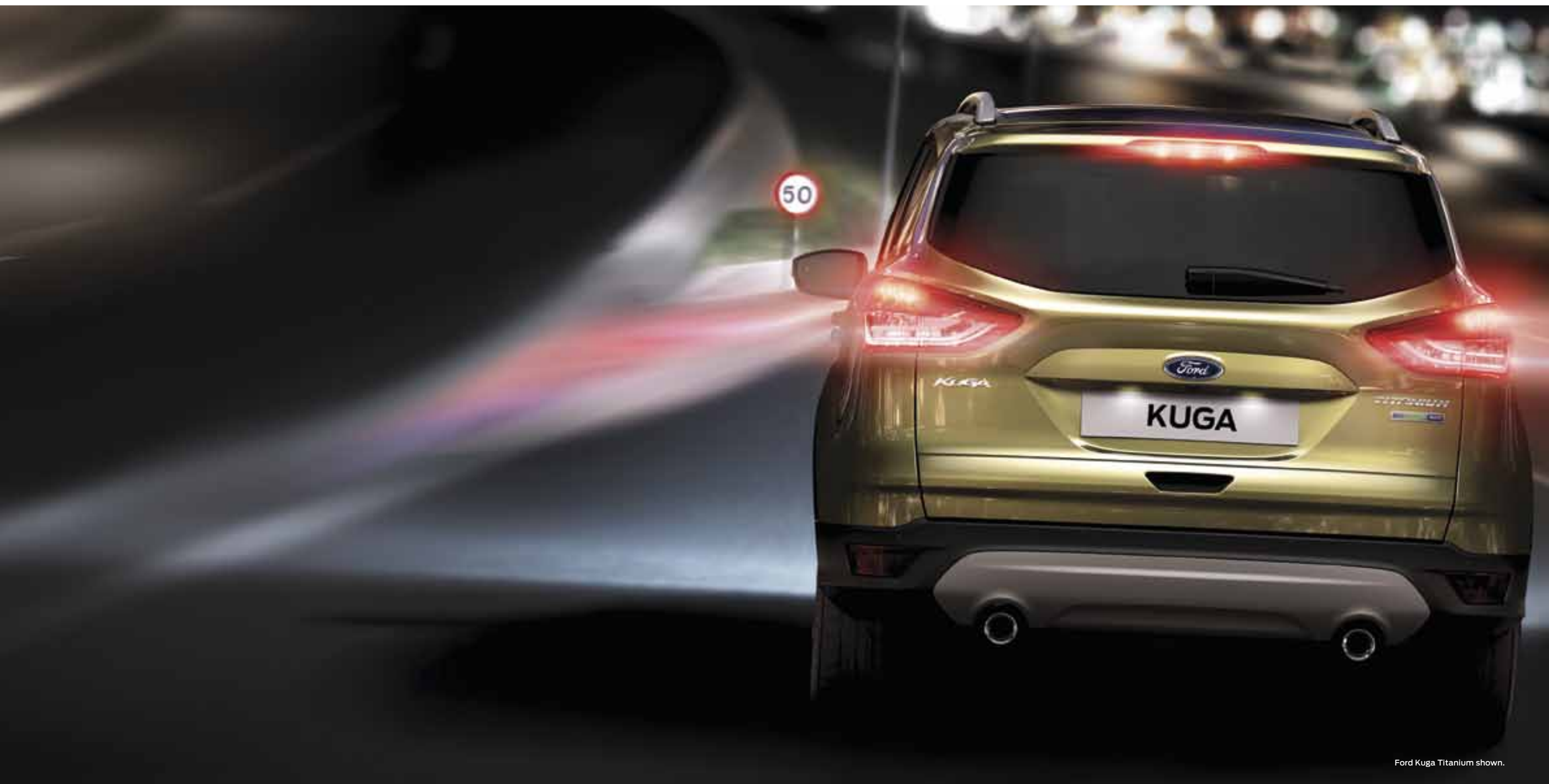
Ford Kuga Titanium shown.

The all-new Ford Kuga incorporates some of the most advanced safety features available. Not only to help protect you, but to help prevent the need for protection in the first place.