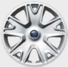
17" x 7.5" steel wheel

Seat insert: Prada in Charcoal Black Seat bolster: Lux in Charcoal Black Instrument panel: Charcoal Black