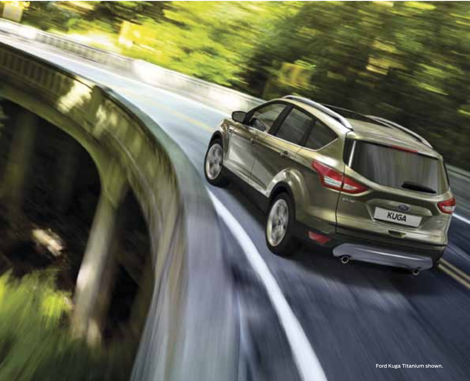
Ford Kuga Titanium shown.

The all-new Ford Kuga's highly advanced technology provides you with the very best levels of protection. And it helps make your life simpler and stress-free too.