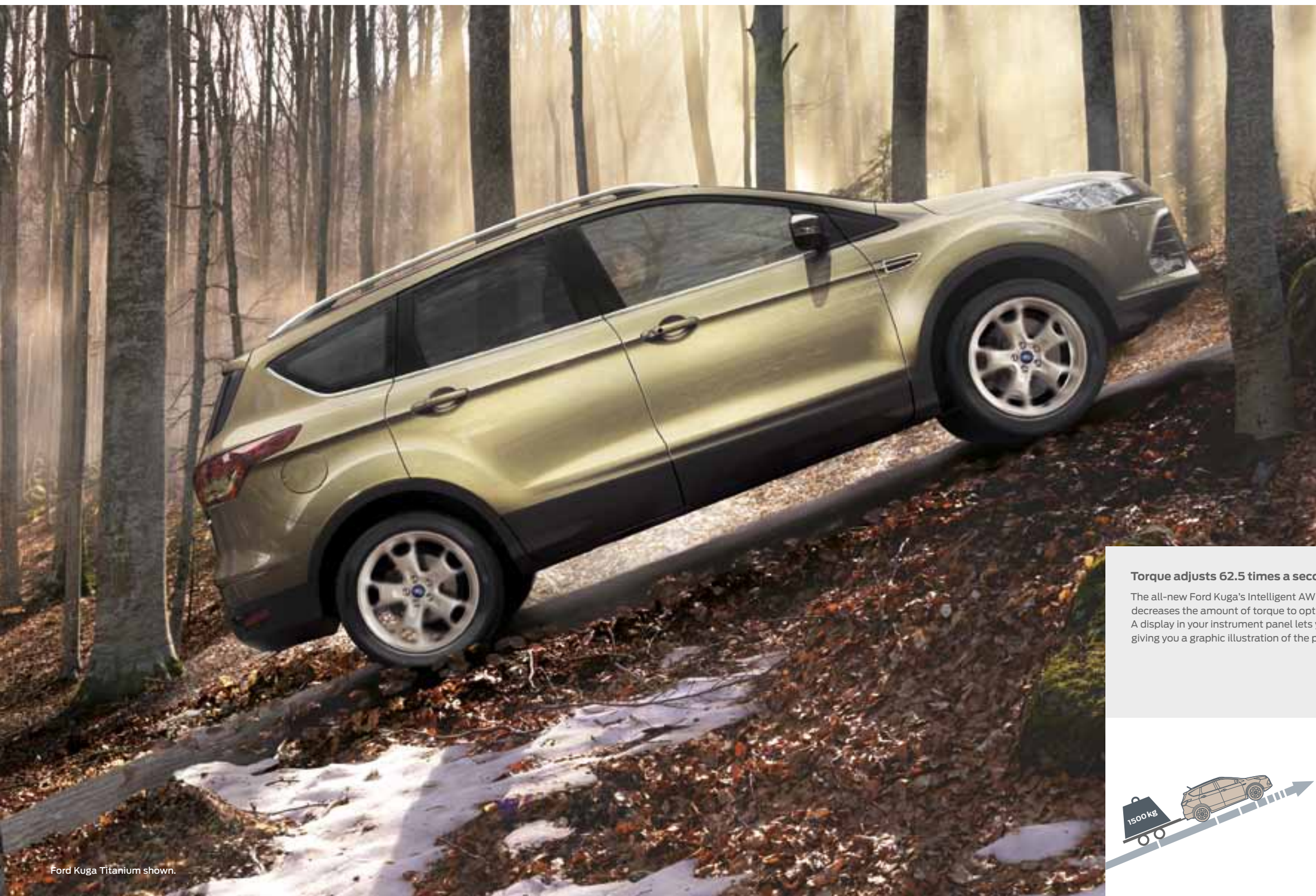
Ford Kuga Titanium shown.

Make the most of the terrain around you. The all-new Ford Kuga's intelligent All-Wheel-Drive and streamlined power and efficiency helps you tackle whatever your day serves up to you, with confidence.