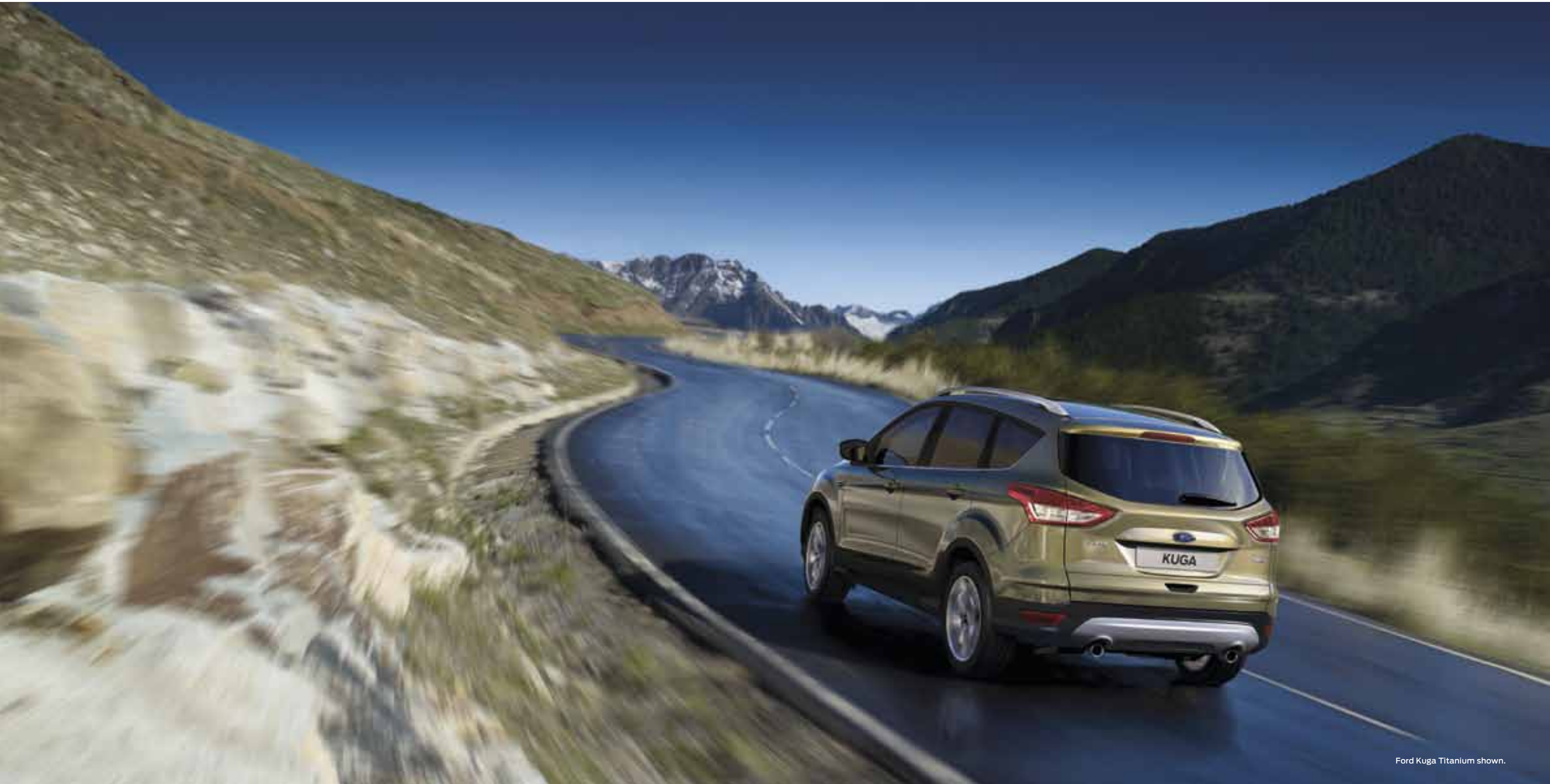
Ford Kuga Titanium shown.

The all-new Ford Kuga offers petrol and diesel engine options with smart fuel-saving technologies, delivering impressive fuel-efficiency without compromising power.