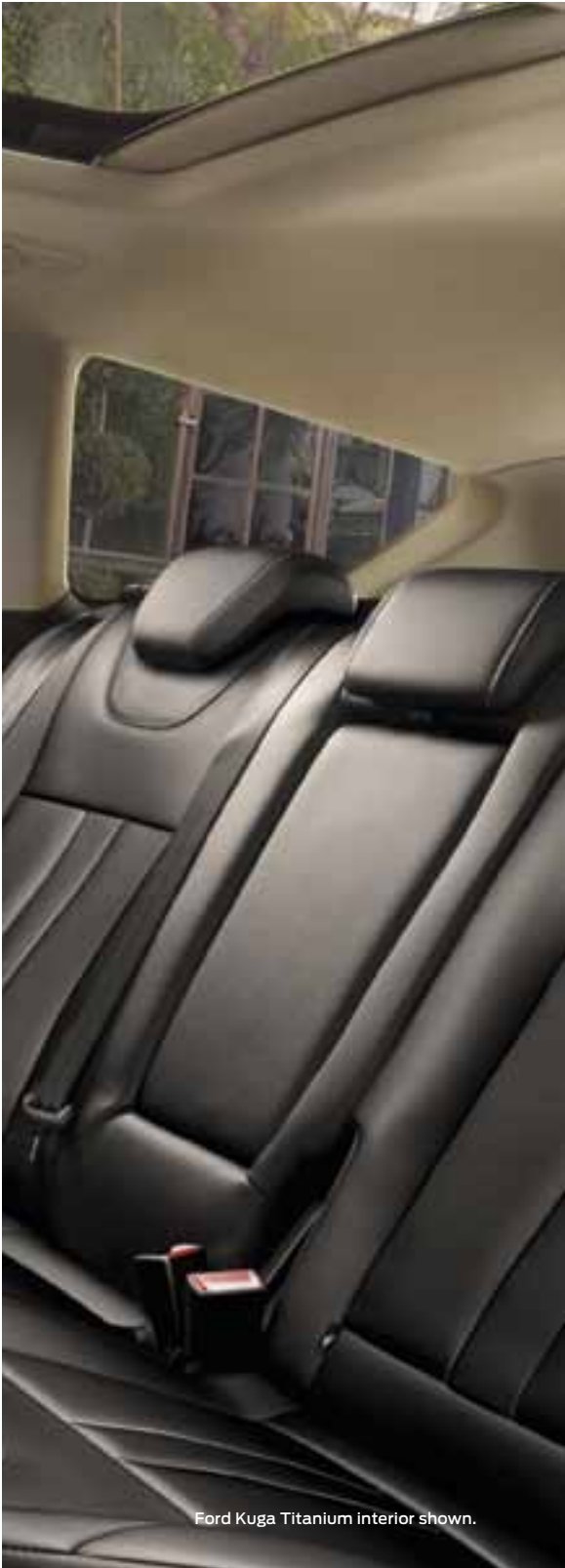
Ford Kuga Titanium interior shown.