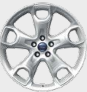
19" x 8" alloy wheel

Seat insert: Torino Leather in Charcoal Black Seat bolster: Torino Leather in Charcoal Black Instrument panel: Charcoal Black