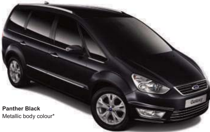
Panther Black Metallic body colour*