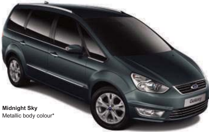
Midnight Sky Metallic body colour*