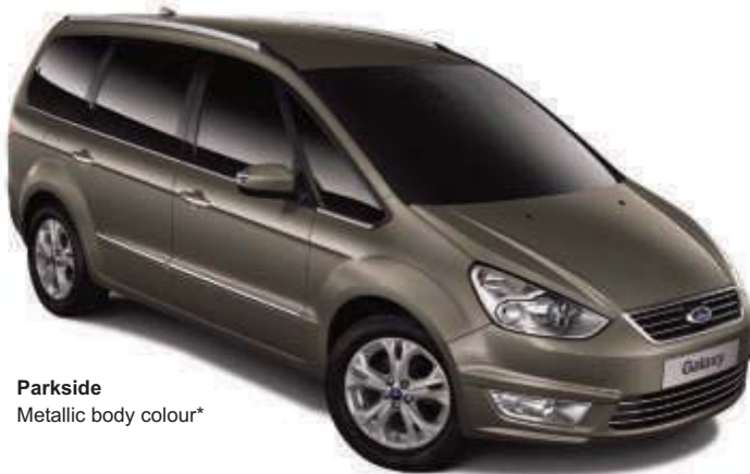
Parkside Metallic body colour*