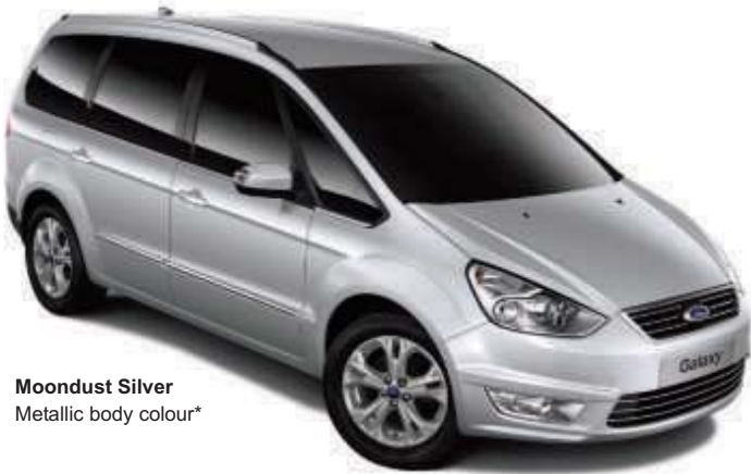
Moondust Silver Metallic body colour*