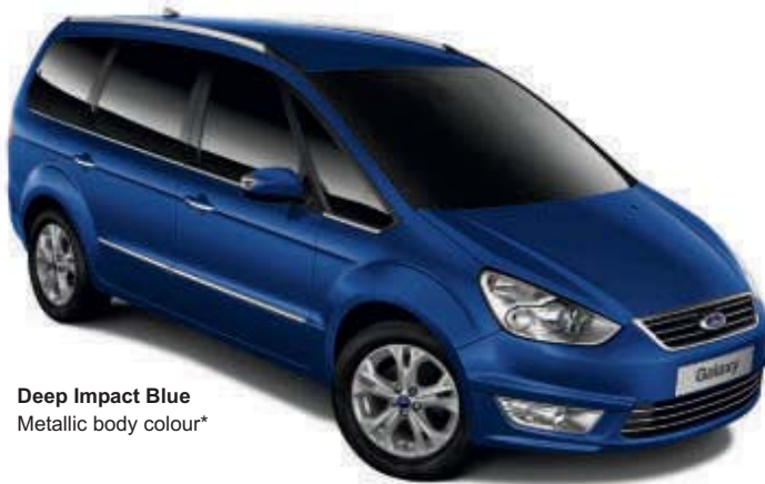
Deep Impact Blue Metallic body colour*