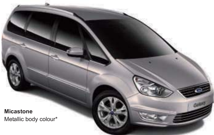
Micastone Metallic body colour*