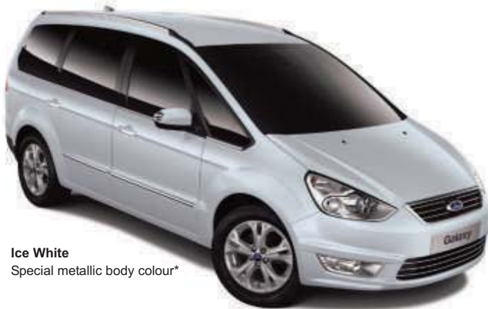
Ice White Special metallic body colour*