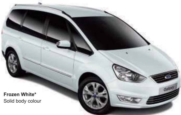
Frozen White* Solid body colour