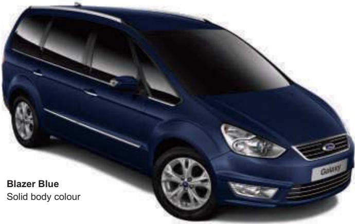
Blazer Blue Solid body colour