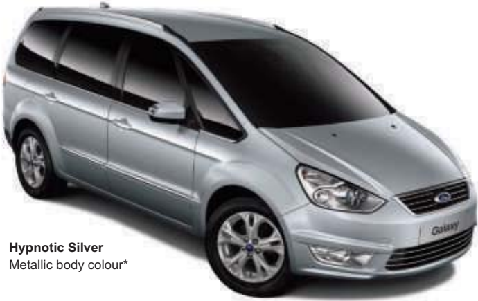
Hypnotic Silver Metallic body colour*