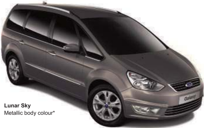
Lunar Sky Metallic body colour*