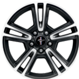
17" Black Foundry-Painted Machined Aluminum Standard