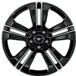
19" Black-Painted Machined Aluminum Included: California Special Edition