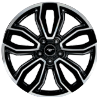
19" Machined Aluminum with Black-Painted Windows Optional