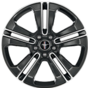
19" Foundry Black-Painted Machined Aluminum Included: Performance Package