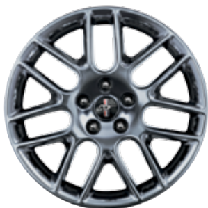
18" Sterling Grey Metallic-Painted Aluminum Included: Mustang Club of America Special Edition