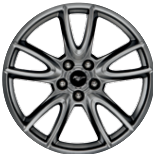
19" Dark Stainless-Painted Aluminum Included: Brembo™ Brake Racing Package and GT Brake Performance Package