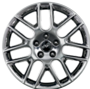
18" Polished Aluminum Optional