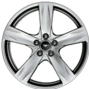
19" Premium Luster Nickel- Painted Aluminum Optional