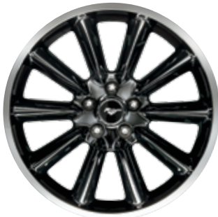
19" x 9" Front/19" x 9.5" Rear Black-Painted Aluminum Standard