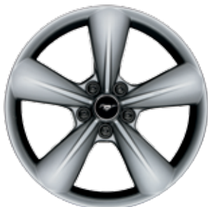
18" Wide-Spoke Painted Aluminum Standard