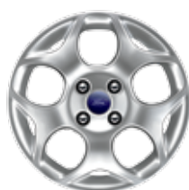
16" Premium Luster Nickel-Painted Aluminum Standard