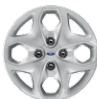
15" Steel with Covers Standard