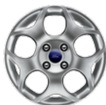
16" Polished Alloy Included with Premium Sport Appearance Package