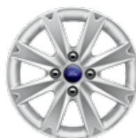
15" Painted Aluminum Included with Sport Appearance Package