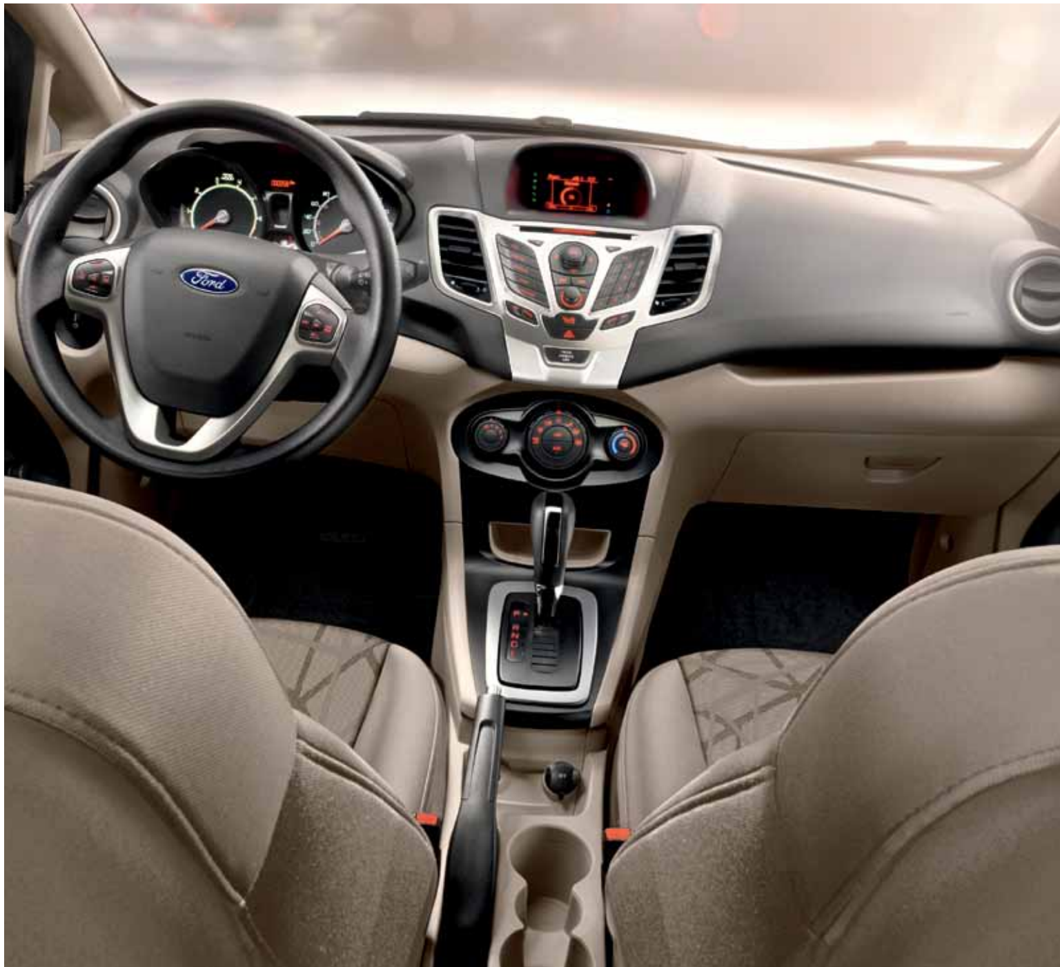
Unique Light Stone cloth trim with Light Stone inserts and available equipment. ■ 5-speed manual transmission shift knob. ■ Easy Fuel® capless fuel filler. ■ Hatchback cargo volume of 435 litres (15.4 cu. ft.).