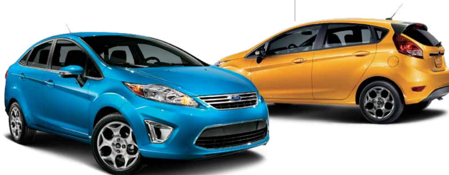
Sedan. Blue Candy Metallic Tinted Clearcoat. Hatchback. Yellow Blaze Metallic Tri-coat. Premium Sport Appearance Package.

Visit your Ford of Canada Dealer to shop the complete collection