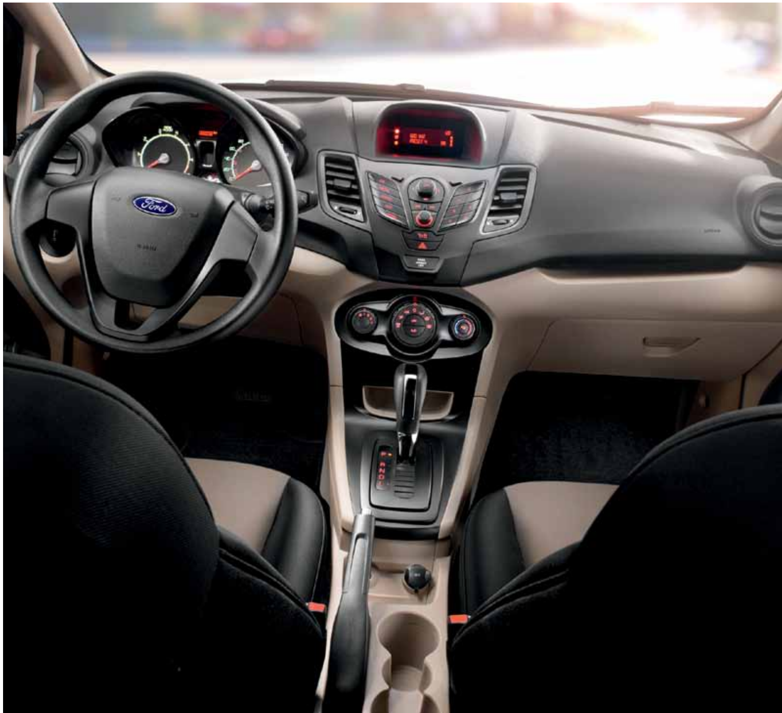
Charcoal Black cloth with Light Stone inserts and available equipment. || Sedan luggage capacity of 363 litres (12.8 cu. ft.). || Door map pocket with cupholder. || Power door locks switch.