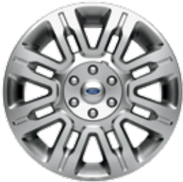
20" Polished Aluminum Standard

1 Stone Leather with Perforated Inserts – Standard 2 Charcoal Black Leather with Perforated Inserts – Standard