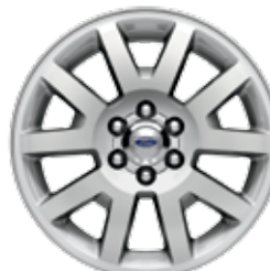
20" Premium Painted Aluminum Optional with XLT Premium Package