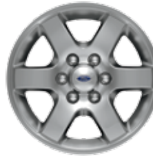
17" Aluminum Standard