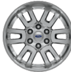
18" Machined Aluminum Optional; Included with XLT Premium Package