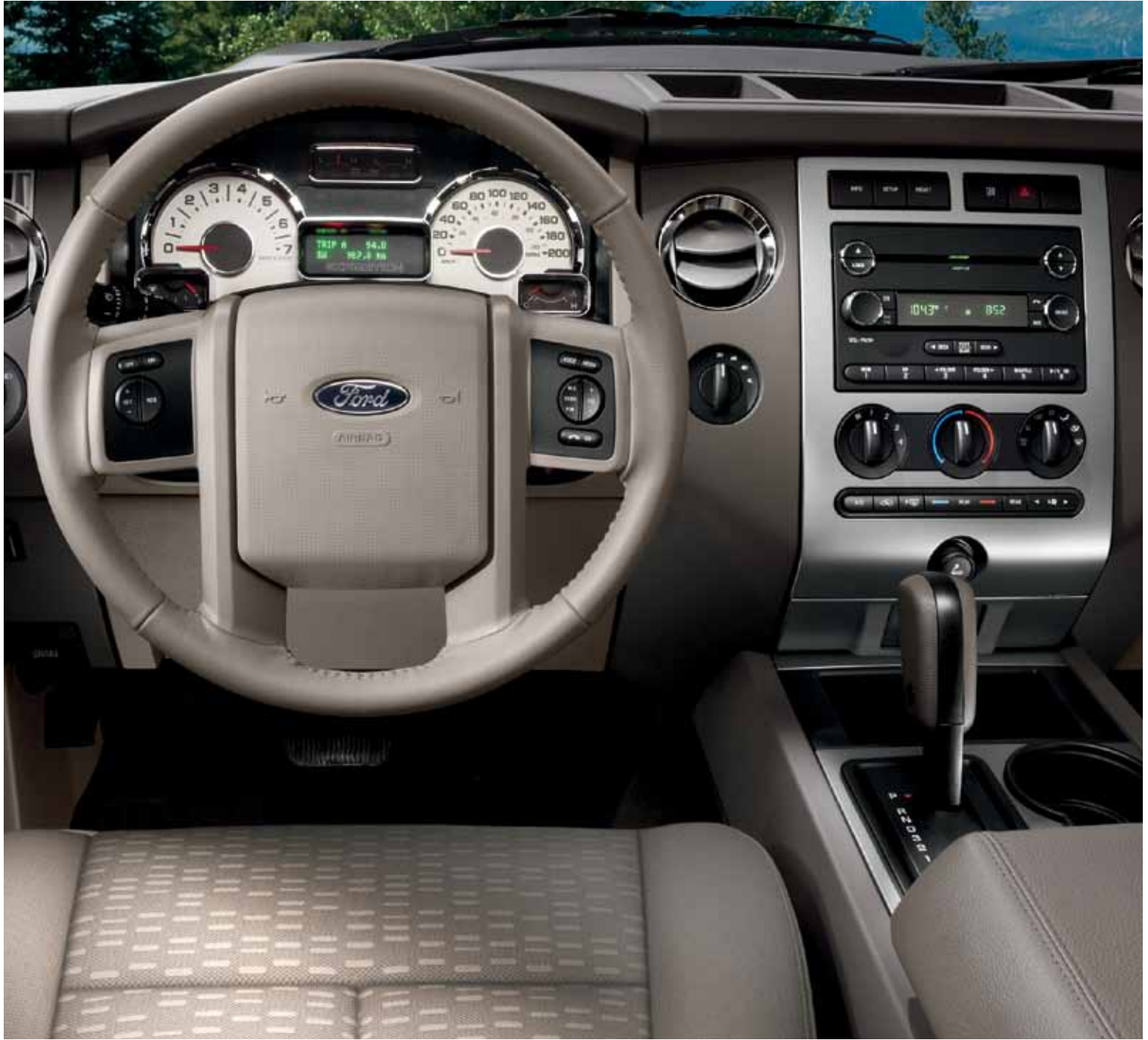
Stone cloth trim. | Power rear quarter windows. | All-weather floor mats in 1st and 2nd rows. 1 | Ford SYNC. ® | Power-adjustable pedals.