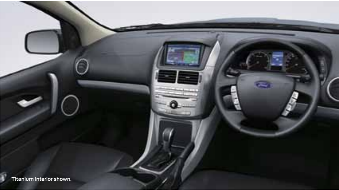
Titanium interior shown.

The show-stopping Territory features stylish projector headlights, high-tech LED front position lamps* and impressive 18" alloy wheels* with unique machined face finish. With detailing like this, you'll be the envy of your street.