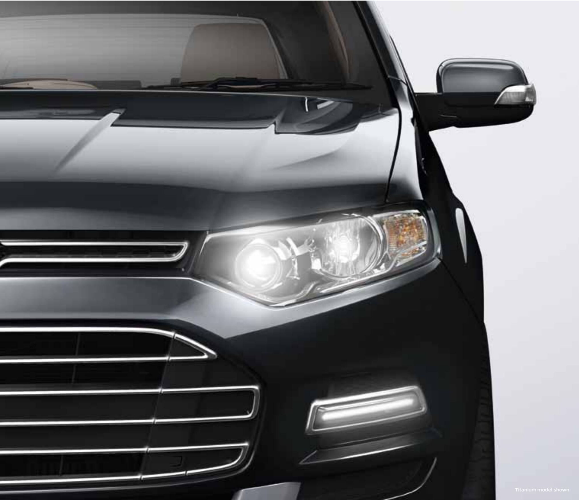
Titanium model shown.

Wherever it goes, the Territory steals the show. Its eye-catching design features a prestigious front grille and dynamic styling, giving the vehicle unique energy on the road and a real presence in the driveway. So, you're sure to make a bold statement every time you get behind the wheel.