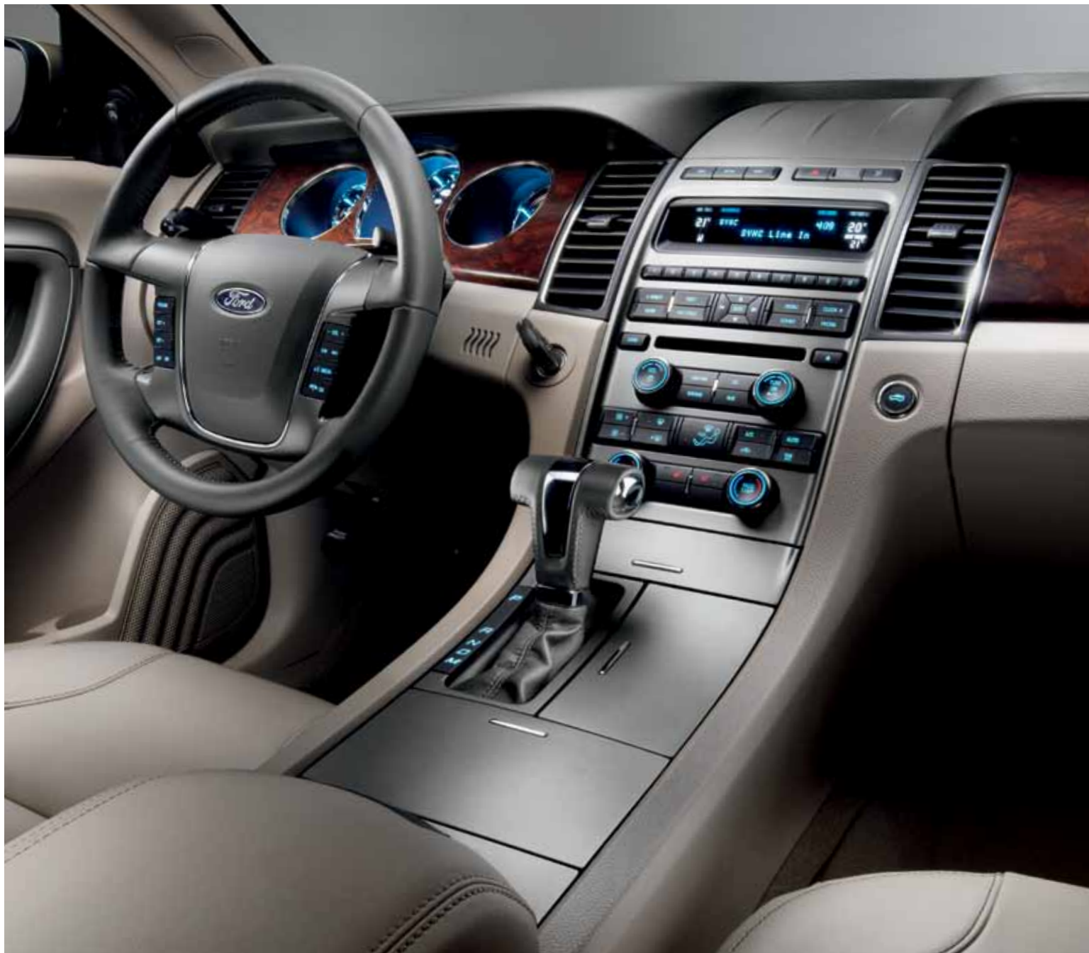
SEL. Light Stone leather trim with available equipment. | SEL. Rear view camera. 1 | SEL. Soft-touch door-trim panels. | SEL. Paddle shifters. | SEL. Leather-wrapped shifter with chrome trim.