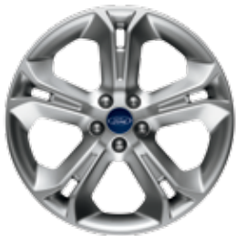
20" Premium Painted Aluminum Standard