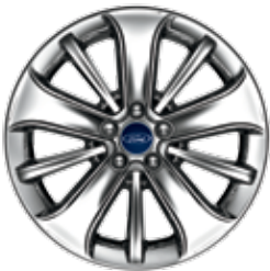
19" Chrome-Clad Aluminum Standard

1 Light Stone Leather with Perforated Inserts 2 Charcoal Black Leather with Perforated Inserts