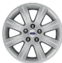
17" Sparkle Silver-Painted Aluminum Standard on SE

2 Light Stone Cloth – Standard 3 Charcoal Black Cloth – Standard 4 Light Stone Leather – Optional 5 Charcoal Black Leather – Optional