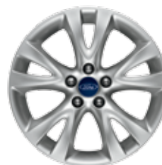
18" Sparkle Silver-Painted Aluminum Standard on SEL