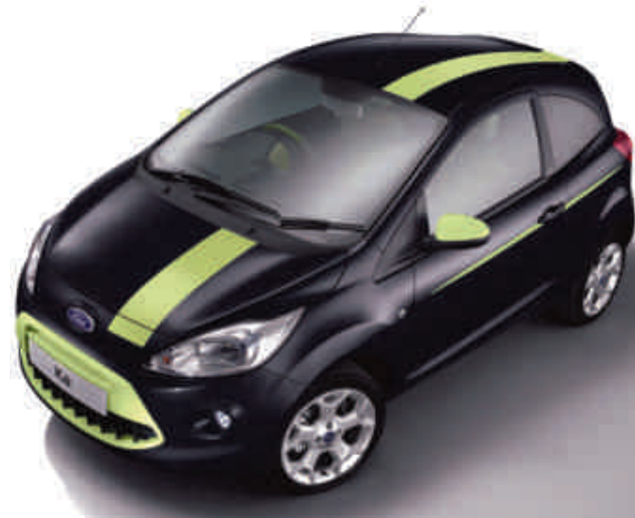
Image right: Model shown is a Digital-themed Ford Ka in Midnight metallic paint (option).

Image opposite: Model shown is a Digital-themed Ford Ka with Bluetooth® and USB (option)