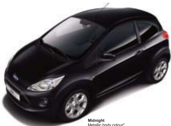
Midnight Metallic body colour*