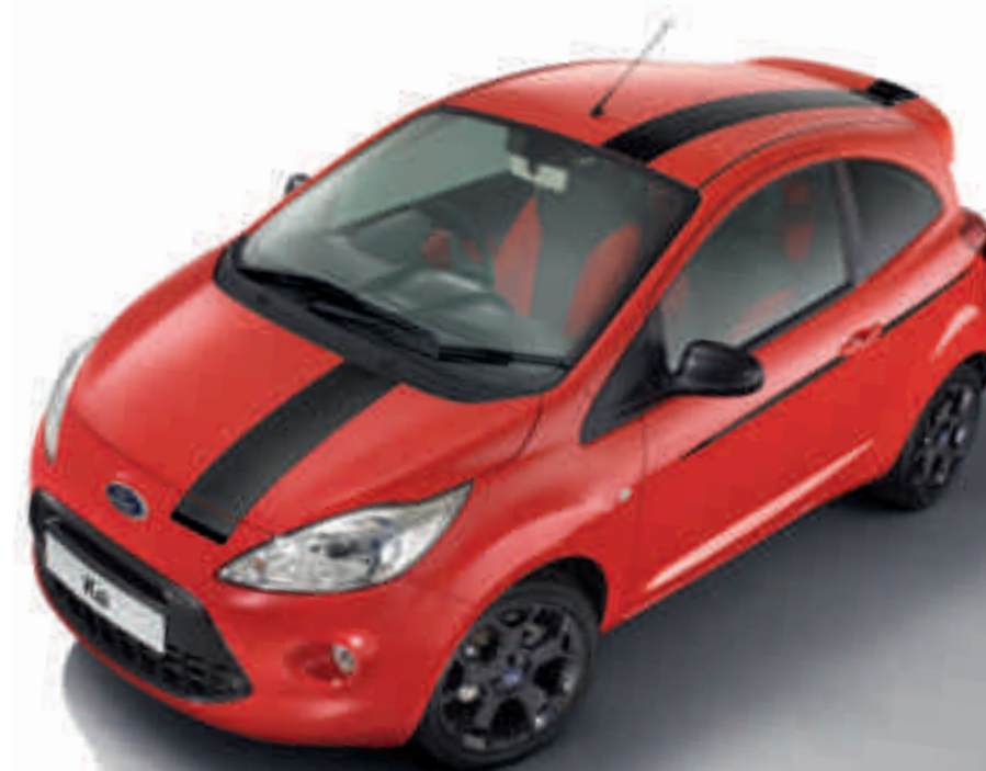
Image left: Model shown is a Grand Prix Ka, Bluetooth® and USB (option).

Image right: Model shown is a Grand Prix Ka with door number decals (accessory).