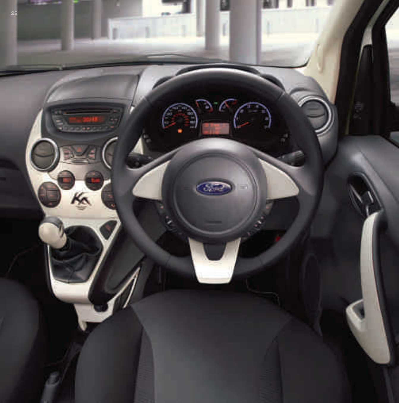
Image above: Model shown is a Ford Ka Titanium with Piste special paint (option).

Image opposite: Model shown is a Ford Ka Titanium with Fairland/Syracuse interior environment.