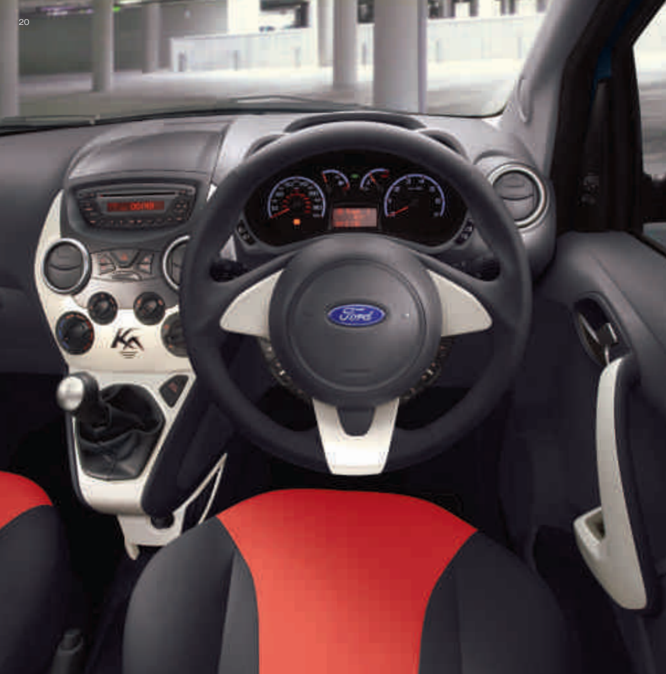
Image above: Model shown is a Ford Ka Zetec with Midnight metallic paint (option).

Image opposite: Model shown is a Ford Ka Zetec with Coral/Syracuse interior environment, and Bluetooth* and USB (option).