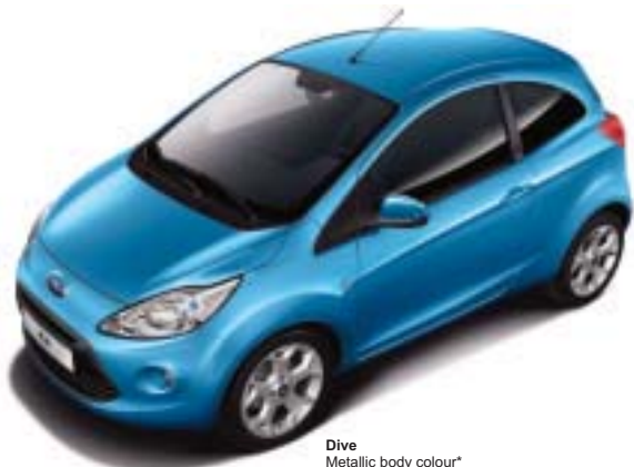
Dive Metallic body colour*