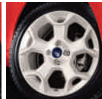
16" 5 Y-spoke alloy wheel in Piste* (Available as an accessory on all other models)