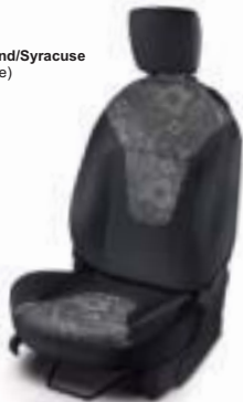
Fabric in Fairland/Syracuse (Studio and Edge)