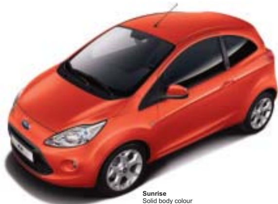
Sunrise Solid body colour