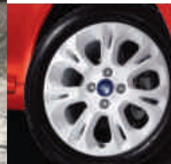
15" 7x2-spoke alloy wheel in Frozen White (Accessory)