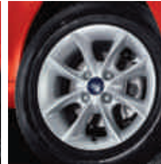
14" 4x2-spoke alloy wheel (Option on Edge, or as an accessory on all other models)