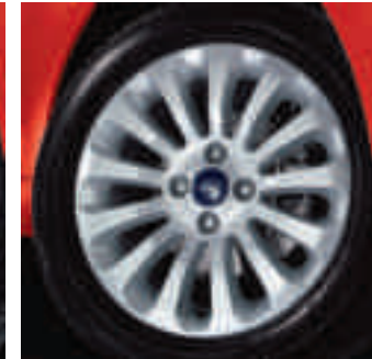
15" multispoke alloy wheel (Standard on Zetec, or as an accessory on all other models)