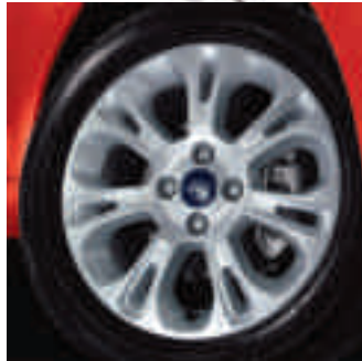
15" 7x2-spoke Silver alloy wheel Available as an accessory on all models.