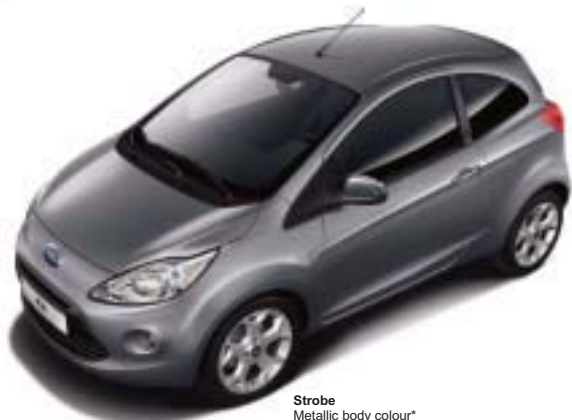
Strobe Metallic body colour*