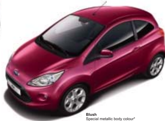
Blush Special metallic body colour*