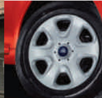
14" steel wheel with 6-spoke wheel cover (Standard on Studio and Edge)