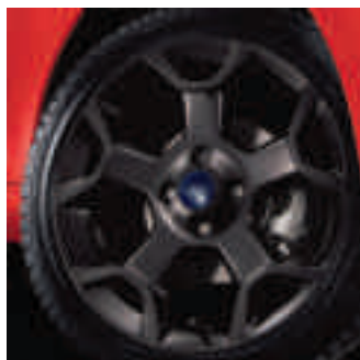
16" 5 Y-spoke alloy wheel in metallic black (Standard on Grand Prix II, Option on Metal, available as an accessory on all other models)