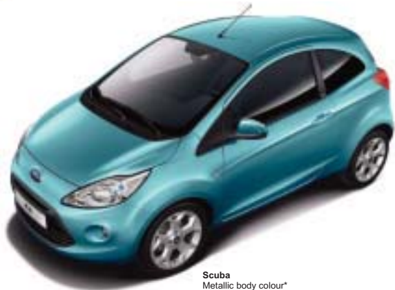
Scuba Metallic body colour*