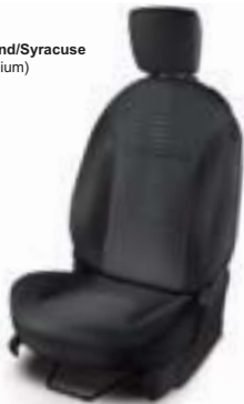
Fabric in Fairland/Syracuse (Zetec and Titanium)