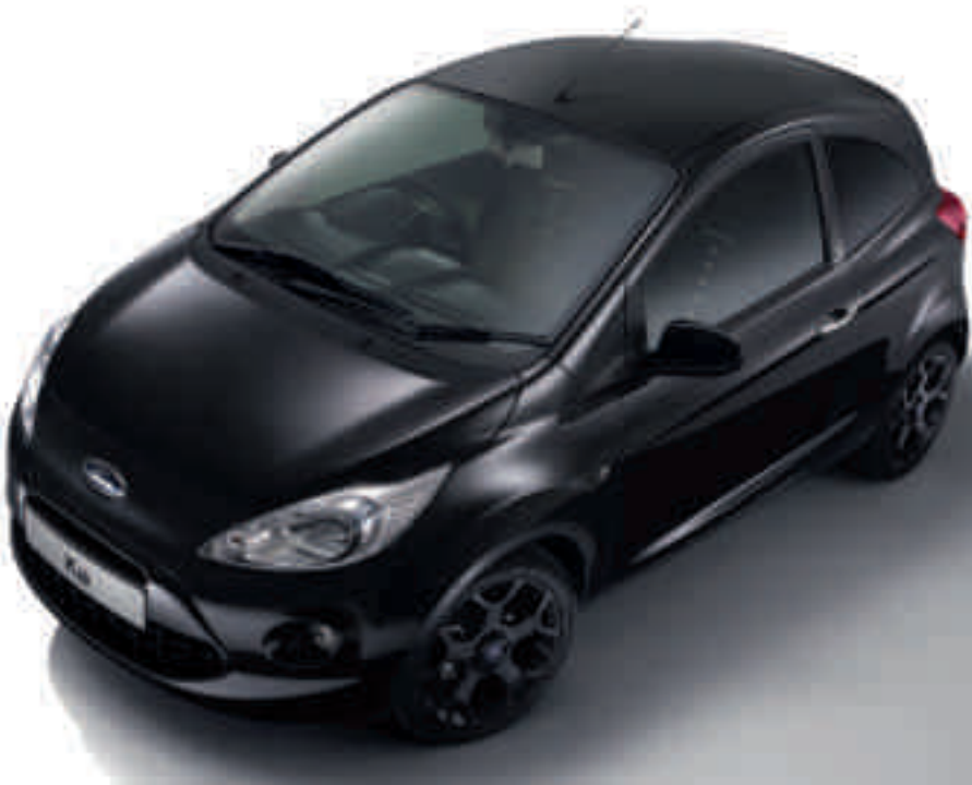
Image right: Model shown is a Metal Ka in Midnight metallic paint finish (option) with 16" metallic black alloy wheels (option and accessory).