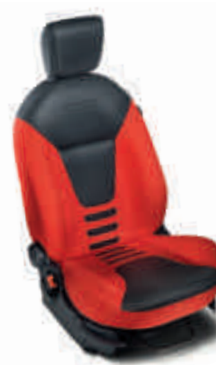
Unique Red and White seat fabric design

*Available in White for Sunrise, and in Sunrise for Crystal and Piste.