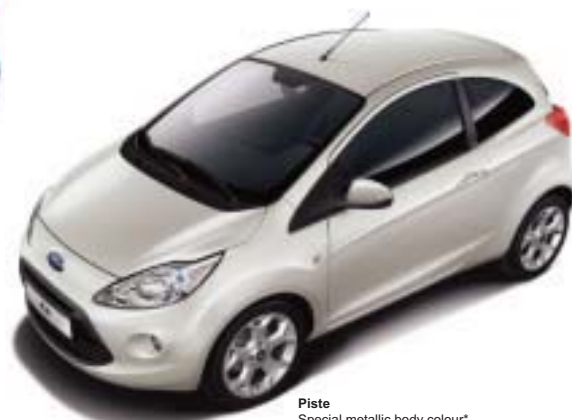
Piste Special metallic body colour*