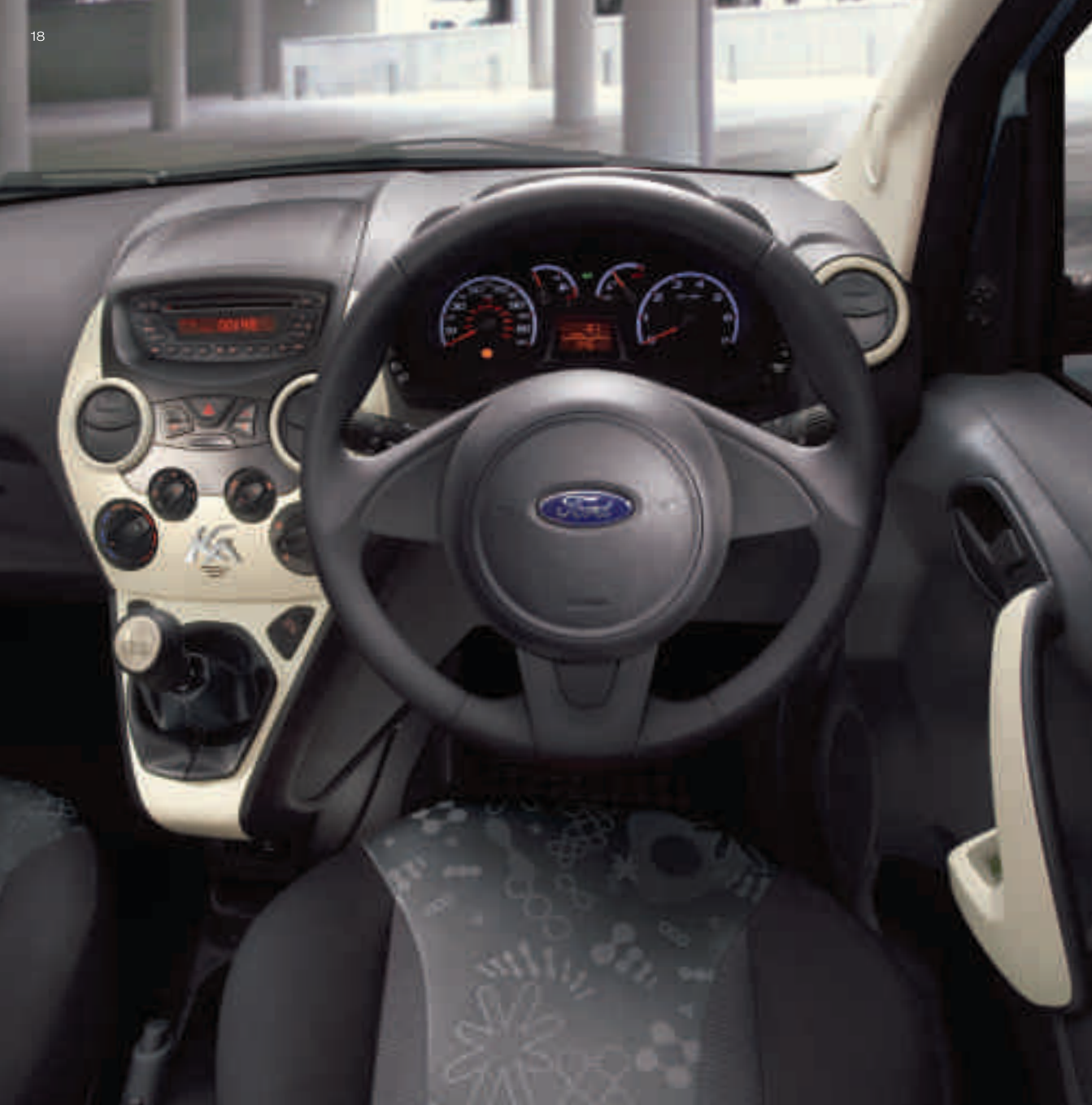
Image above: Model shown is a Ford Ka Edge with Strobe metallic paint (option).

Image opposite: Model shown is a Ford Ka Edge with Syracuse/Fairland interior environment.