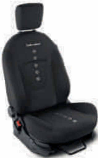
Unique seat fabric design In Black/Raptor fabric with chrome-look rings and Black head restraints.

Note Metal-Ka is available on vehicles with Midnight, Strobe and Moonlight exterior colours (option).