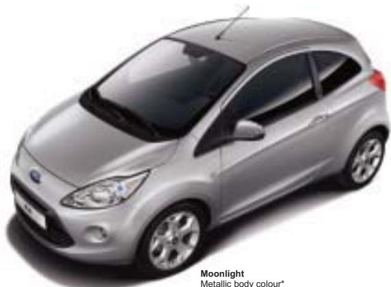
Moonlight Metallic body colour*