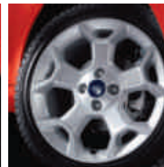
16" 5 Y-spoke alloy wheel (Option on Zetec and Grand Prix II standard on Titanium, Digital and Metal Ka, available as an accessory on all other models)