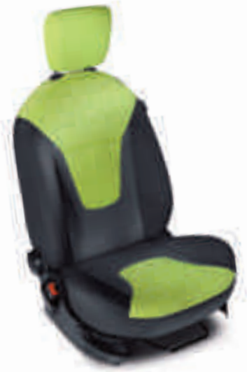
Unique Digital seat fabric design In Syracuse/Lime fabric.

Note Digital is available on vehicles with Crystal White, Midnight, Strobe, Moonlight and Piste exterior colours.