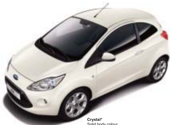
Crystal* Solid body colour