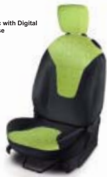
Syracuse fabric with Digital inserts/Syracuse (Digital)