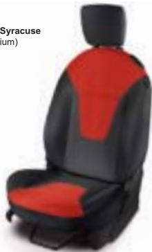
Fabric in Coral/Syracuse (Zetec and Titanium)