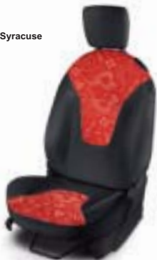
Fabric in Coral/Syracuse (Edge)