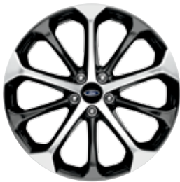
20" 10-Spoke Machined and Low-Gloss Ebony-Painted Aluminum Optional