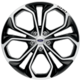
20" Machined and Painted Aluminum Standard

Available Ford Custom Accessories Visit your Ford of Canada Dealer to shop the complete collection