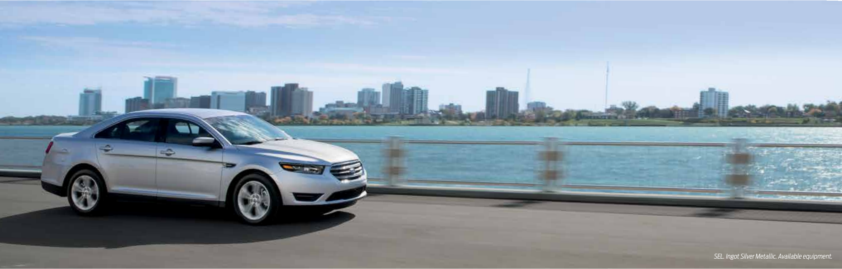
SEL. Ingot Silver Metallic. Available equipment.