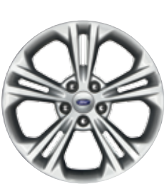
18" Sparkle Silver-Painted Aluminum Standard: SE and SEL