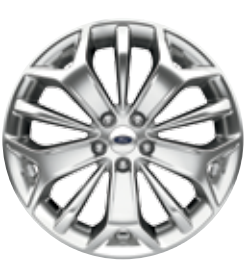
19" Premium Luster Nickel-Painted Aluminum Standard