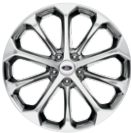
20" Polished Aluminum Optional