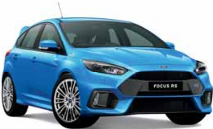
Focus RS shown in Nitrous Blue 8 .