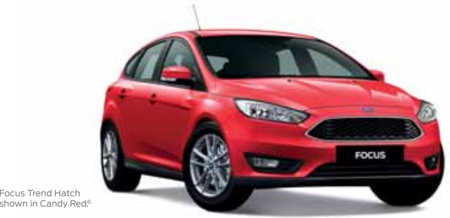
Focus Trend Hatch shown in Candy Red 8 .