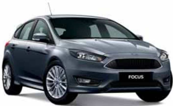
Focus Sport shown in Magnetic 1 .