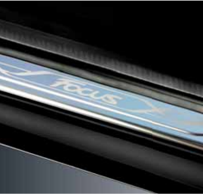
Scuff plates. Elegant polished stainless steel scuff plates, with etched 'Focus' script.