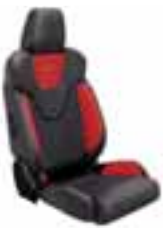
Trim colour: Race Red