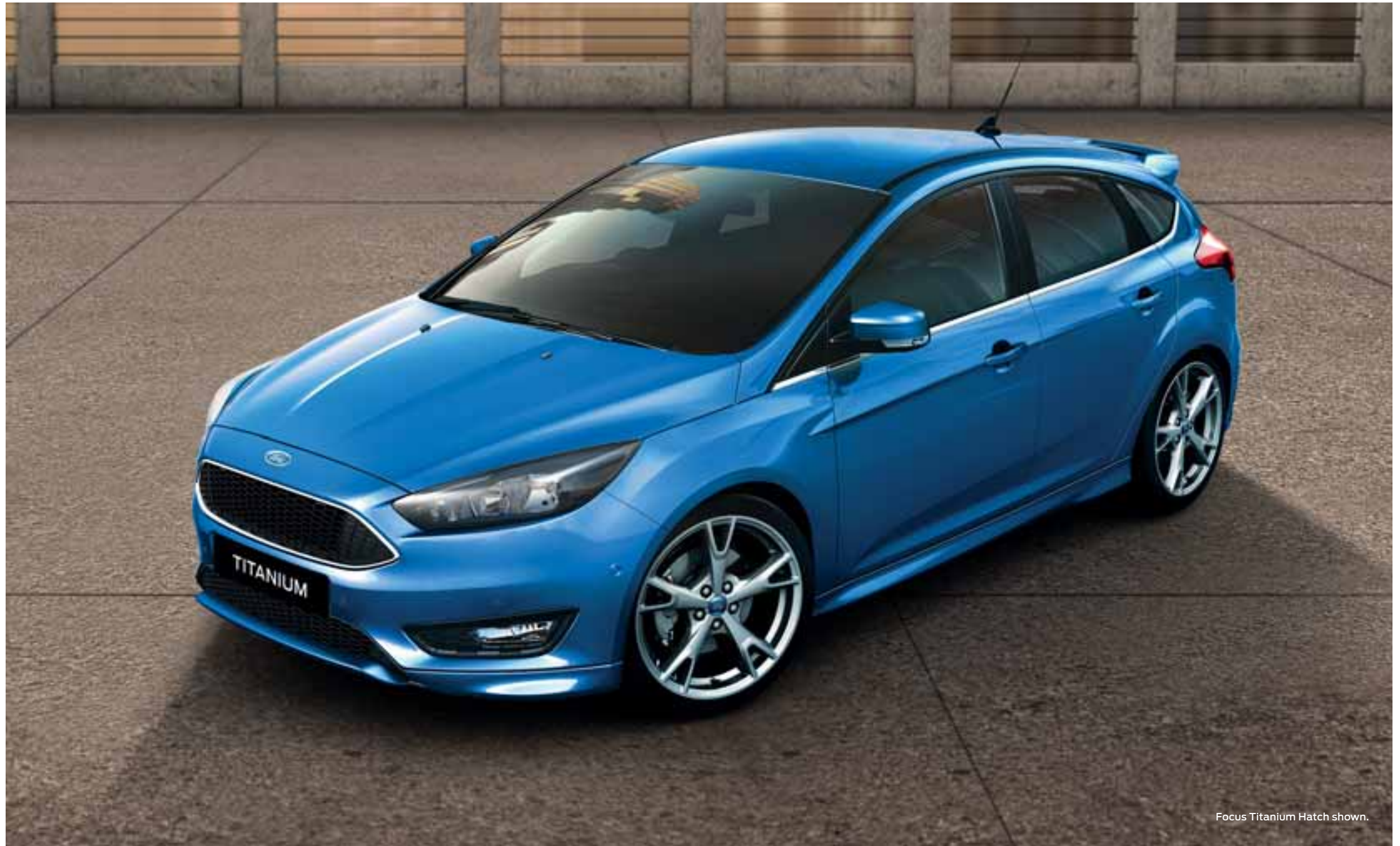
Focus Titanium Hatch shown.