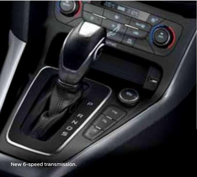
New 6-speed transmission.