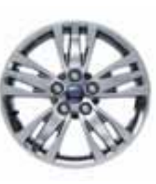
16" 5x3 spoke alloy wheel