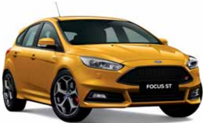
Focus ST show in Tangerine Scream 8