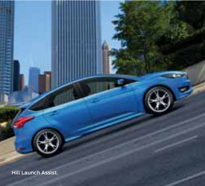
Hill Launch Assist.