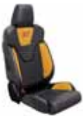
Trim colour: Tangerine Scream