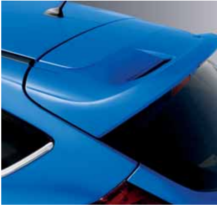
Hatch rear spoiler – large. This accessory gives an aerodynamic finish to the roof line.