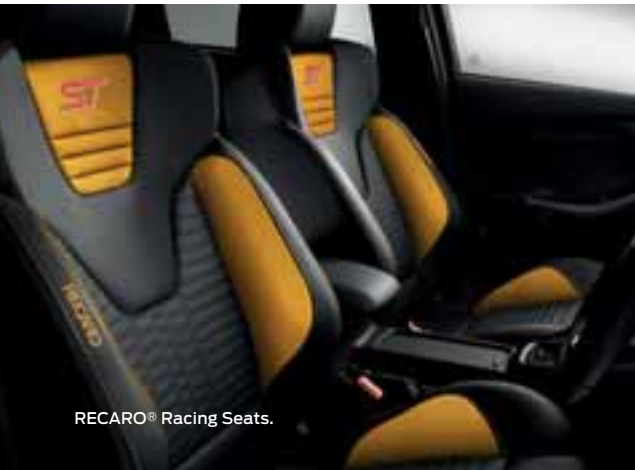
RECARO® Racing Seats.