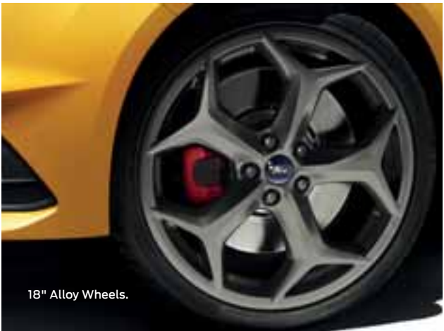
18" Alloy Wheels.