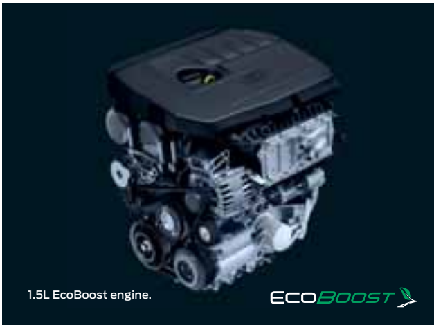
1.5L EcoBoost engine.