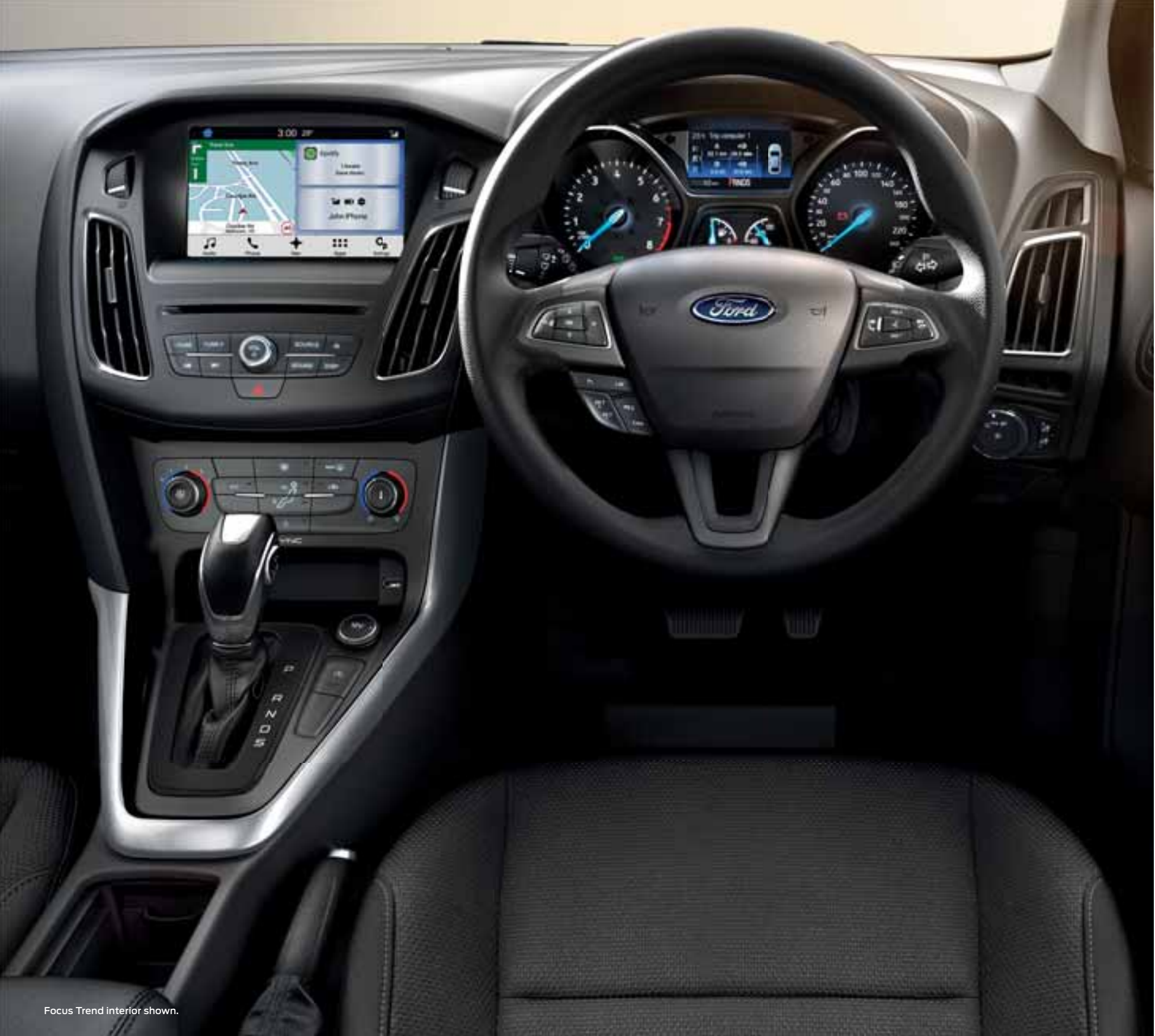
Focus Trend interior shown.