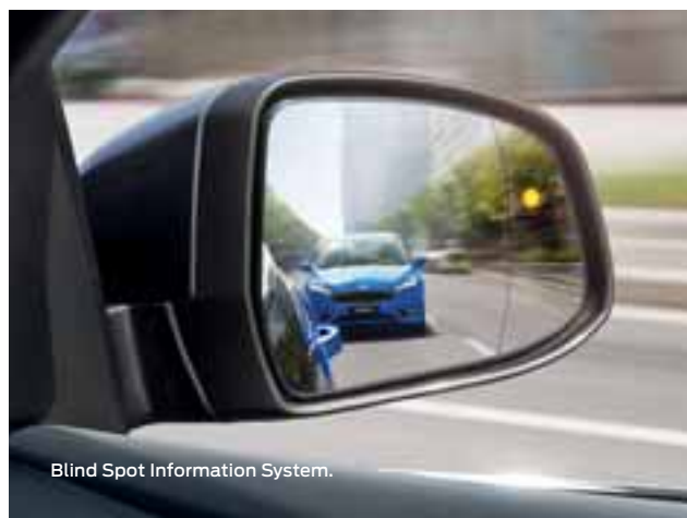
Blind Spot Information System.