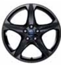
18" 5 spoke alloy wheel