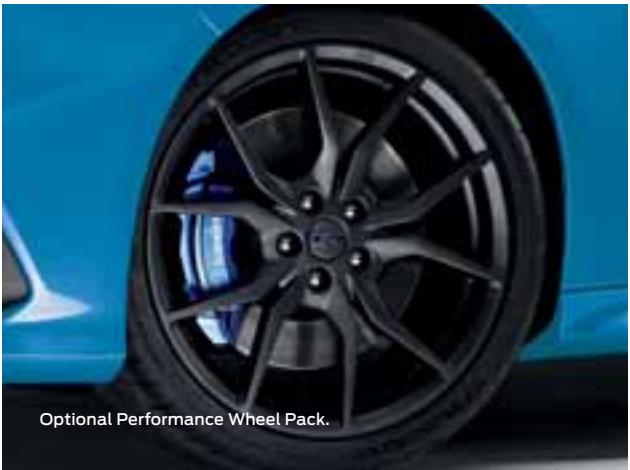
Optional Performance Wheel Pack.