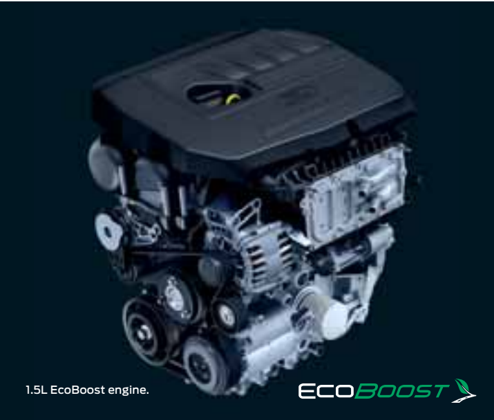
1.5L EcoBoost engine.