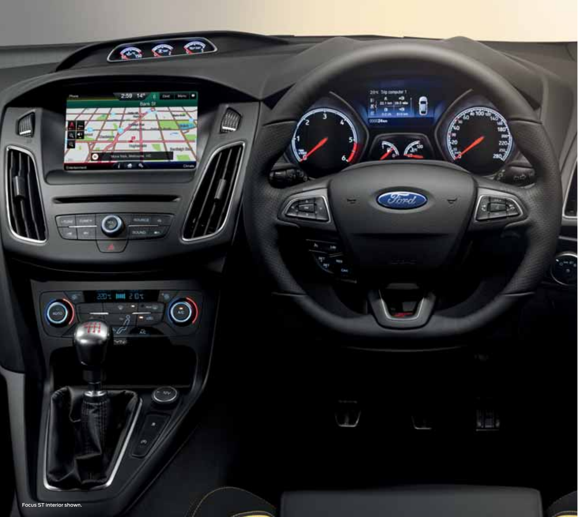
Focus ST interior shown.