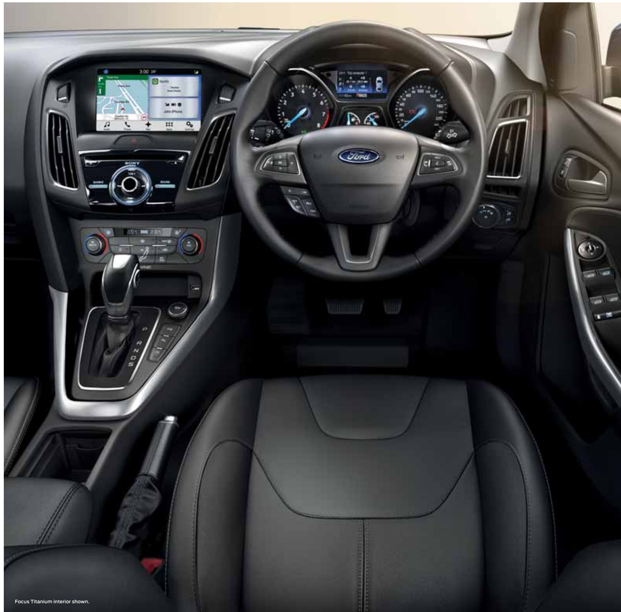
Focus Titanium interior shown.