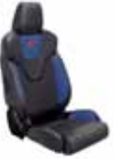
Trim colour: Spirit Blue