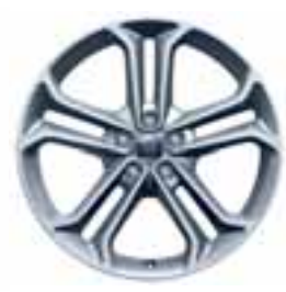
19" 5x2 spoke alloy wheel (ST only)