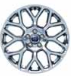
18" 8x2 spoke alloy wheel