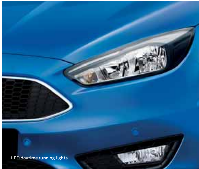
LED daytime running lights.