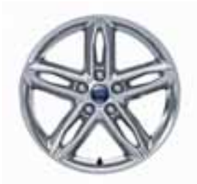
17" 5x2 spoke alloy wheel