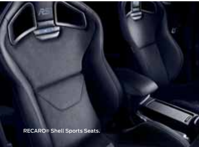
RECARO® Shell Sports Seats.