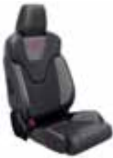
Trim colour: Smoke Storm