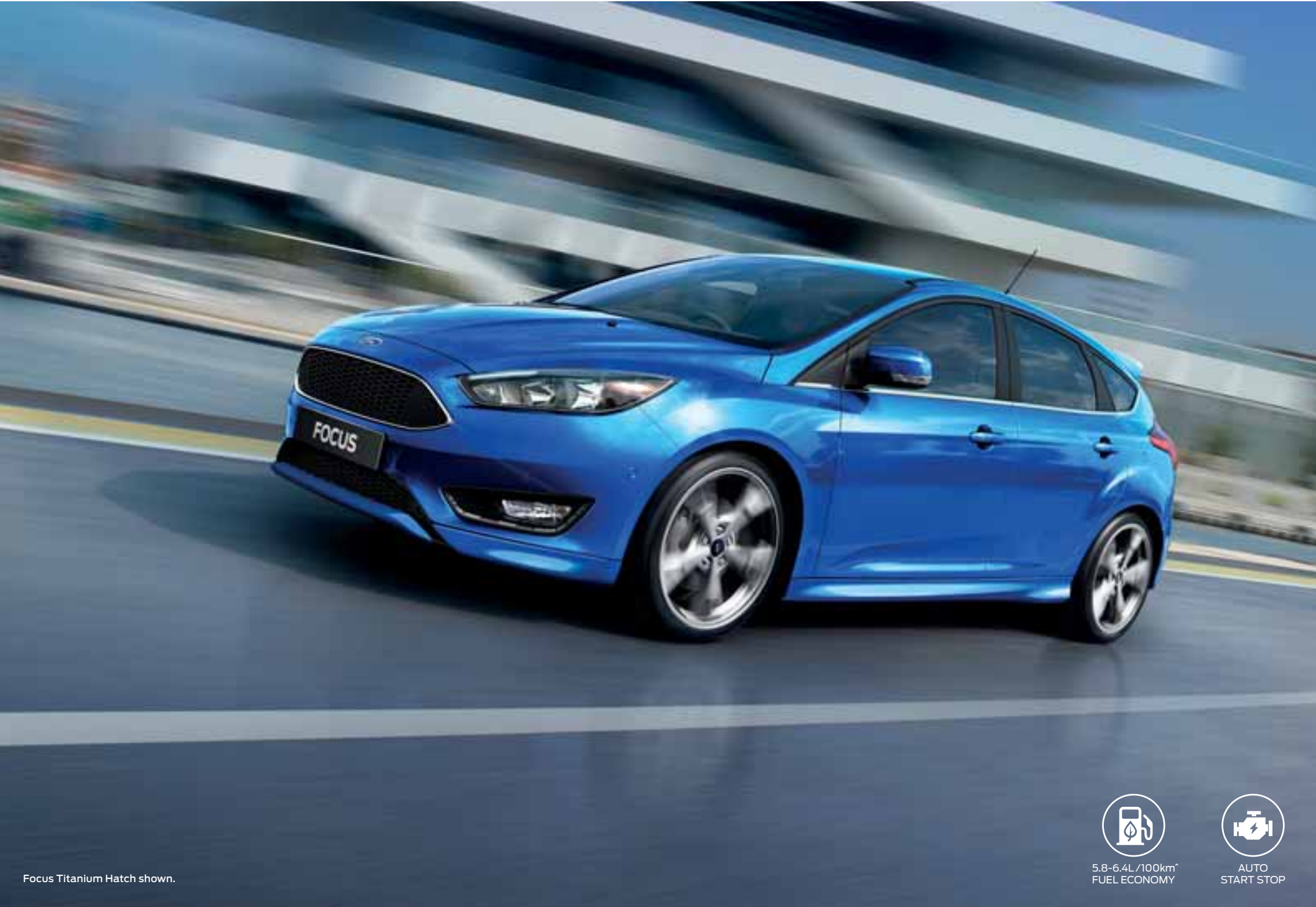
Focus Titanium Hatch shown.

Saves you money. When your Focus is at a standstill, Auto Start-Stop* automatically shuts down the engine, to reduce fuel use. Release the brake and the engine restarts.