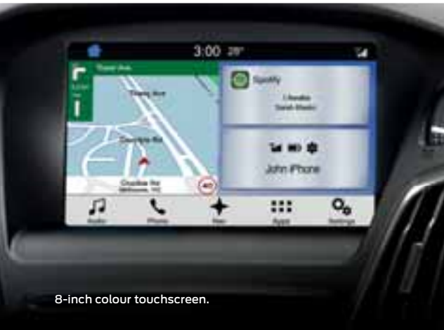
8-inch colour touchscreen.