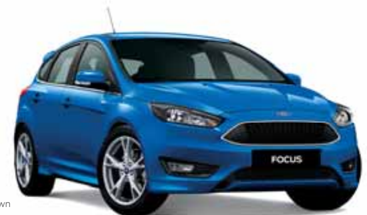
Focus Titanium shown in Winning Blue 1 .