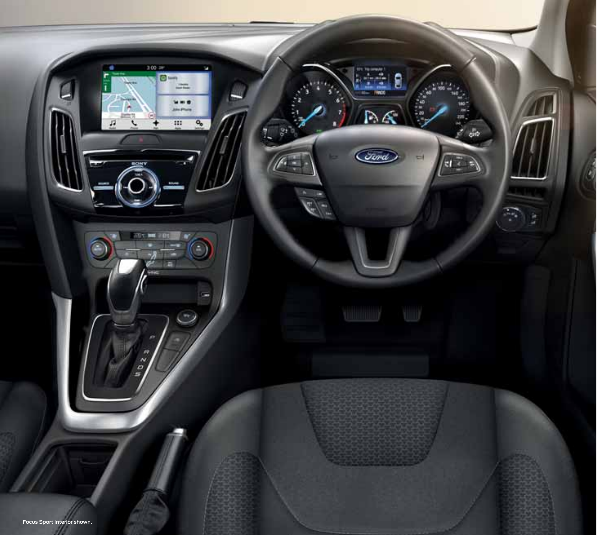
Focus Sport interior shown.