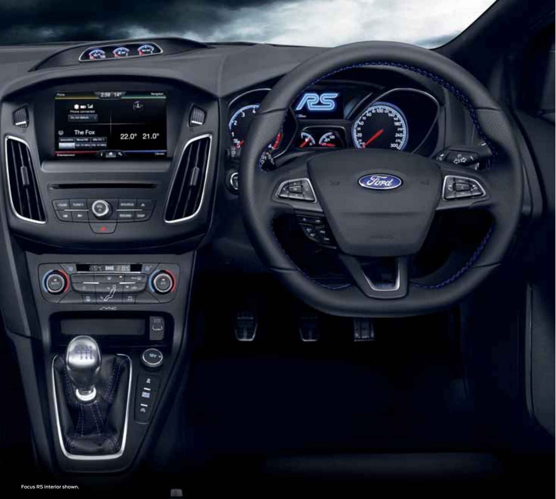
Focus RS Interior shown.