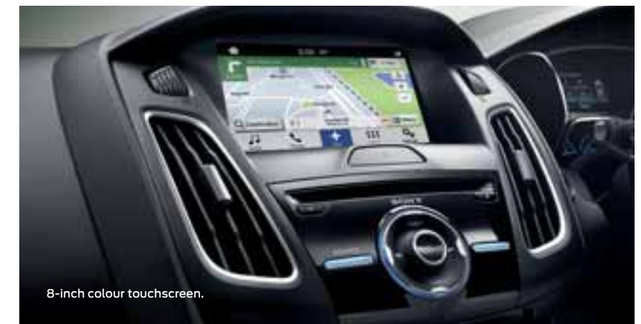
8-inch colour touchscreen.