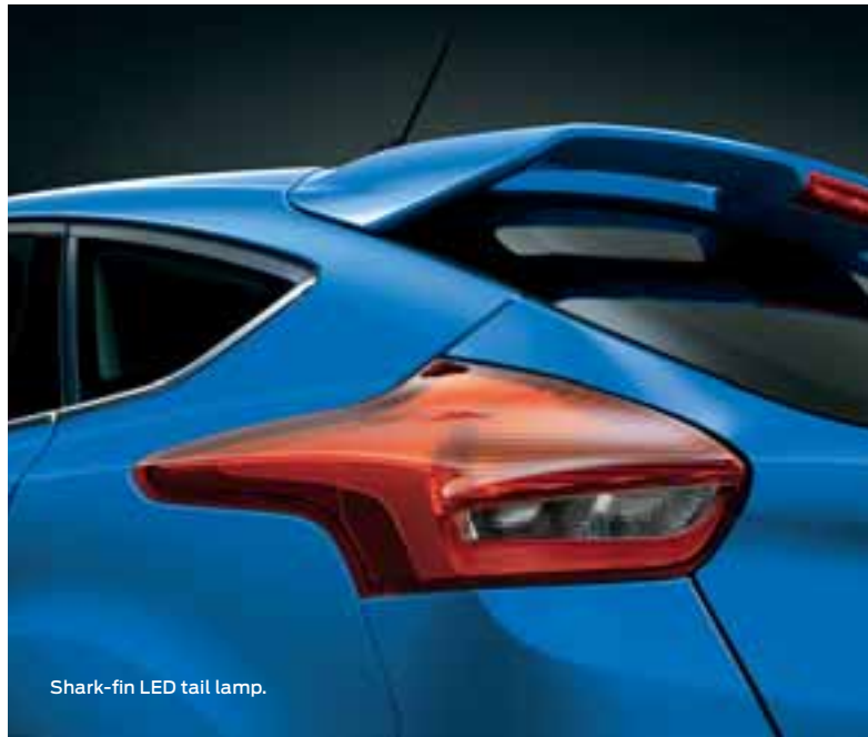
Shark-fin LED tail lamp.