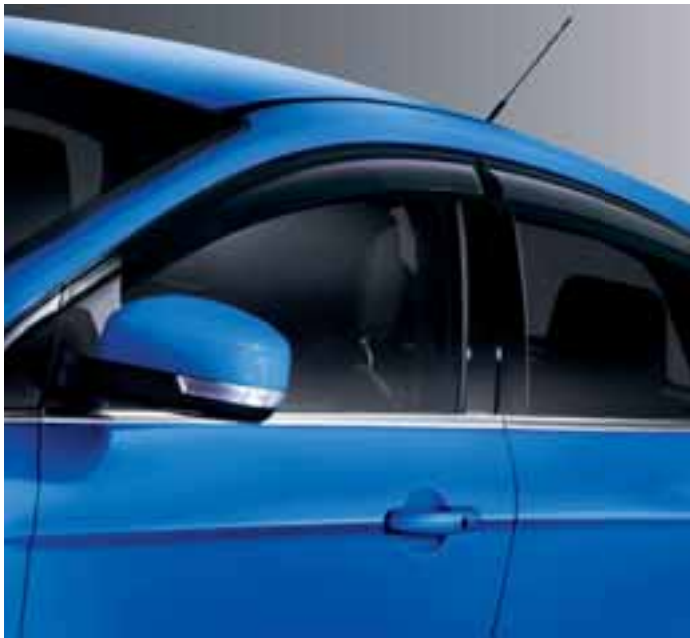
Weathershield. Reduces wind turbulence and noise, allowing you a more enjoyable drive with the windows down, even during light rain. Front and rear available.