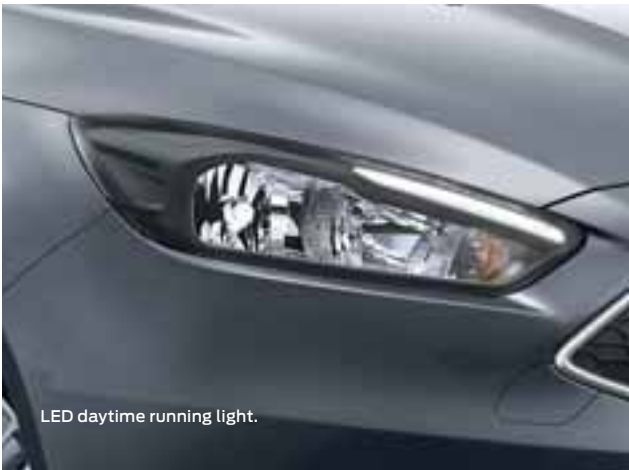
LED daytime running light.