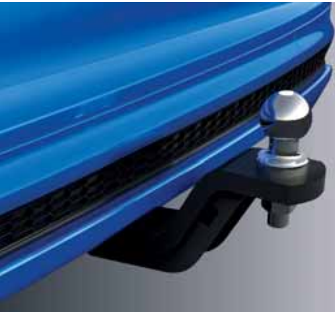
Tow pack. Whether your towing requirements are for work or play, the Genuine Ford Tow Pack will make towing a breeze.