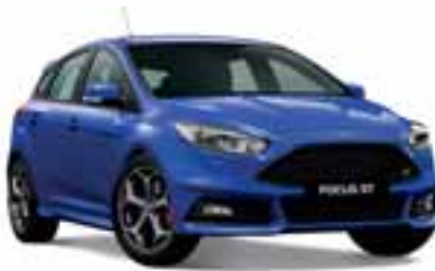
Deep Impact Blue*