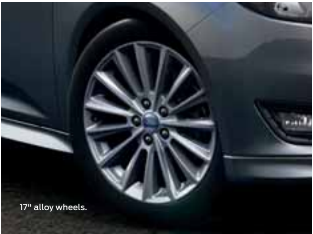
17" alloy wheels.