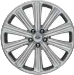
20" Polished Aluminum Optional: 300A Included: 301A, 303A