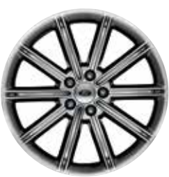
19" Painted Aluminum Standard

Visit your Ford of Canada Dealer to shop the complete collection