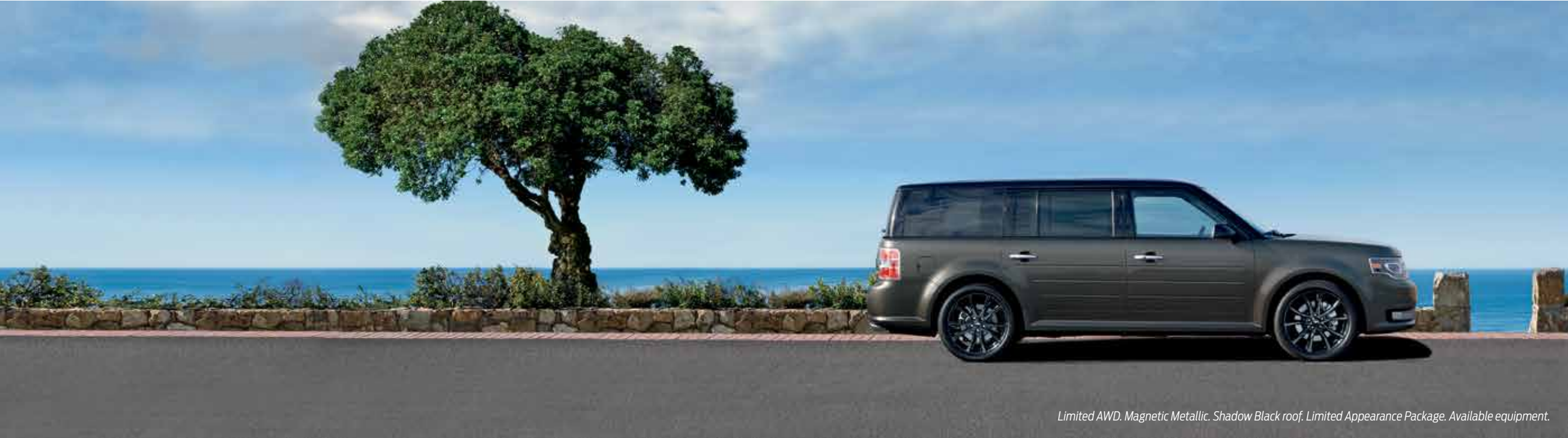
Limited AWD. Magnetic Metallic. Shadow Black roof. Limited Appearance Package. Available equipment.