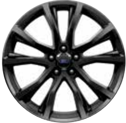
20" High-Gloss Black-Painted Aluminum Included: Limited Appearance Package