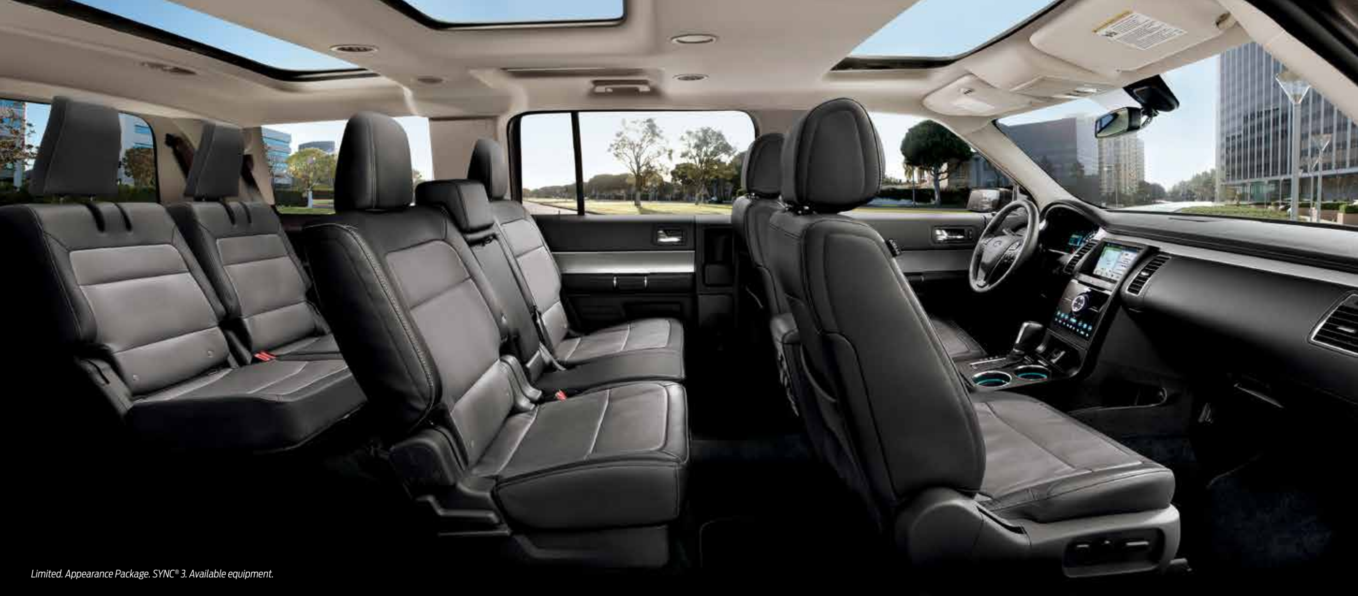
Limited. Appearance Package. SYNC® 3. Available equipment.