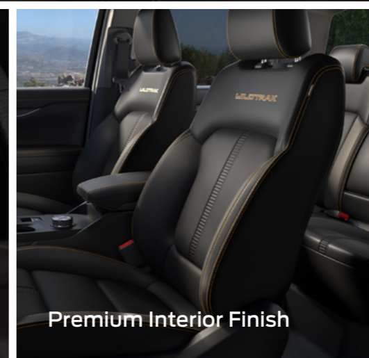
Premium Interior Finish