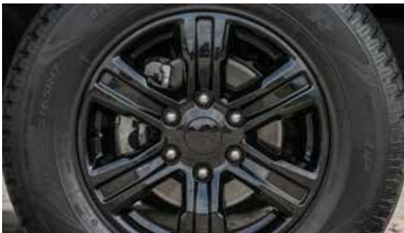
17" Black Alloy Wheels