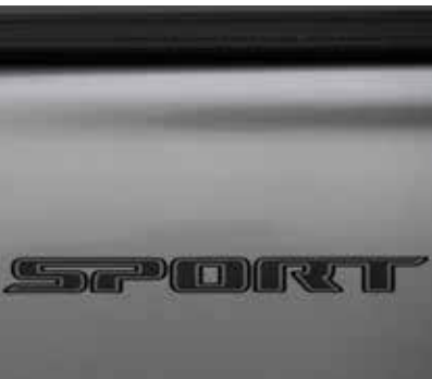
Small Sport Decal