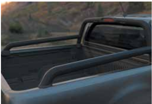
Black Extended Sports Bar