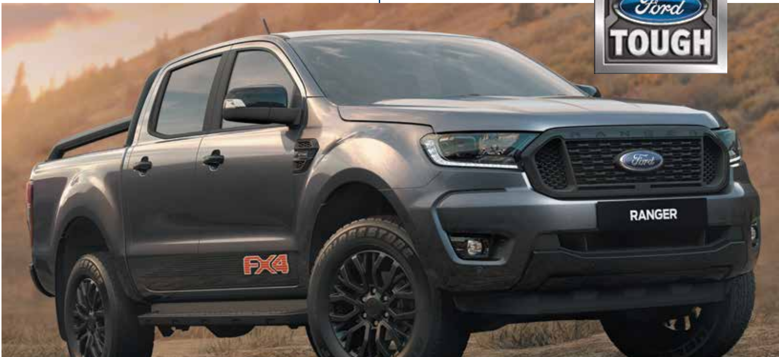
FX4 Side Decals & 3D Tailgate Badging