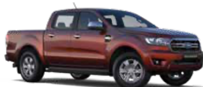
Copper Red (Metallic*)

*Metallic body colours are options at extra cost.