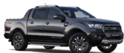
Agate Black (Metallic*)