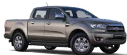
Diffused Silver (Metallic*)