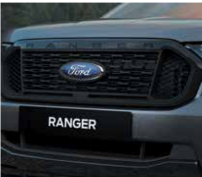
Black Mesh Grille

The RANGER FX4 is available in the following colours: