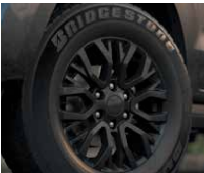
18" Black Alloy Wheels