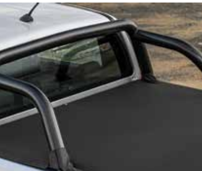
Black Sports Bar