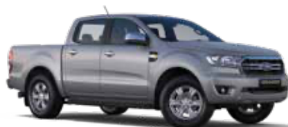
Moondust Silver (Metallic*)