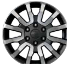
18" Alloy wheel (Standard on Wildtrak derivatives only)