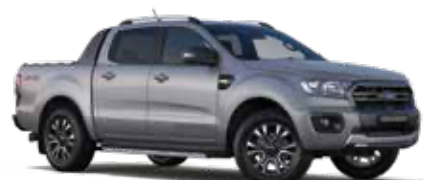
Moondust Silver (Metallic*)