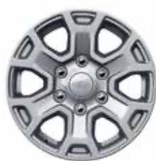
16" Alloy wheel (Optional on XL derivatives, at an additional cost)