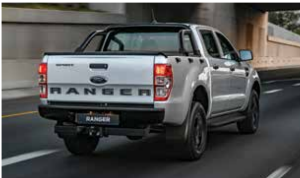
Ranger Decal on Tailgate

The RANGER XL SPORT is available in the following colours: