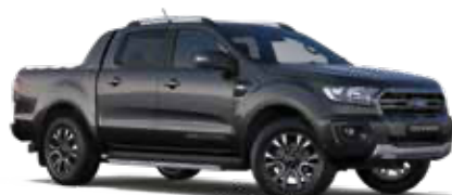
Sea Grey (Metallic*)