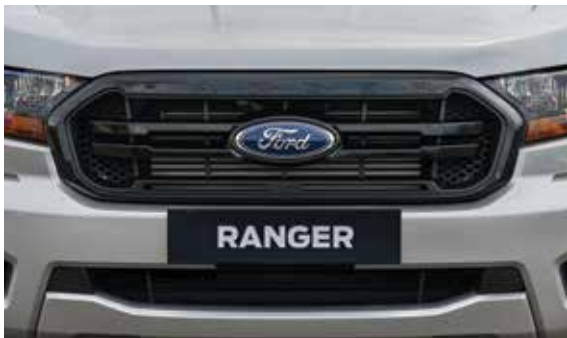
Black Gloss Grille