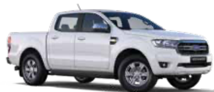
Frozen White (Solid)