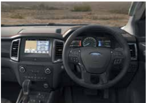
Unique leather trimmed FX4 seats

*Metallic body colours are options at extra cost.