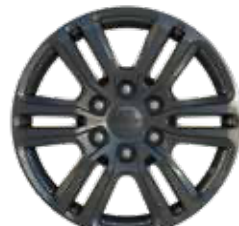
Alternative Wildtrak Wheel (Optional on Wildtrak derivatives only)