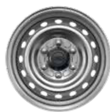
16" Steel wheel

Note: The images are used to illustrate body colours only, and may not reflect the vehicle described. Colours and trims reproduced within this brochure may vary from the actual colours, due to the limitations of the printing processes used.