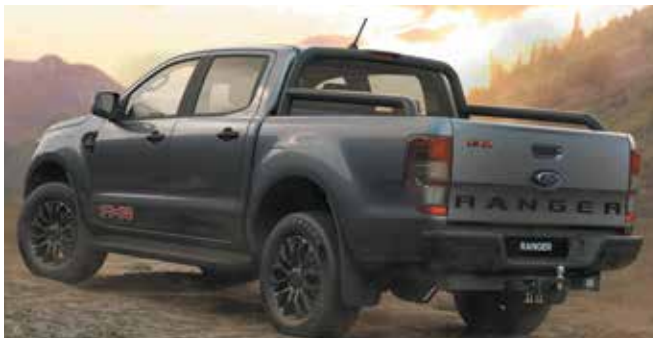
Black Painted Handles and Mirrors