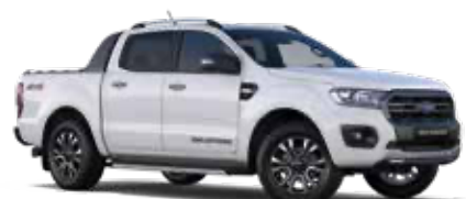
Frozen White (Solid)