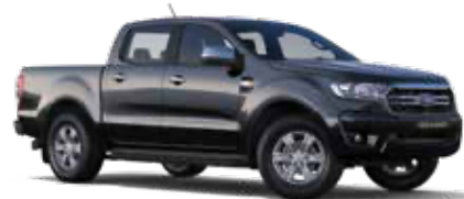
Agate Black (Metallic*)