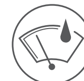
Rain Sensing Wipers