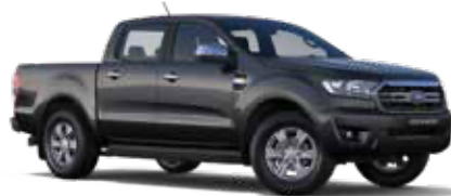
Sea Grey (Metallic*)