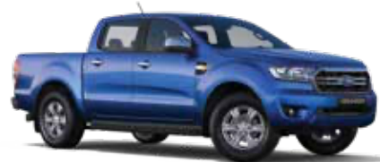
Blue Lightning (Metallic*)