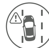
Lane Keeping Aid