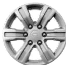
17" Silver Alloy wheel (Standard on XLS and XLT derivatives) Available in black as an option at an additional cost for XLS, XLT, and XL (Super and Double Cab only)