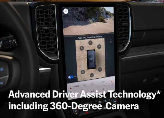
Advanced Driver Assist Technology* including 360-Degree Camera