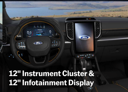
12" Instrument Cluster & 12" Infotainment Display