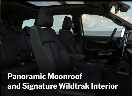
Panoramic Moonroof and Signature Wildtrak Interior