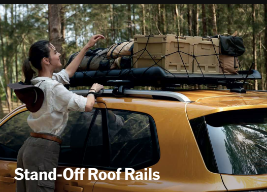
Stand-Off Roof Rails