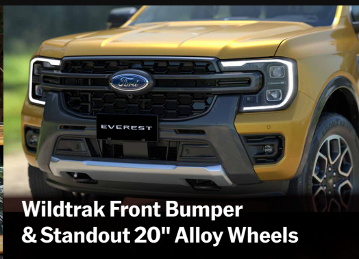
Wildtrak Front Bumper & Standout 20" Alloy Wheels