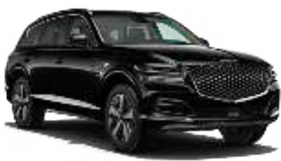
GV80 3.5T AWD ADVANCED