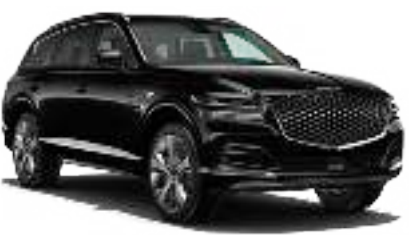
GV80 3.5T AWD PRESTIGE