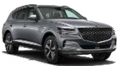
GV80 2.5T AWD ADVANCED