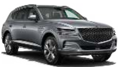
GV80 2.5T AWD PRESTIGE