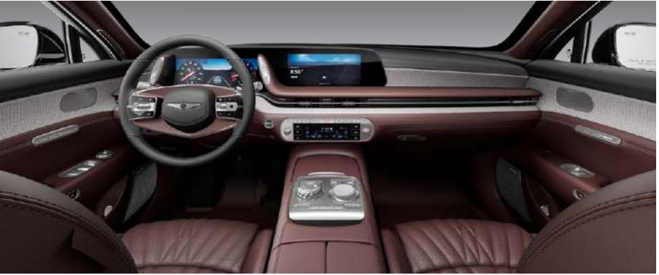
OBSIDIAN BLACK & BORDEAUX BROWN