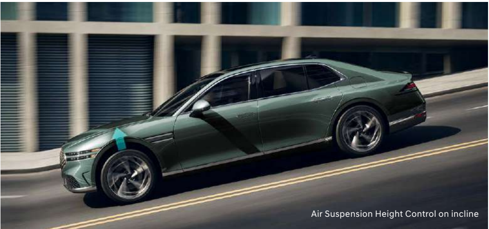
Air Suspension Height Control on incline