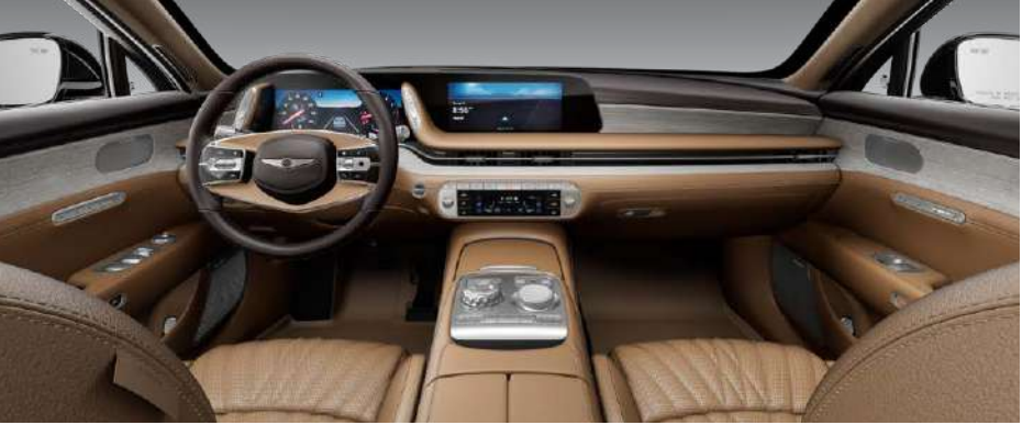
VELVET BURGUNDY & DUNE BEIGE