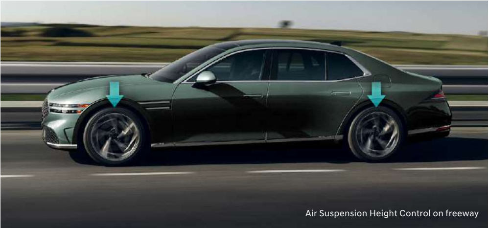
Air Suspension Height Control on freeway