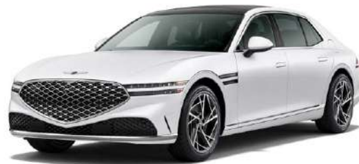
VERBIER WHITE MATTE