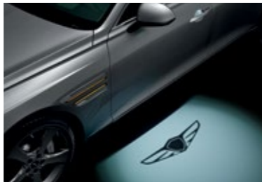
Puddle lamps with GENESIS logo