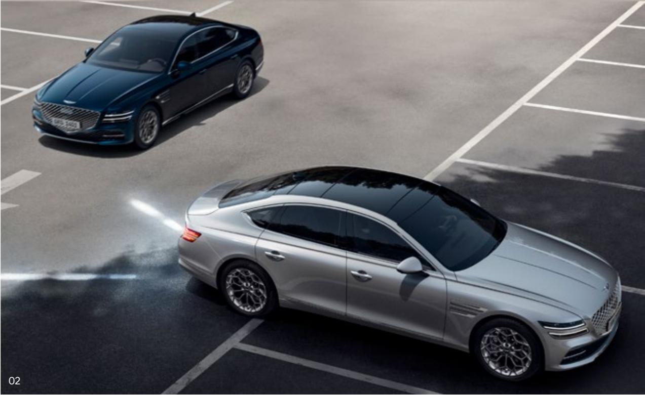
02. Rear Cross-Traffic Collision-Avoidance Assist (RCCA) system _ This system alerts the driver if a collision risk is detected from the left and right sides of the vehicle while reversing. If the risk increases even after the warning, RCCA helps to stop the vehicle.