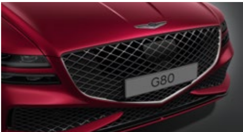
Dark chrome radiator grille