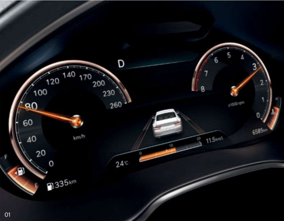
01. 12.3" 3D cluster _ The wide, high-resolution 12.3" 3D cluster provides various view modes and differentiated drive mode illumination. The cluster's embedded camera tracks the driver's eye movements to provide 3D information at any angle, maximizing visibility.

CONTROLLING THE INFOTAINMENT FEATURES HAS NEVER BEEN SO EXCITING. EVERY COMMAND YOU GIVE IS PART OF THE PLEASURE.