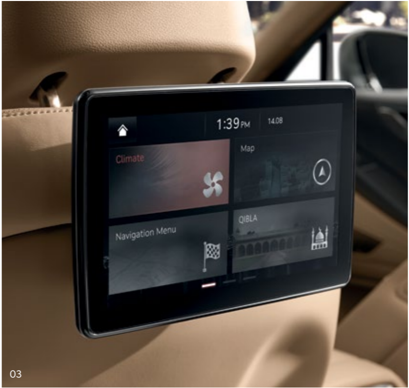
03. Rear seat dual monitors _ The dual rear seat displays consist of large 9.2" monitors that have a wide viewing angle. The monitors allow right and left rear seat passengers to use separate video and audio inputs. Touchscreen features make the monitors easy to use, while the monitors can be tilted to compensate for front-seat adjustments.