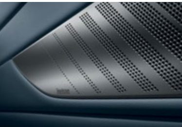
18 Lexicon speakers system