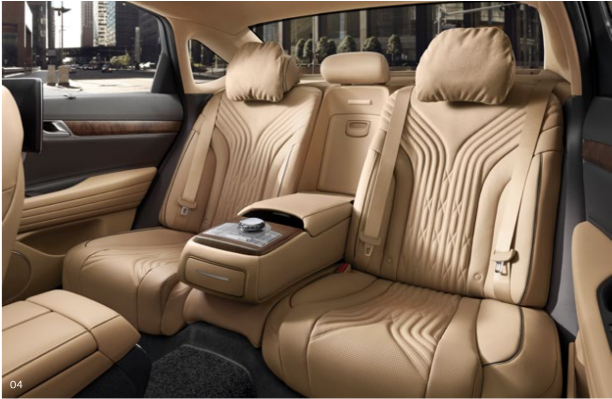
04. Power and ventilated/heated rear seats _ The rear seats can slide forwards or backwards for adjustment while the seats' heating and ventilation system is linked to the vehicle's speed, which automatically controls the blower speed to provide passengers with more meticulous care. The driver can also easily control heating/ventilation of all seats via the main climate control panel.