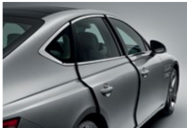
Ghost door closing