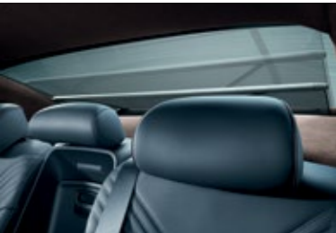
Electric backlite curtain