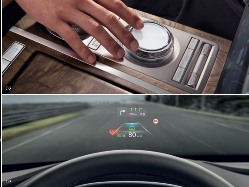
02. 03. GENESIS touch controller _ Located on the center console, this allows users to control the various infotainment systems easily without having to repeatedly touch any buttons or screens. Its handwriting recognition system helps users set a destination or enter a phone number simply by using handwritings instead of typing into a keyboard. Head-Up Display _ Shows driving speed and GPS information, as well as key driver assist information and crossroads. The high-resolution, 12" wide display boasts clear visibility during daytime or nighttime.