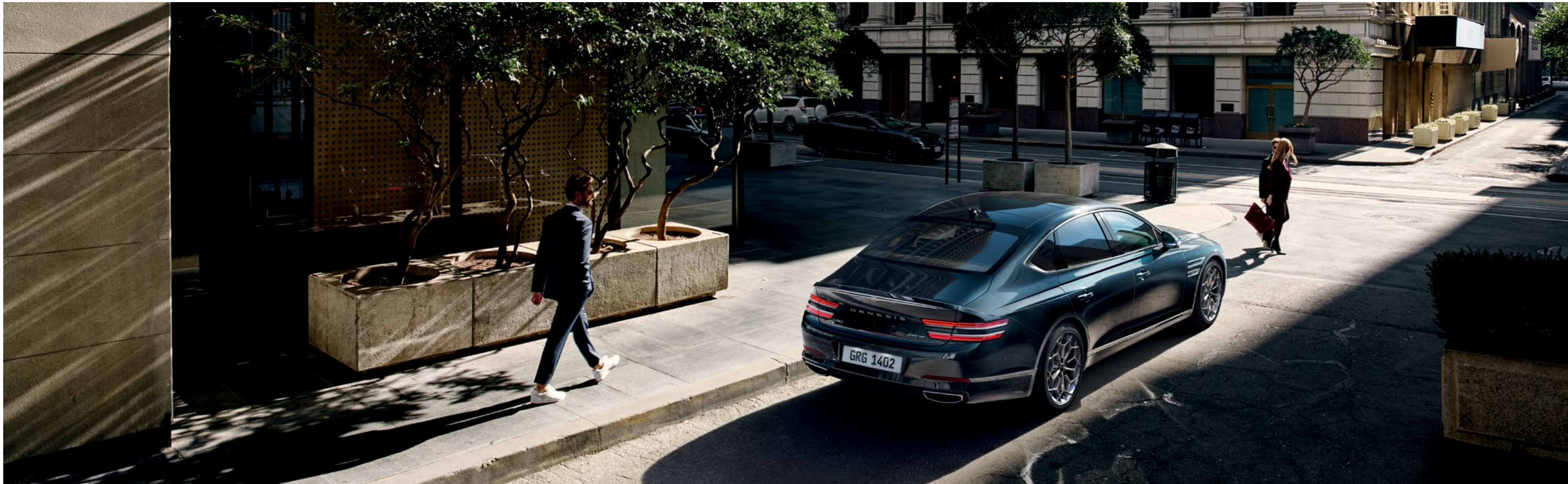
Tasman Blue (19" Hypersilver wheels [10 Y-spoke type (B)])