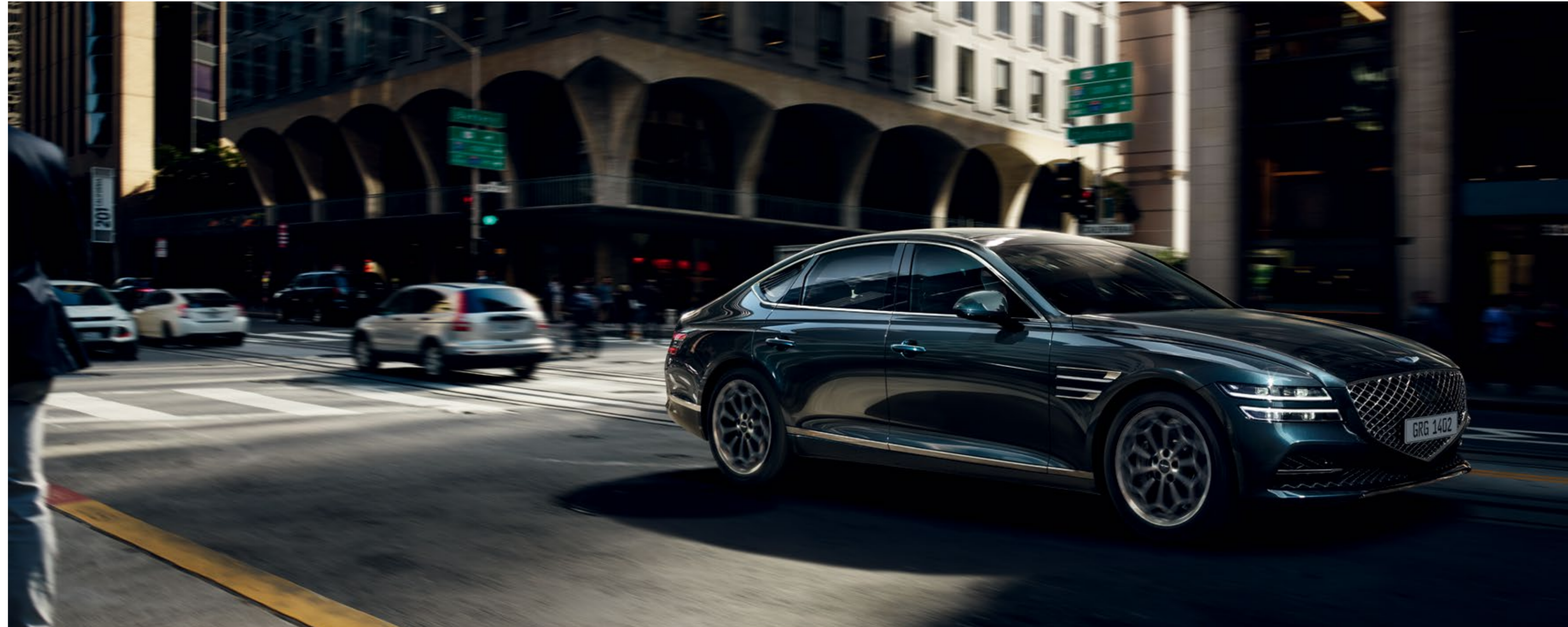
Tasman blue (19" Hypersilver wheels [10 Y-spoke type (B)])

The impeccable balance between the brand's next-generation turbo engine and platform leads to astonishing power and stability, enhancing the excitement of driving. Advanced features like Preview-ECS help you identify obstacles ahead, promising nothing but a comfortable ride.