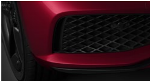
Front wheel air curtain