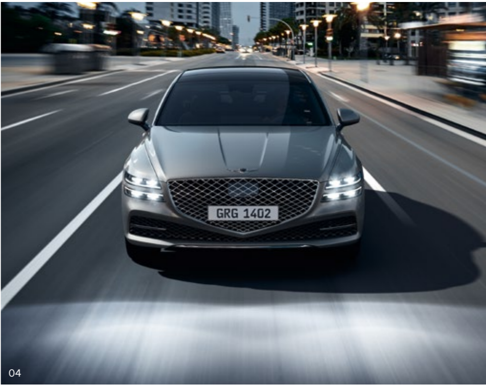
04. Intelligent Front-Lighting System (IFS) _ This system automatically activates or deactivates part of the high beam lights when it detects an oncoming vehicle or a vehicle ahead, to prevent glare for drivers of other vehicles. This supports safer driving at night as the high beam lights don't have to be adjusted manually.