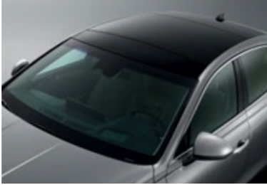
Double-jointed soundproof glass (windshield and all doors)