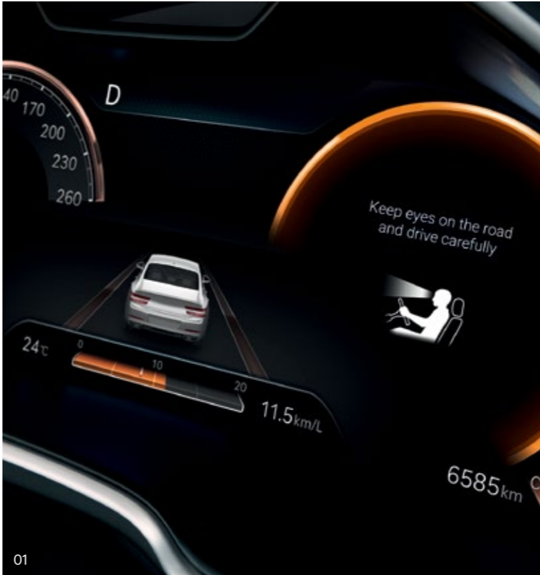
01. Forward Attention Warning (FAW) _ This system alerts the driver if inattentive driving patterns are detected.