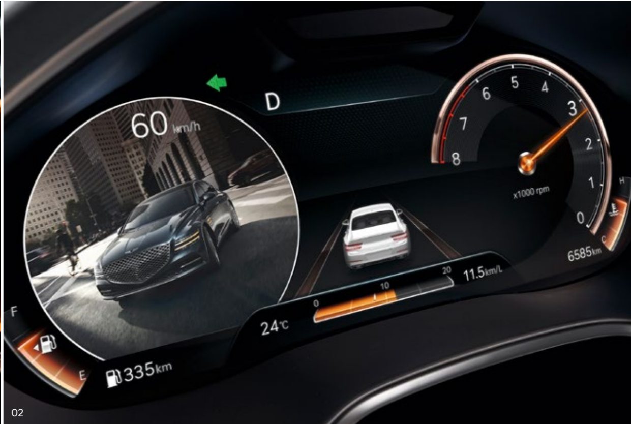
02. Blind-Spot View Monitor (BVM) system _ When the turn signals are activated, video images of the respective side/rear view of the vehicle appears on the center cluster.