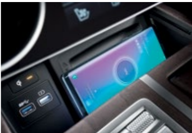
Wireless smartphone charging system