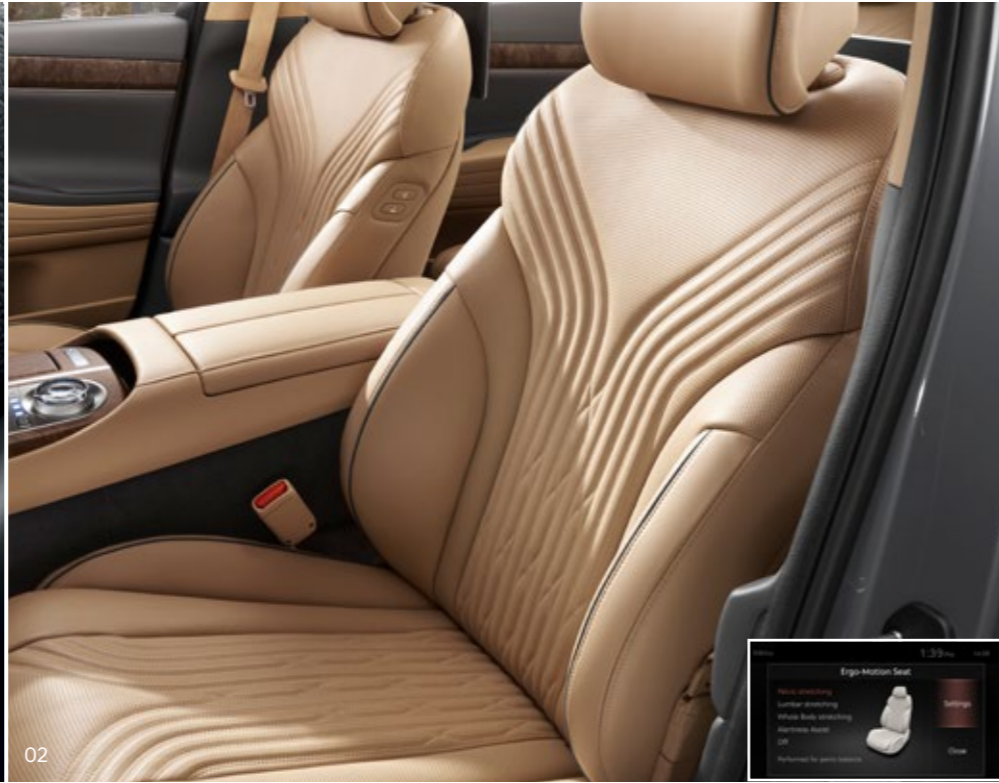
02. ERGO motion driver and passenger seats _ The driver seat and the passenger seat is equipped with ERGO motion seats featuring seven air cells that can be controlled individually to provide optimal seating. Linked to a drive mode or a speed set by the driver, this ergonomic feature can control lateral support. It also offers a stretching mode to reduce fatigue.