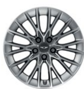
18" Diamond cut wheels