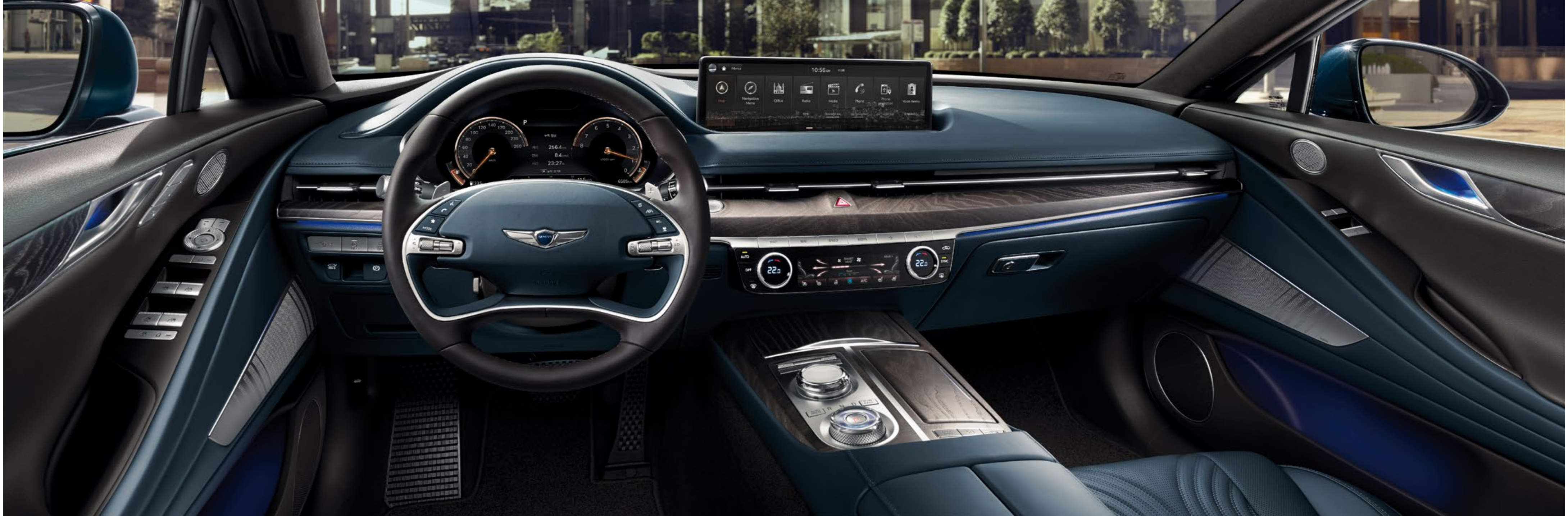
Forest blue mono-tone (maroon brown upper door trim / signature design selection II (ash color gradation real wood))