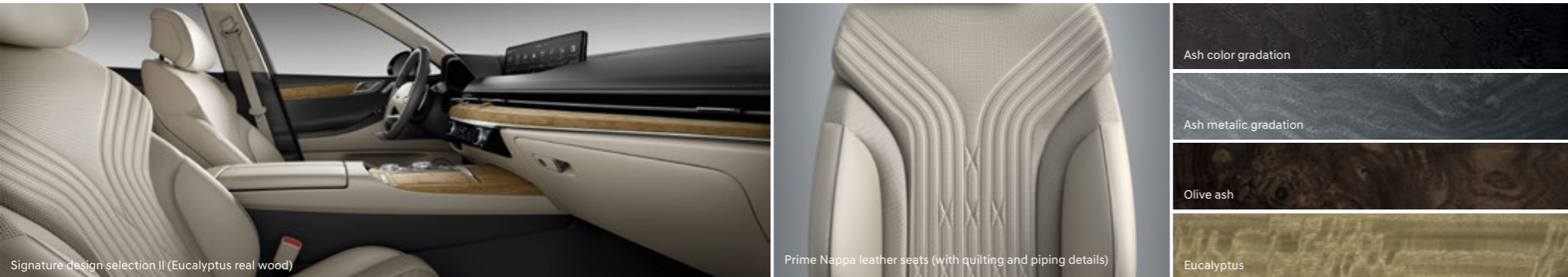
Anthracite gray/vanilla beige two-tone (Vanilla beige seats/anthracite gray upper door trim)