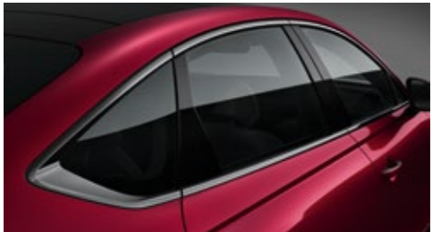
Dark chrome DLO molding