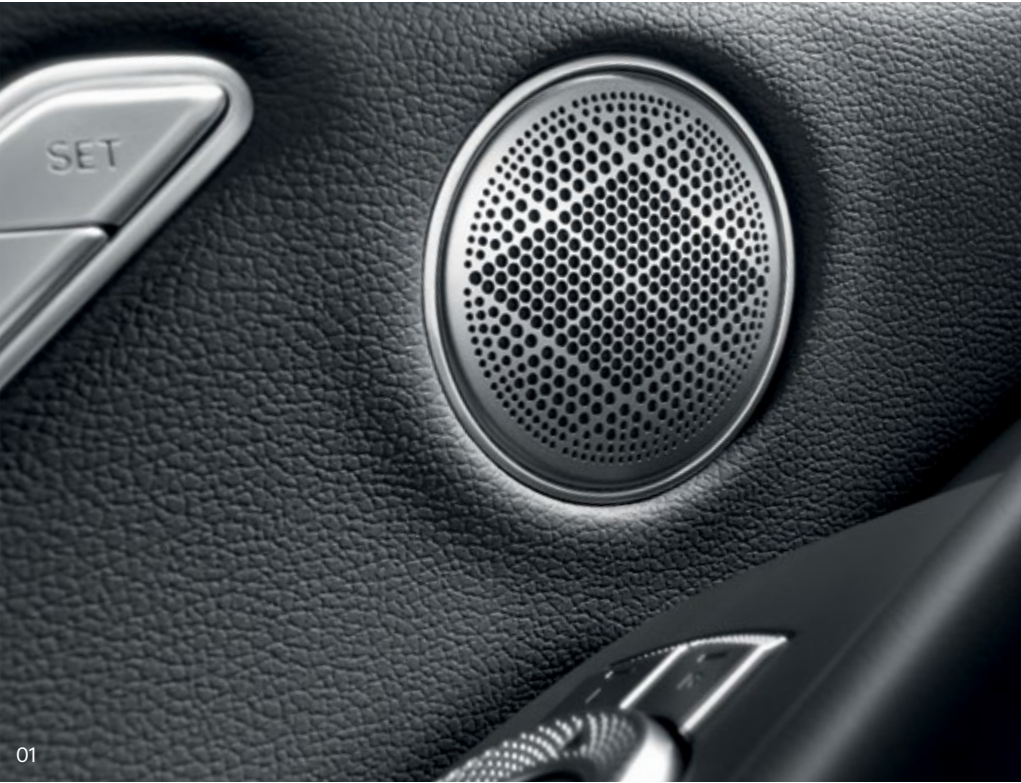
01. 18 Lexicon speakers system (Quantum Logic Surround) _ The Quantum Logic Surround mode allows passengers to enjoy more dynamic and vivid sound effects.

FROM THE WAY THE DOORS OPEN TO THE SMOOTH EMBRACE OF THE SEATS, NOVEL EXPERIENCES WILL ESCALATE INTO ULTIMATE COMFORT.