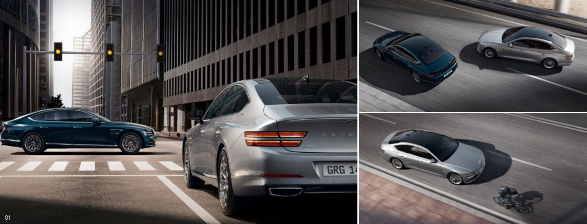
01. Forward Collision-Avoidance Assist (FCA) system (junction crossing, change oncoming, change side, evasive steering assist) _ This system helps to automatically bring the vehicle to a stop when there is a collision risk with another vehicle, cyclist or pedestrian that suddenly appears or stops ahead, or with vehicles approaching from the left or right side of an intersection. FCA helps to automatically steer the vehicle away from an oncoming vehicle or from a vehicle ahead in the adjacent lane if a collision risk increases while changing lanes, or when a pedestrian and/or cyclist gains proximity to a moving GENESIS G80 in the same lane.