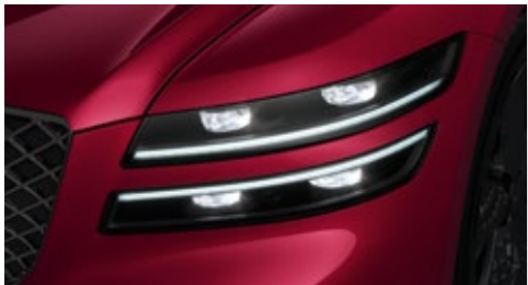
Full LED headlamps