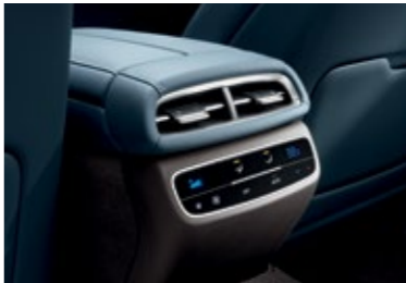
Rear seat climate controller