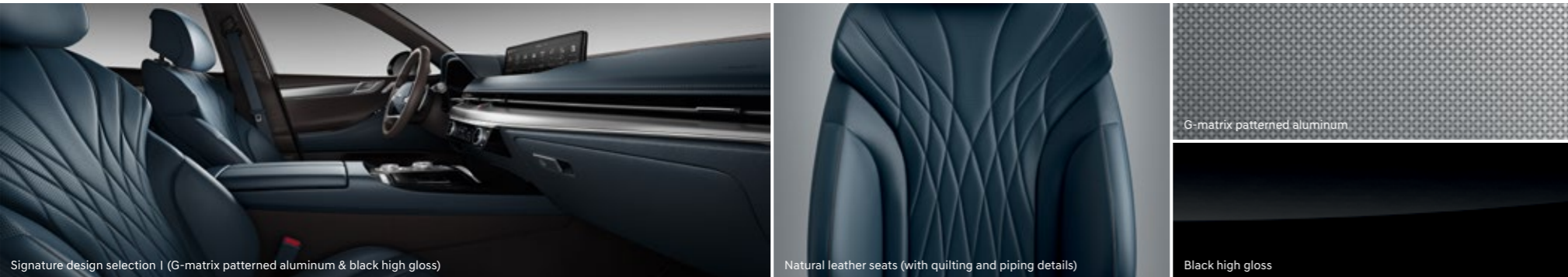
Forest blue mono-tone (Forest blue seats/maroon brown upper door trim)