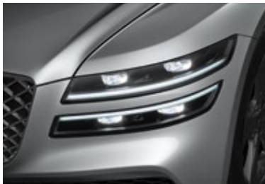
Full LED headlamps