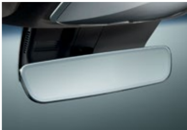
Frameless room Mirror