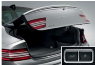
Smart electric trunk