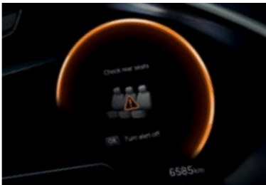
Rear occupant alert