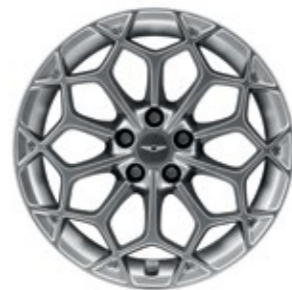
19" Hypersilver wheels [10 Y-spoke type (B)]