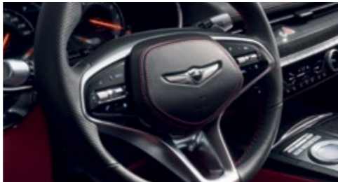
Three-spoke steering wheel