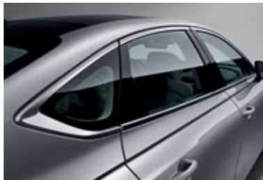
Chrome-coated surround molding