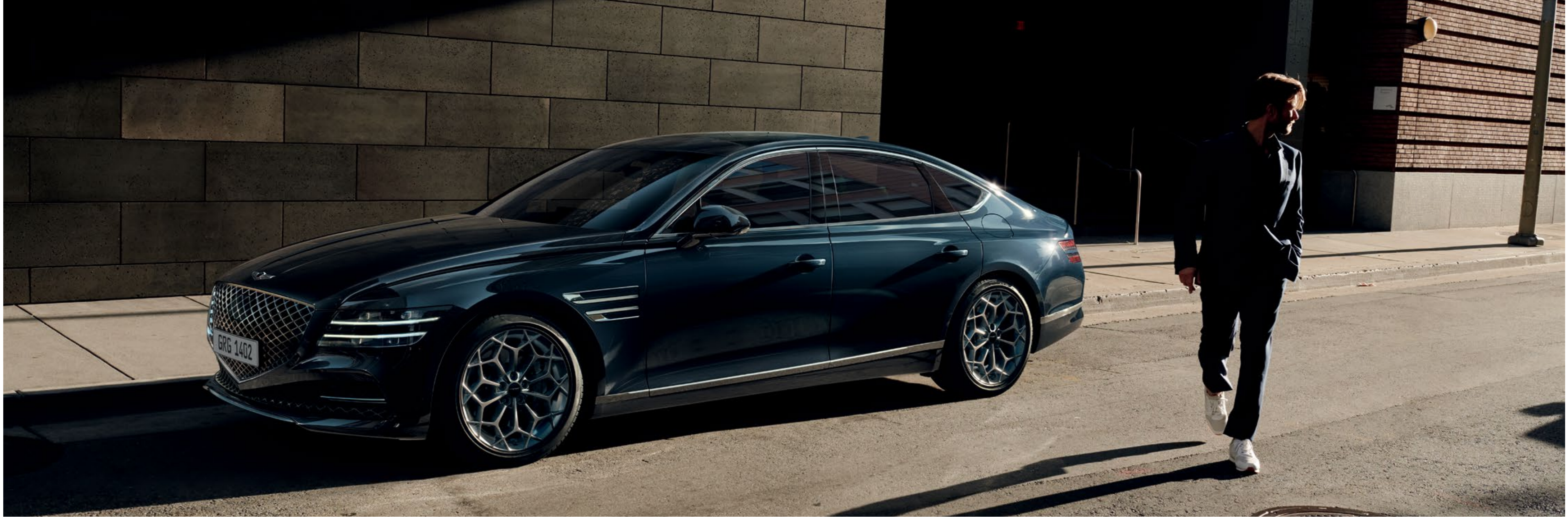
Tasman blue (19" Hypersilver wheels [10 Y-spoke type (B)])