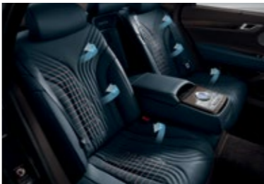
Rear seat warming & air cooling ventilation