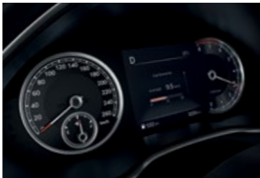
8" TFT LCD cluster