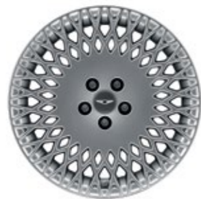
19" Hypersilver wheels [Dish type (A)]