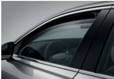
Safety power window