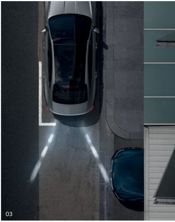
03. Reverse guiding lamps _ When in reverse, these LED lights are angled to illuminate the ground behind the vehicle. This allows pedestrians and other vehicles to easily notice that the vehicle is reversing, maximizing safety and preventing accidents.