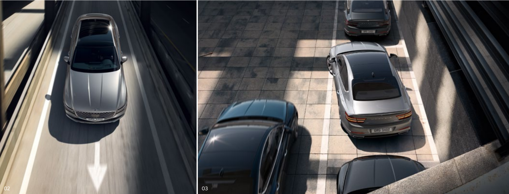
02. Lane Keeping Assist (LKA) system _ This system alerts the driver if the vehicle leaves the lane while driving over a certain speed and without the use of the turn signals. LKA may also apply steering wheel control if the vehicle leaves the lane. Lane Following Assist (LFA) system _ This helps assist steering to keep the vehicle centered in its current lane.