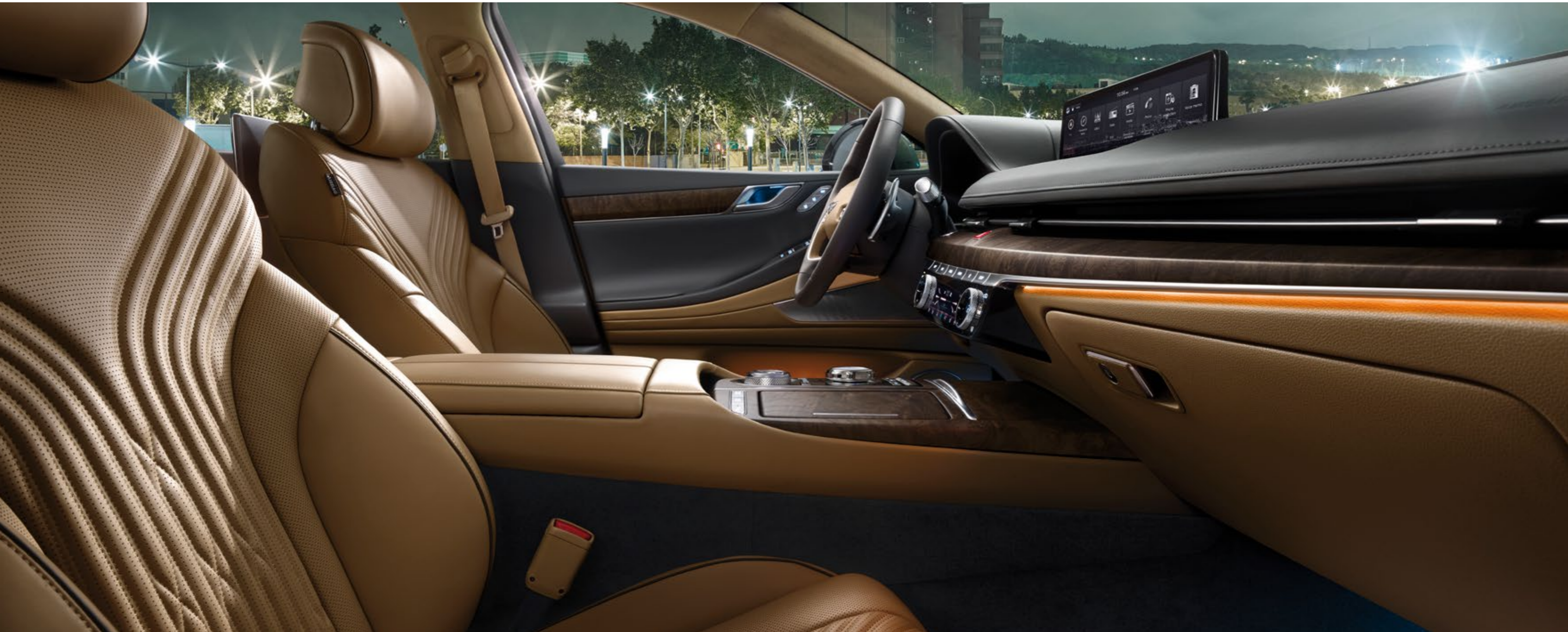
Anthracite gray/dune beige two-tone (anthracite gray upper door trim / signature design selection II (olive ash real wood))