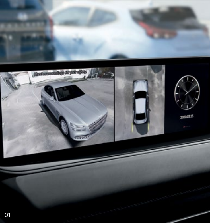
01. Surround View Monitor (SVM) system _ Video images of the area surrounding the vehicle can be viewed to assist in safe parking.

ENJOY MAXIMUM SAFETY AND ULTIMATE COMFORT AT ALL TIMES AS GENESIS G80 SURROUNDS YOU WITH CUTTING-EDGE TECHNOLOGY.