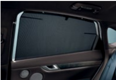
Manual rear door curtains