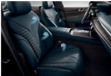
Front seat warming & air cooling ventilation