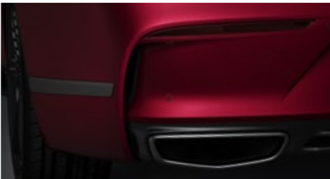
Rear bumper side air vent & edge