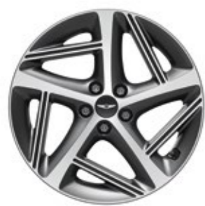
19" Diamond cut wheels