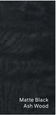
Matte Black Ash Wood