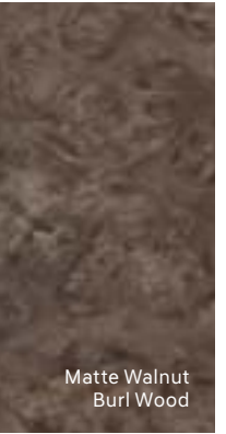
Matte Walnut Burl Wood