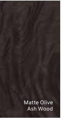
Matte Olive Ash Wood