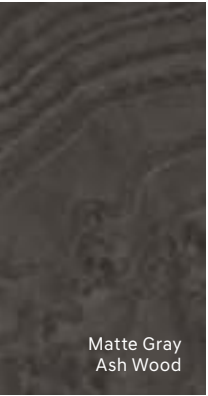
Matte Gray Ash Wood