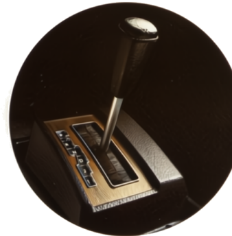
A locking console is standard with either the 4-speed manual or the 3-speed automatic.

Since the 1800E is a Volvo it has a heating system designed to compete with Swedish winters. There's also an electric rear window defroster and a flow-through air ventilation system. Tinted glass in standard too.