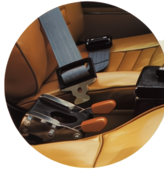
The front seats have factory-fitted three-point safety belts. Convenient snap-action locks.