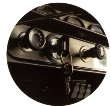
A warning buzzer will remind you if the ignition key was left behind.