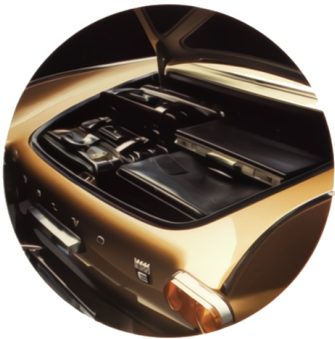
The trunk holds what many sports car trunks don't hold, a sensible amount of luggage.