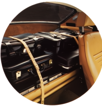
What the generous sized trunk won't hold you can stow behind the seats.