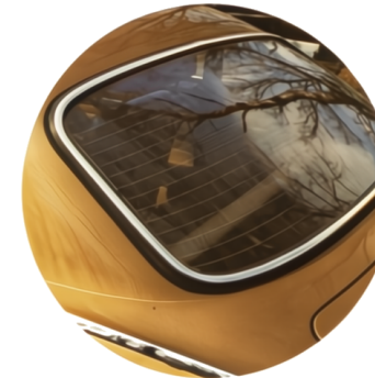
Electric rear window defrosting dries up mist and melts ice. With 150 watts of power.