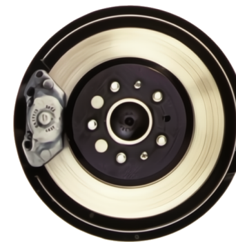
Disc brakes on all four wheels. 83-square inches of pad area and power assist too.