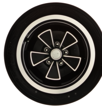
Styled wheels have cast aluminum hubs welded to 15-inch safety steel rims.