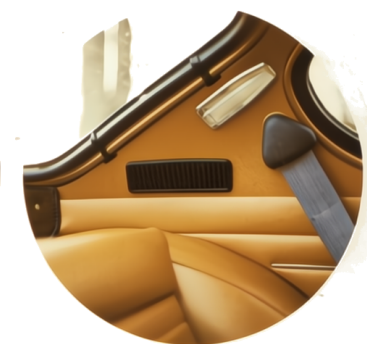
Flow-through ventilation for comfort and a locking gas cap for security are 1800E features.