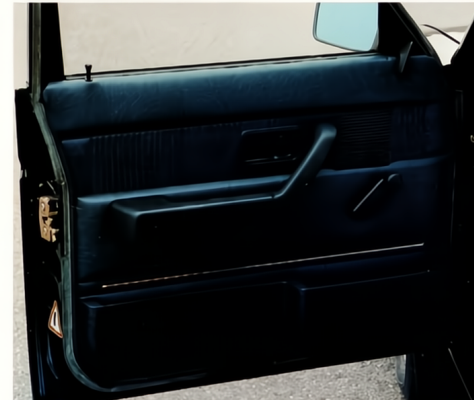
Both front doors are fitted with roomy storage compartments.