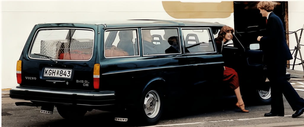
The Volvo Transfer comes with the option of diesel (making it the first 6-cylinder diesel car in the world) or petrol power units.

The Volvo Transfer is built with safety in mind. The front of the vehicle incorporates a long deformation zone which absorbs impact forces in the event of an accident. The safety cage design provides good protection for passengers and driver.