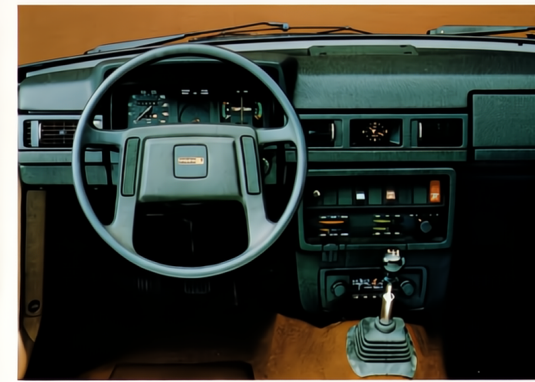
The excellent driving position with all controls and instruments within easy reach and sight takes the strain out of long hours of driving.