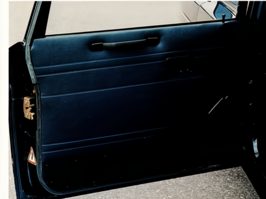
Sturdy handles on the side doors make it easier to enter and leave the car. The doors are also fitted with protective kick plates.

The Volvo Transfer is built with safety in mind. The front of the vehicle incorporates a long deformation zone which absorbs impact forces in the event of an accident. The safety cage design provides good protection for passengers and driver.