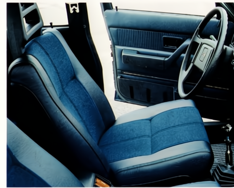
Volvo's driving seat is anatomically shaped and provides the correct lumbar support for the driver.

The Volvo 245 Transfer – the perfect solution to your special needs.