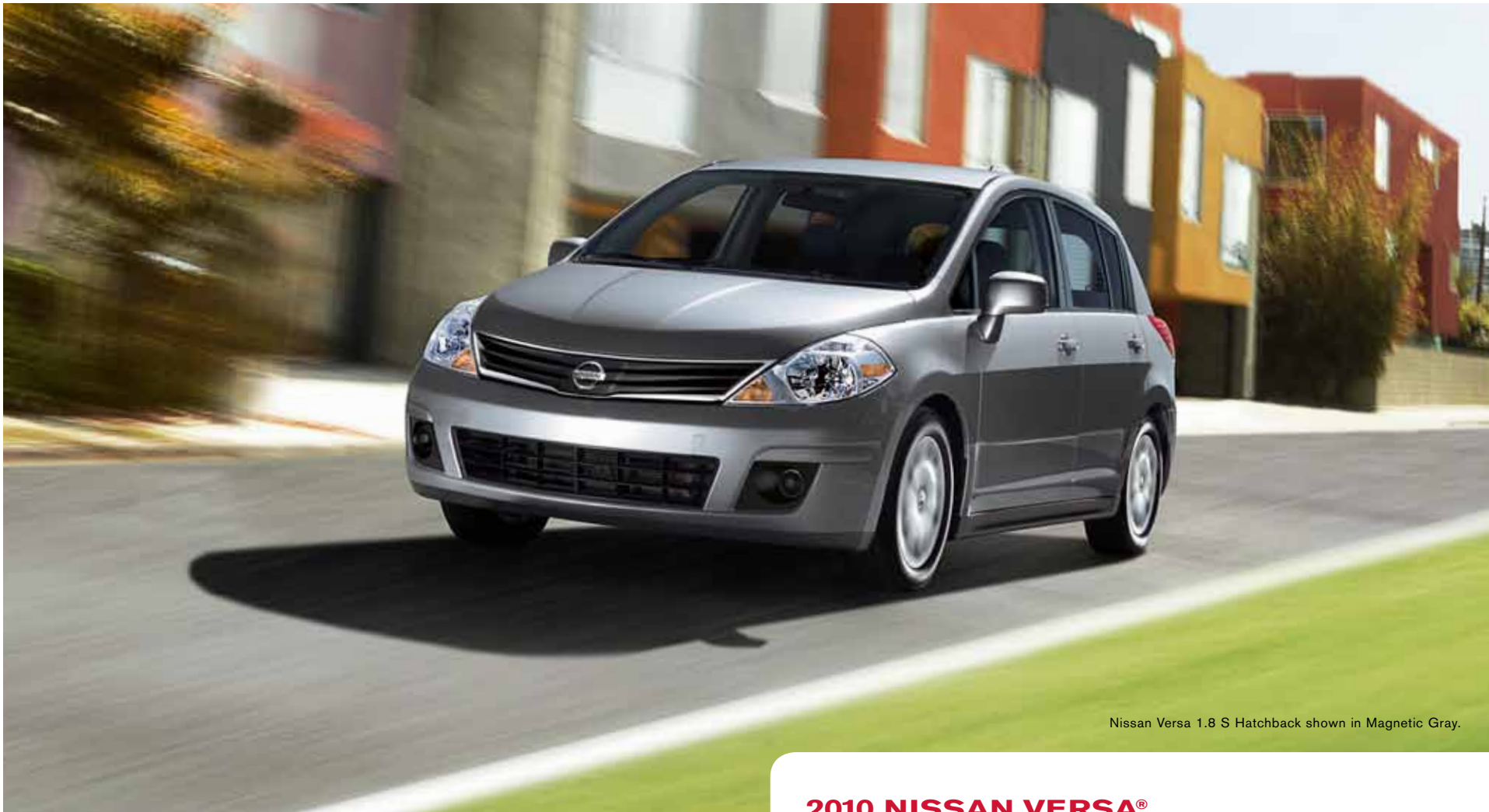
Nissan Versa 1.8 S Hatchback shown in Magnetic Gray.