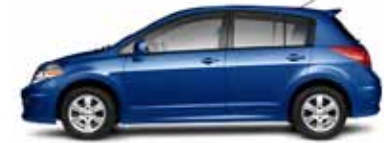
1.8 SL: HATCHBACK AND SEDAN