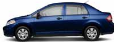
1.6: SEDAN ONLY