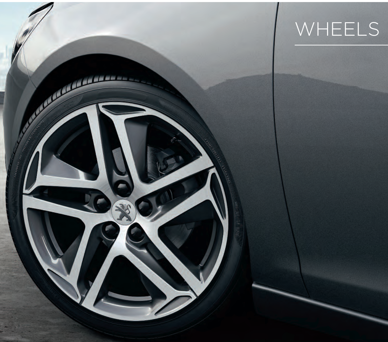
18" 'Saphir' Alloy Wheels