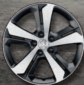
17" 'Rubis' Alloy Wheels