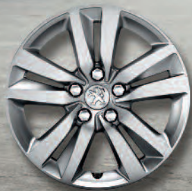
16" 'Quartz' Alloy Wheels