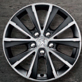
16" 'Diamond' Alloy Wheels