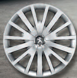
15" Steel Wheels with 'Ambre' Wheel Trims