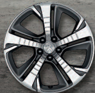
18" 'Diamant' Alloy Wheels