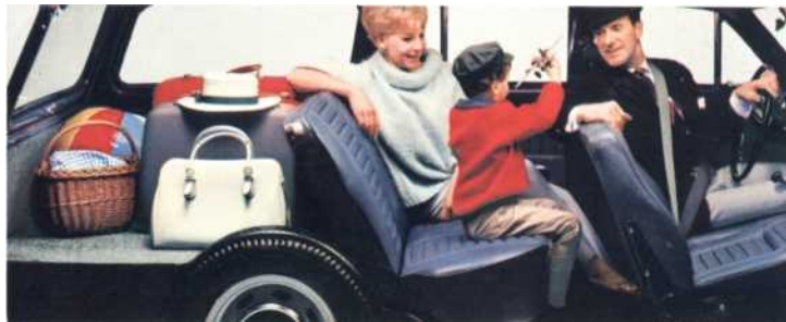
The Volvo Station Wagon for the family man.