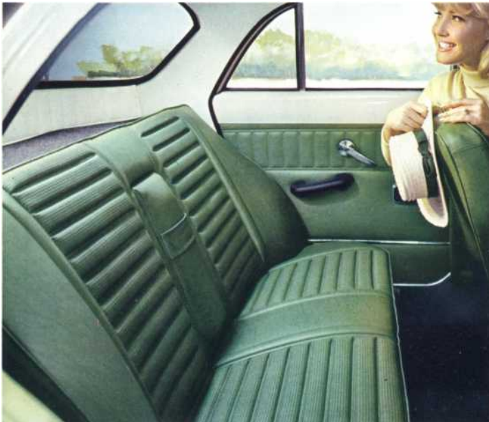
Deeply upholstered rear seat with folding armrest.