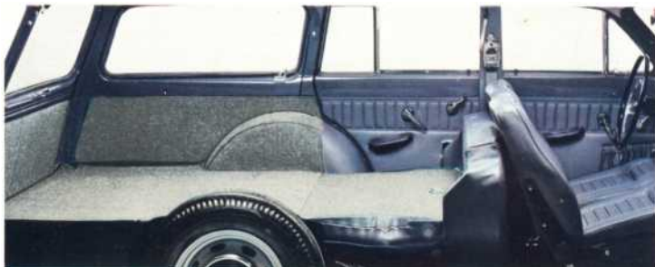
Four doors give easy access to cargo area