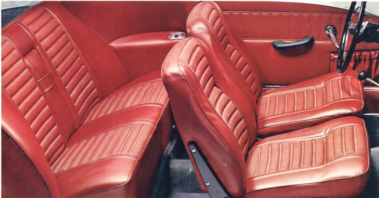
Unique seating with infinitely variable adjustment.