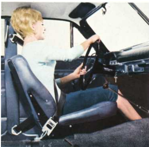
Standard seat belts, padded dash and padded visors.