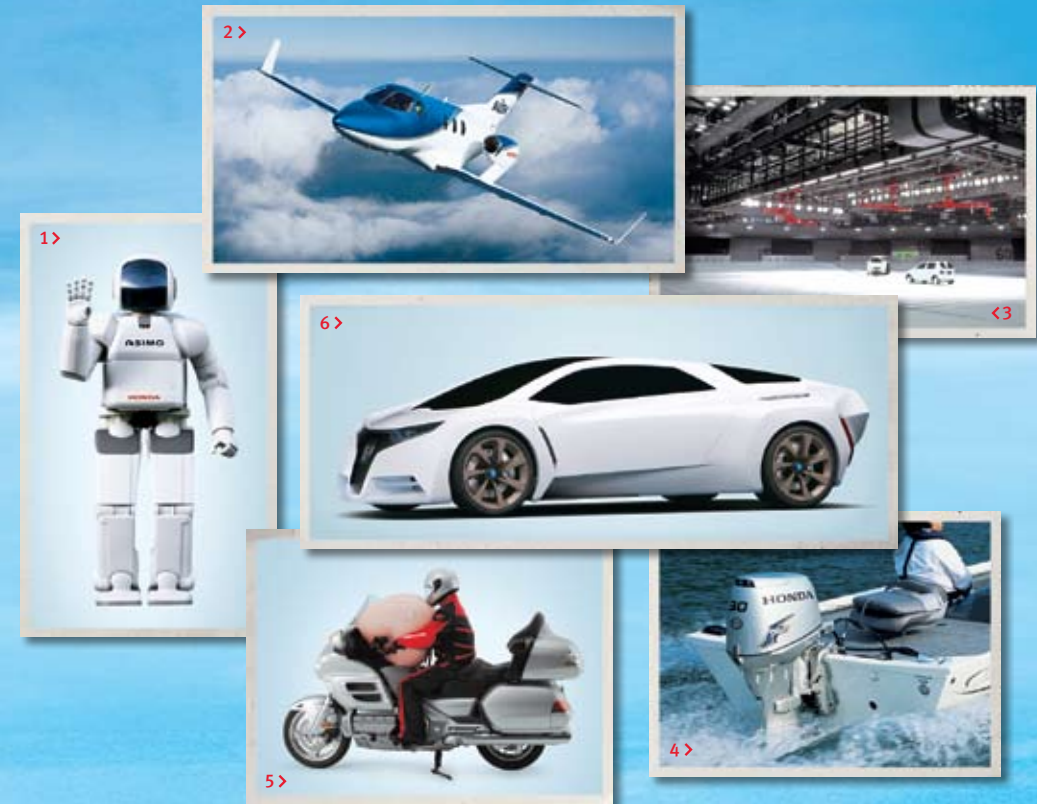
1> ASIMO™, the advanced life-assisting humanoid robot 2> The high-speed, fuel-efficient HondaJet™ 3> Honda's advanced safety research and development facility in Tochigi, Japan 4> First manufacturer of a full line of cleaner 4-stroke outboard motors 5> The world's first motorcycle safety airbag 6> The Honda FC Sport, our advanced hydrogen fuel-cell concept vehicle

As the world's largest engine manufacturer, Honda has a proud tradition of turning innovative ideas into products that help make Canada and the world around us brighter and a little more fun. These products are equipped with some of the cleanest, most fuel-efficient engines you'll find on the road, in the water or high above the clouds. And as technically ingenious as these products are, they are all brought to life by The Power of Dreams®.