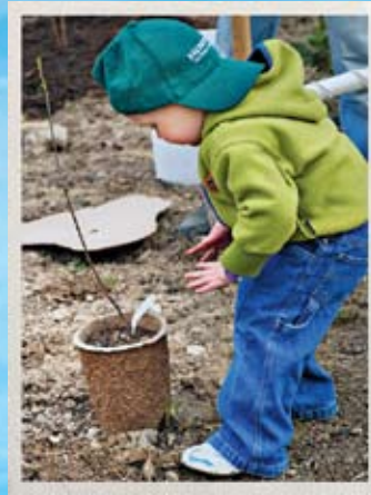
Honda associates and families have helped plant more than 71,000 trees in Canada over the last 5 years.

As the world's largest engine manufacturer, Honda has a proud tradition of turning innovative ideas into products that help make Canada and the world around us brighter and a little more fun. These products are equipped with some of the cleanest, most fuel-efficient engines you'll find on the road, in the water or high above the clouds. And as technically ingenious as these products are, they are all brought to life by The Power of Dreams®.