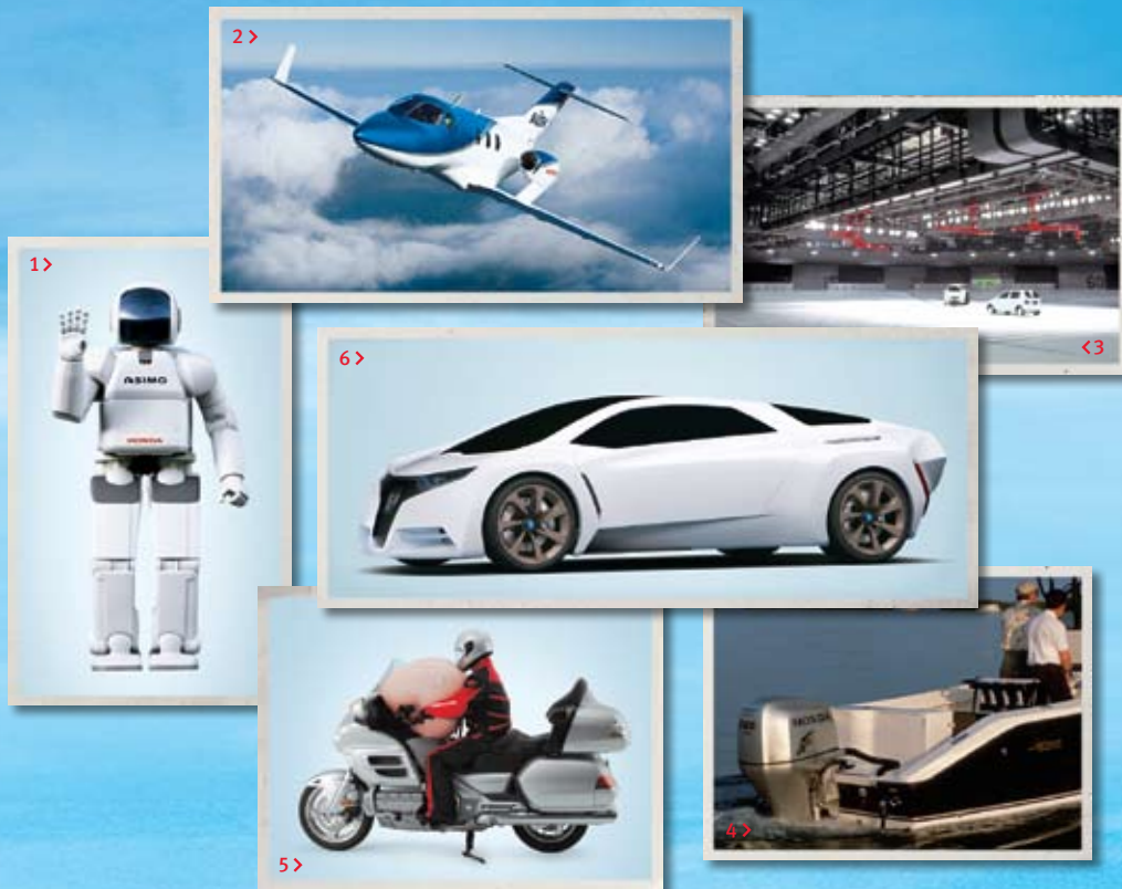
1> ASIMO™, the advanced life-assisting humanoid robot 2> The high-speed, fuel-efficient HondaJet™ 3> Honda's advanced safety research and development facility in Tochigi, Japan 4> First manufacturer of a full line of cleaner 4-stroke outboard motors 5> The world's first motorcycle safety airbag 6> The Honda FC Sport, our advanced hydrogen fuel-cell concept vehicle

As the world's largest engine manufacturer, Honda has a proud tradition of turning innovative ideas into products that help make Canada and the world around us brighter and a little more fun. These products are equipped with some of the cleanest, most fuel-efficient engines you'll find on the road, in the water or high above the clouds. And as technically ingenious as these products are, they are all brought to life by The Power of Dreams®.