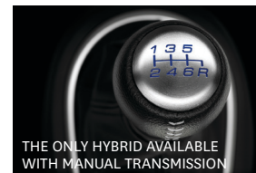
THE ONLY HYBRID AVAILABLE WITH MANUAL TRANSMISSION