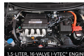
1.5-LITER, 16-VALVE I-VTEC® ENGINE