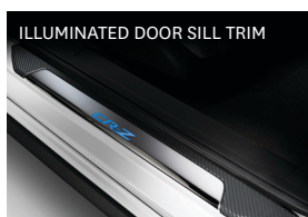
ILLUMINATED DOOR SILL TRIM