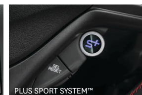
PLUS SPORT SYSTEM™

The CR-Z . It's sport. It's hybrid. See both sides at Honda.ca