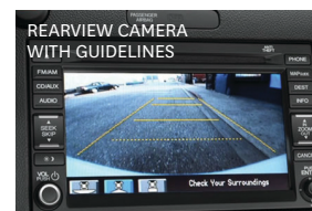
REARVIEW CAMERA WITH GUIDELINES