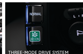
THREE-MODE DRIVE SYSTEM