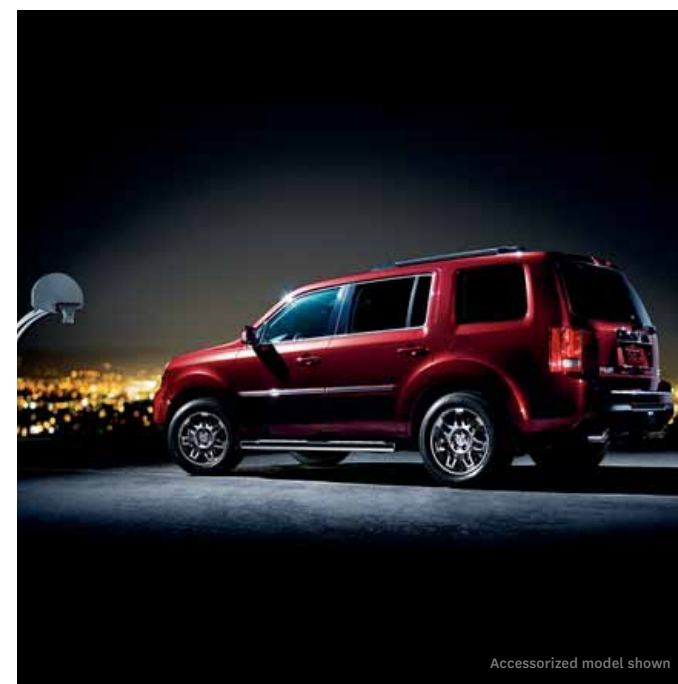
Accessorized model shown