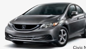
Civic Natural Gas