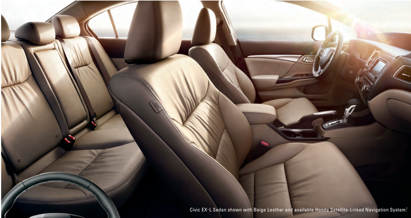
Civic EX-L Sedan shown with Beige Leather and available Honda Satellite-Linked Navigation System. 1

Some things never go out of style. Like having style. The 2013 Civic has plenty of it. Exhibit A: the luxurious interior. It's spacious, comfortable and the perfect place to get away from it all. When you want to stay connected, there's lots of intuitive technology like Bluetooth 4 HandsFreeLink ® and an available Honda Satellite-Linked Navigation System 1 with voice recognition. All of which proves that being smart is stylish too.