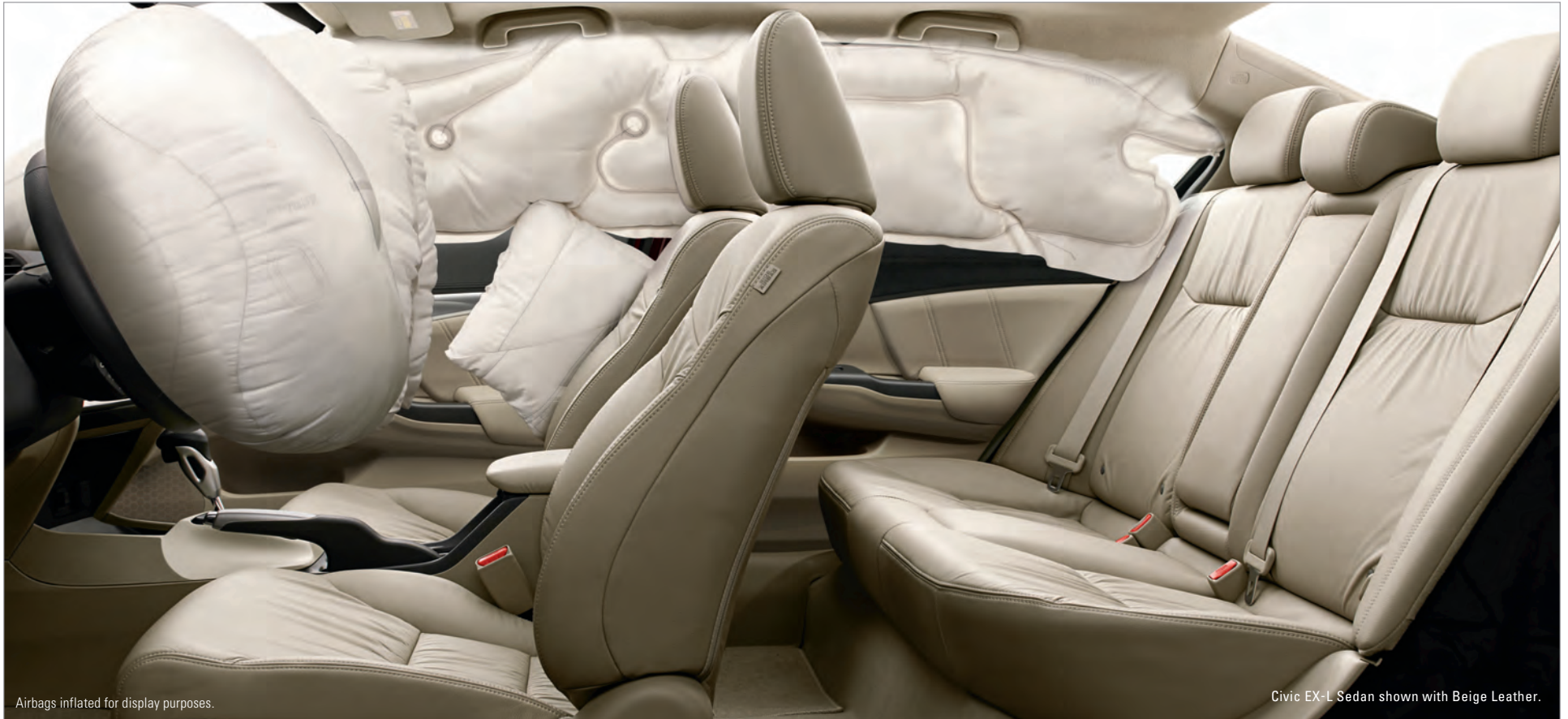
Airbags inflated for display purposes.

The latest iteration of our exclusive Advanced Compatibility Engineering™ (ACE) body structure helps increase occupant protection by using the latest crash energy dispersion structures.