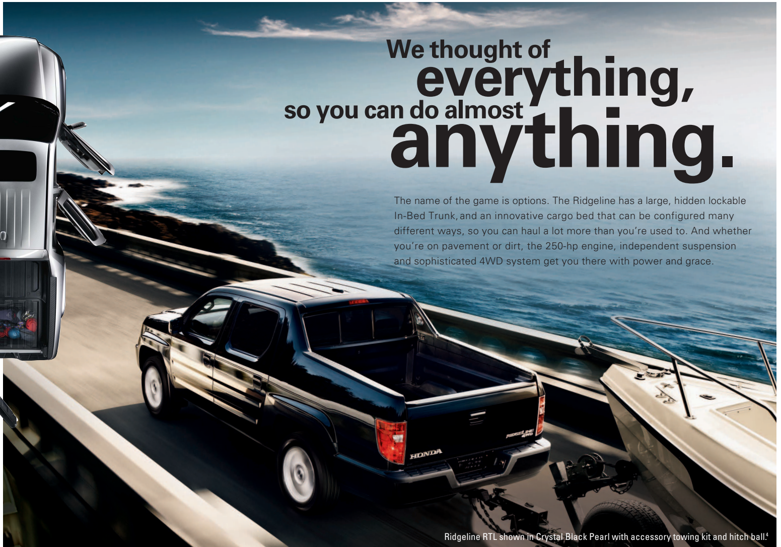
Ridgeline RTL shown in Crystal Black Pearl with accessory towing kit and hitch ball. 4

Honda reminds you to properly secure items stored in the cargo area.