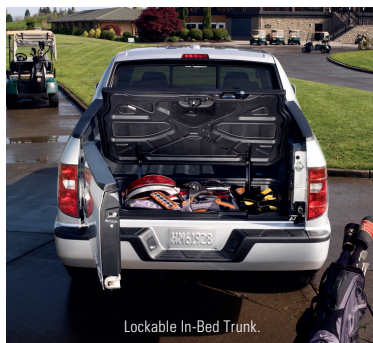
Lockable In-Bed Trunk.