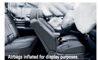
Airbags inflated for display purposes.

The Ridgeline's first line of defense is a reinforced unit body that incorporates a closed-box frame with internal high-strength steel frame stiffeners. Both the frame rails and all seven crossmembers feature box-section construction. The result is a remarkably high torsional rigidity.