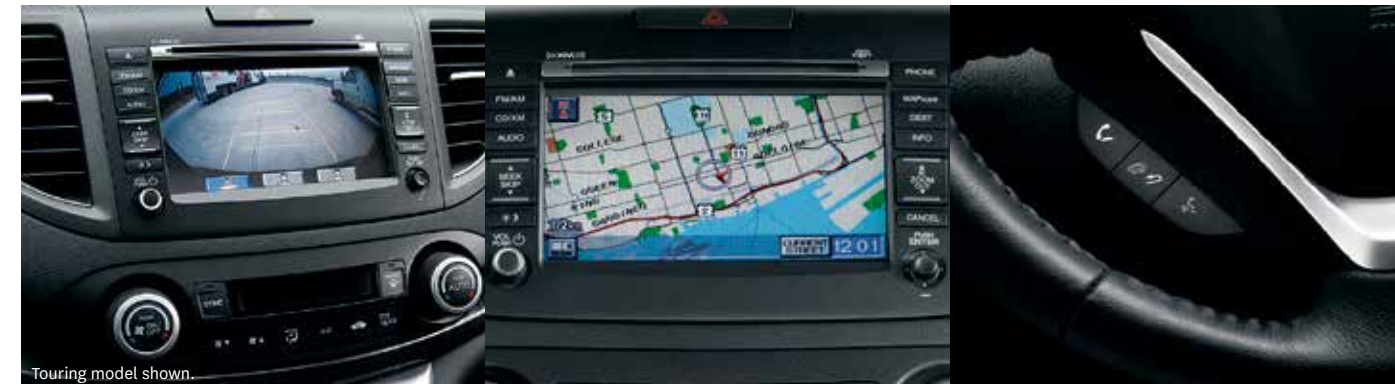
Touring model shown.