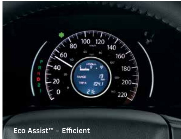
Eco Assist™ – Efficient