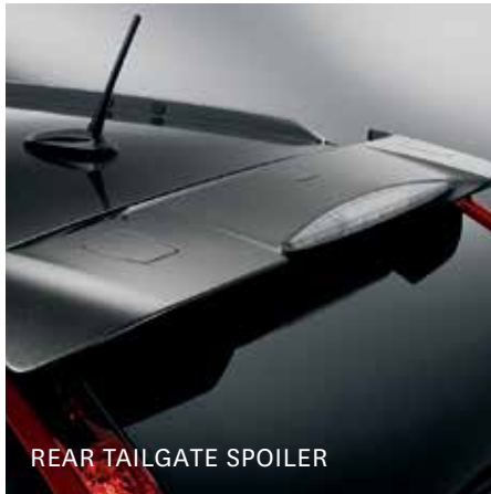
REAR TAILGATE SPOILER