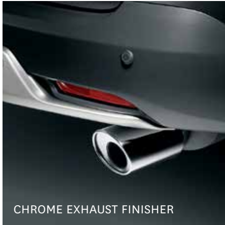
CHROME EXHAUST FINISHER