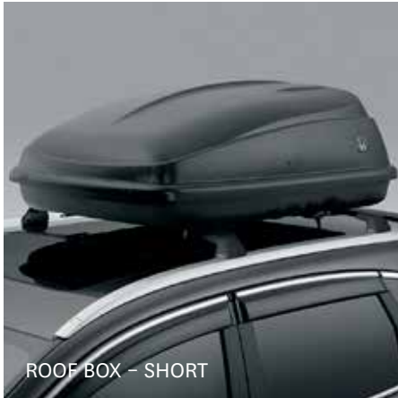
ROOF BOX - SHORT