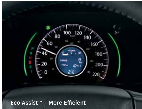
Eco Assist™ – More Efficient