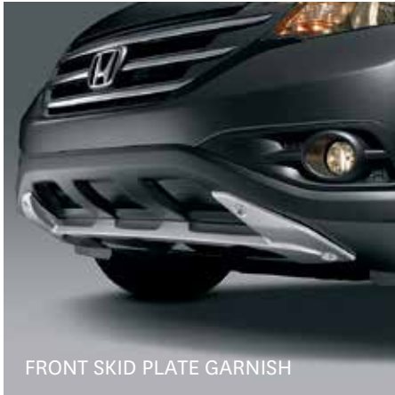
FRONT SKID PLATE GARNISH