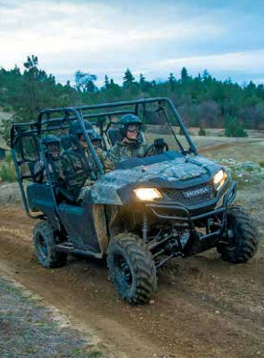
SIDE BY SIDE