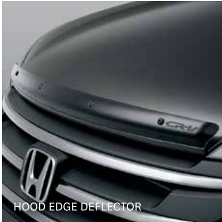
HOOD EDGE DEFLECTOR