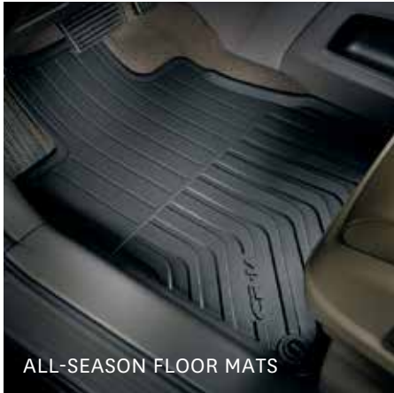
ALL-SEASON FLOOR MATS

Accessories listed in the packages may also be added individually to your CR-V.