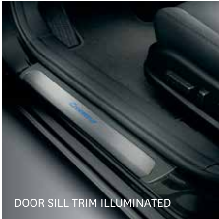
DOOR SILL TRIM ILLUMINATED