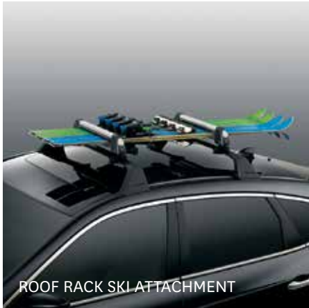
ROOF RACK SKI ATTACHMENT