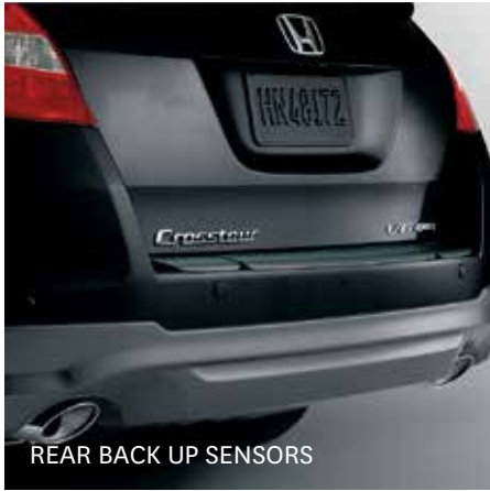
REAR BACK UP SENSORS