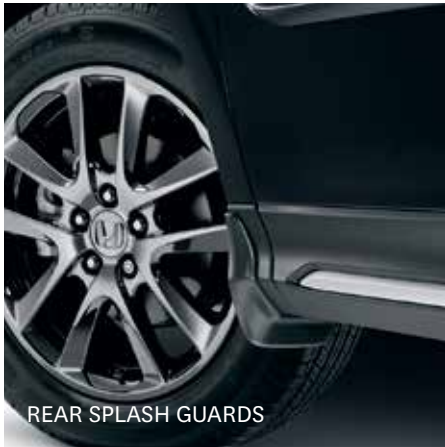
REAR SPLASH GUARDS