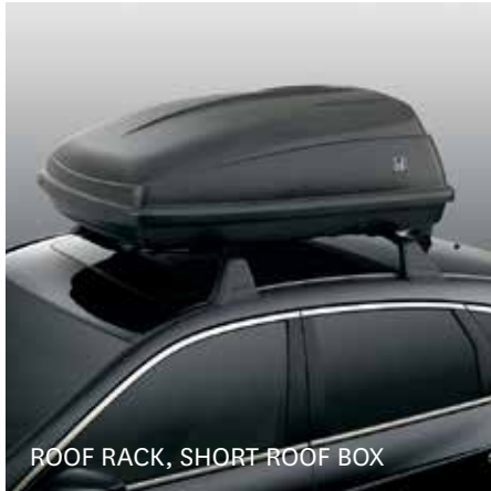
ROOF RACK, SHORT ROOF BOX