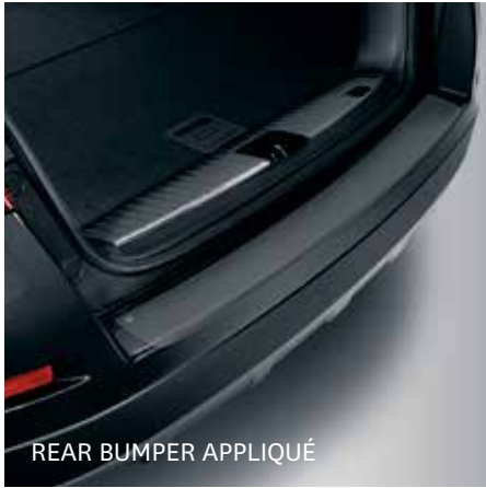
REAR BUMPER APPLIQUÉ