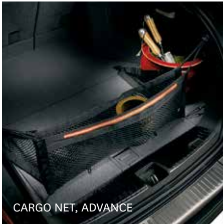
CARGO NET, ADVANCE