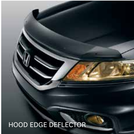
HOOD EDGE DEFLECTOR