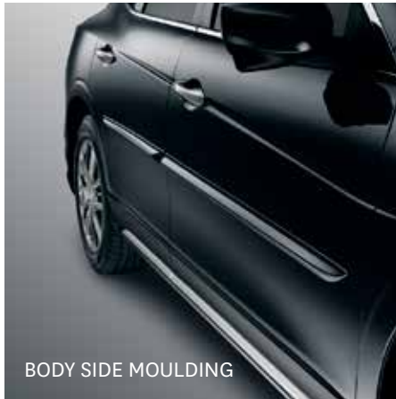
BODY SIDE MOULDING