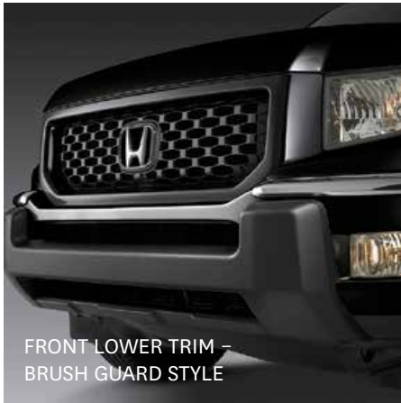
FRONT LOWER TRIM – BRUSH GUARD STYLE