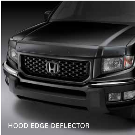
HOOD EDGE DEFLECTOR

Accessories listed in the packages may also be added individually to your Ridgeline.