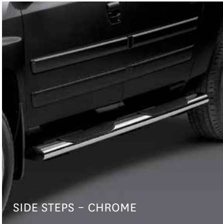
SIDE STEPS – CHROME