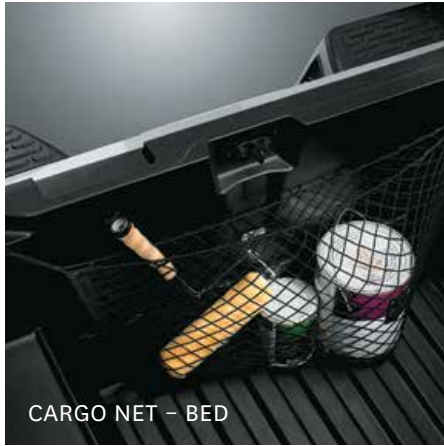
CARGO NET – BED