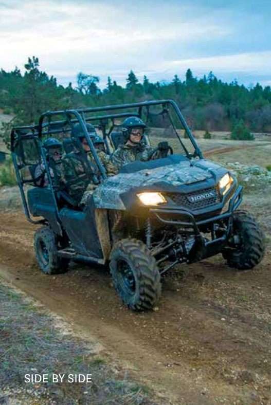
SIDE BY SIDE