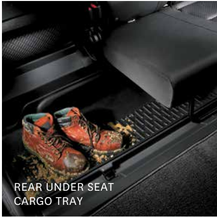
REAR UNDER SEAT CARGO TRAY