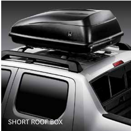
SHORT ROOF BOX