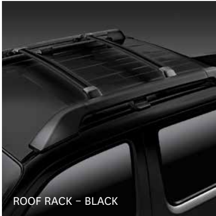
ROOF RACK – BLACK