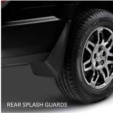
REAR SPLASH GUARDS