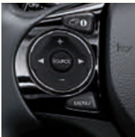
Steering wheel audio controls

*For a list of compatible phones, please refer to www.hondahandsfree.com .