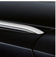
Silver roof rails