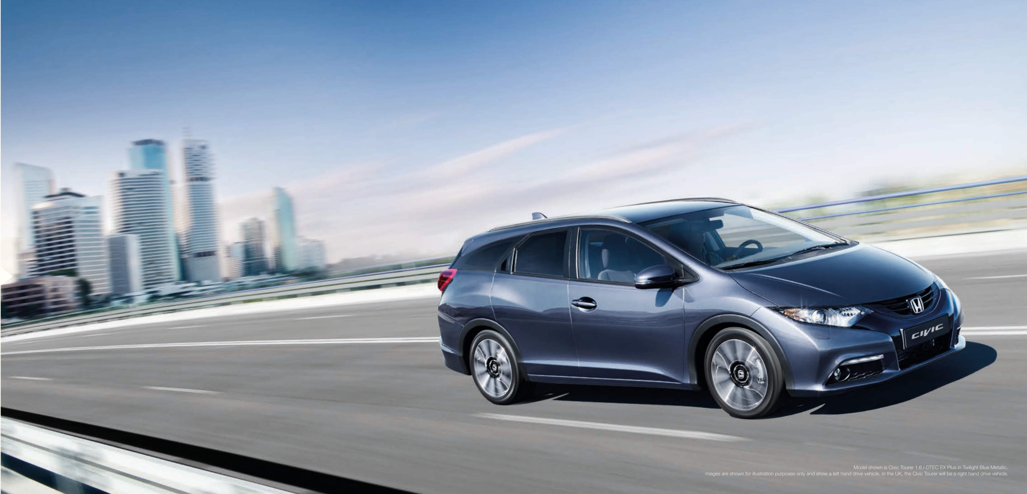
Model shown is Civic Tourer 1.6 i-DTEC EX Plus in Twilight Blue Metallic. Images are shown for illustration purposes only and show a left hand drive vehicle. In the UK, the Civic Tourer will be a right hand drive vehicle.

We've created an aerodynamic family car with a completely unique profile, so you don't have to compromise style for space.