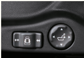
Driver's lumbar and side seat support adjustment*

As you can see, we have your comfort in mind.