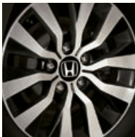
16" Aero alloys (i-DTEC)