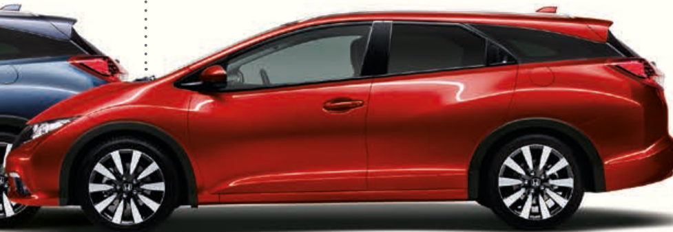
Passion Red Pearl