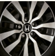
16" Aero alloys (i-DTEC)