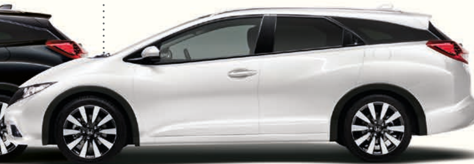
White Orchid Pearl