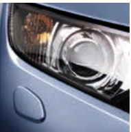
Bi-HID headlights with auto levelling and headlight washers

*For more information on the Driver Assistance Safety Packs please refer to pages 25-26.