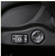
Drivers lumbar and side support adjustment