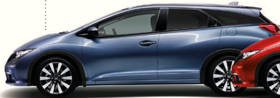
Twilight Blue Metallic