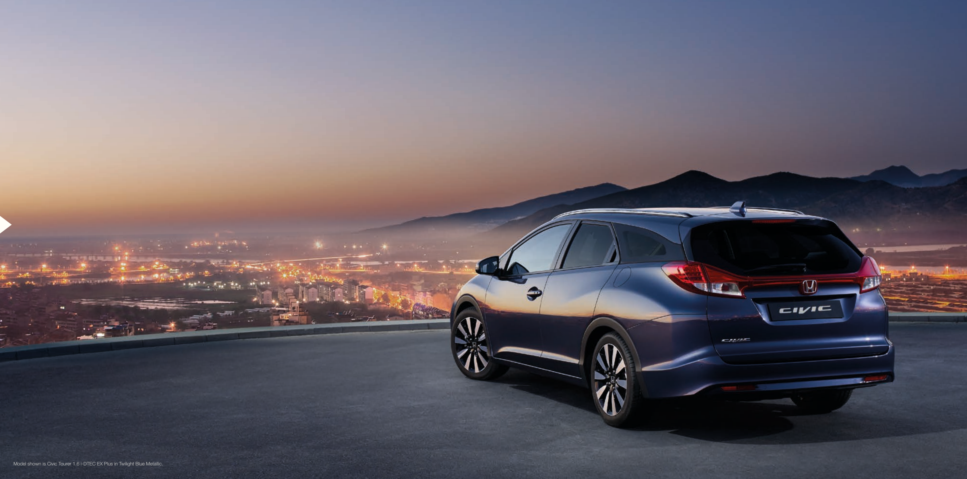
Model shown is Civic Tourer 1.6 i-DTEC EX Plus in Twilight Blue Metallic.

The sculpted headlights, hidden door handles and shark-fin antenna were all designed to add style while reducing drag, lowering emissions, and providing a smoother, quieter ride, as with the whole Civic range.