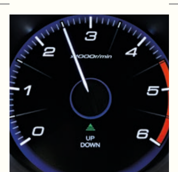
Shift indicator light