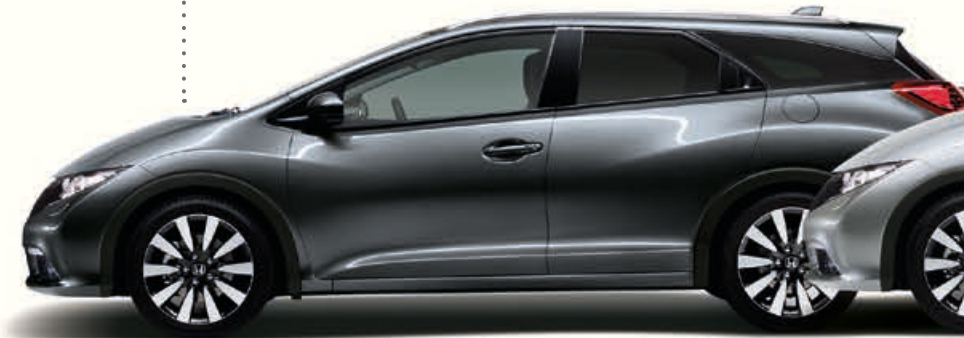
Polished Metal Metallic