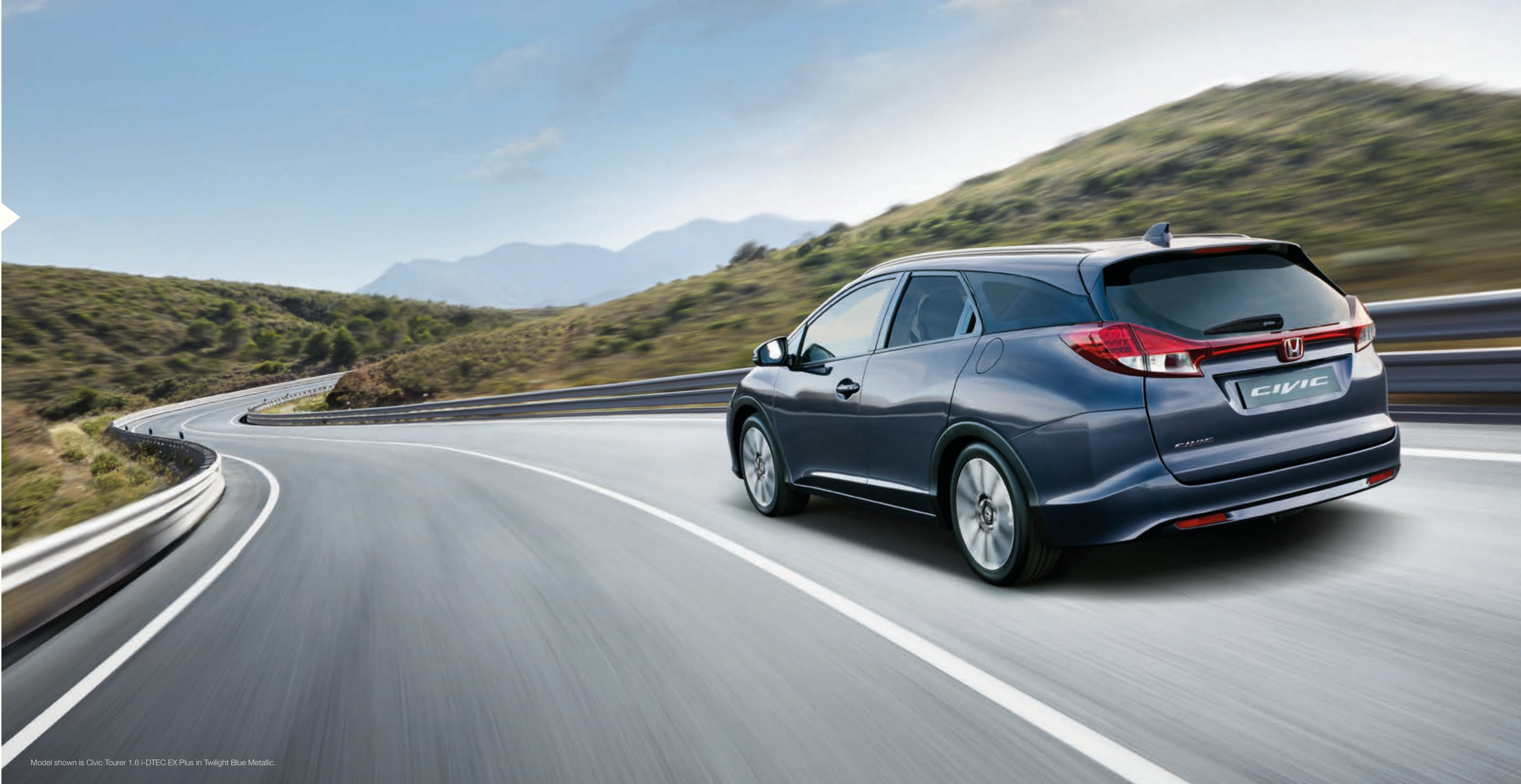
Model shown is Civic Tourer 1.6 i-DTEC EX Plus in Twilight Blue Metallic.

Available in manual and automatic 5 speed transmission, our intelligent variable valve system (that's the 'i' in i-VTEC) delivers an advanced driving experience with effortless power and fuel economy, so you can just sit back and enjoy the drive.