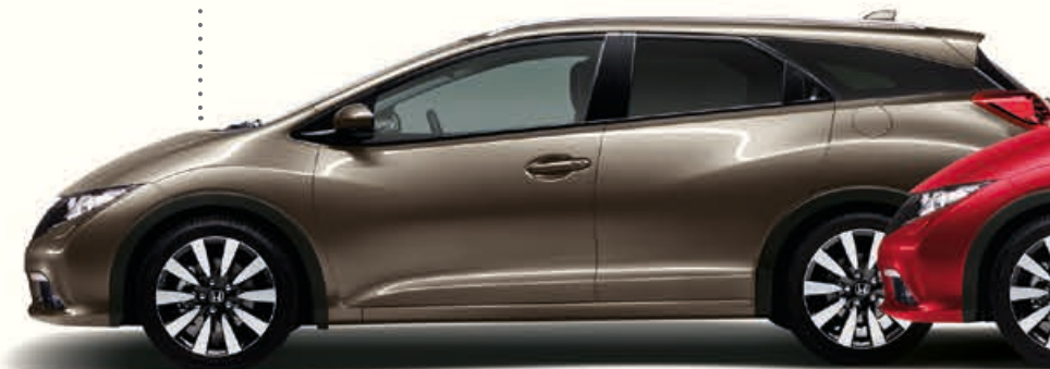
Urban Titanium Metallic