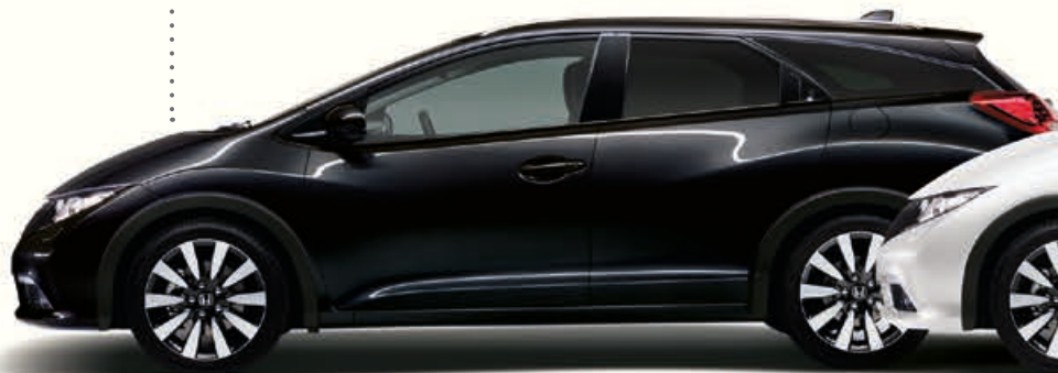
Crystal Black Pearl