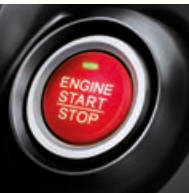
Smart keyless entry and start

With the addition of Collision Mitigation Braking System Adaptive Cruise Control