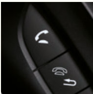
Bluetooth® Hands Free (HFT)†

†For a list of compatible phones, please refer to www.hondahandsfree.com