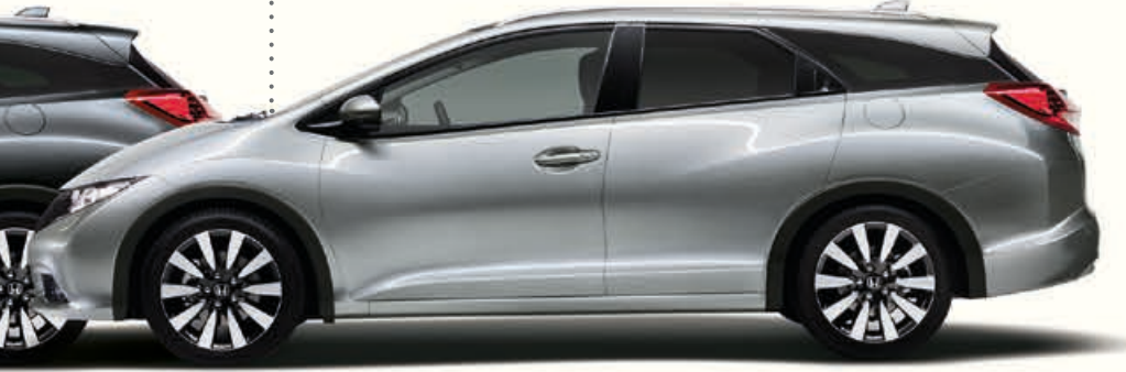
Alabaster Silver Metallic