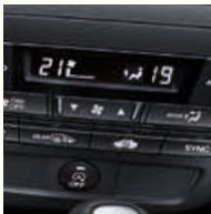
Dual zone air conditioning